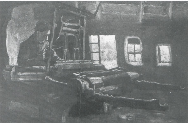
fig. 6 Vincent van Gogh, Weaver: interior with three small windows (F 30 JH 479), 1884, Otterlo, Kröller-Müller Museum