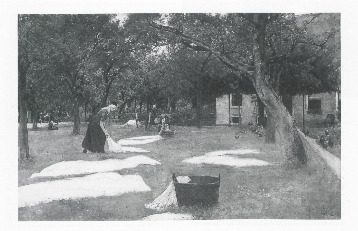
fig. 1 Max Liebermann, Bleaching (Zweeloo) , 1882-83, Cologne, Wallraf-Richartz-Museum