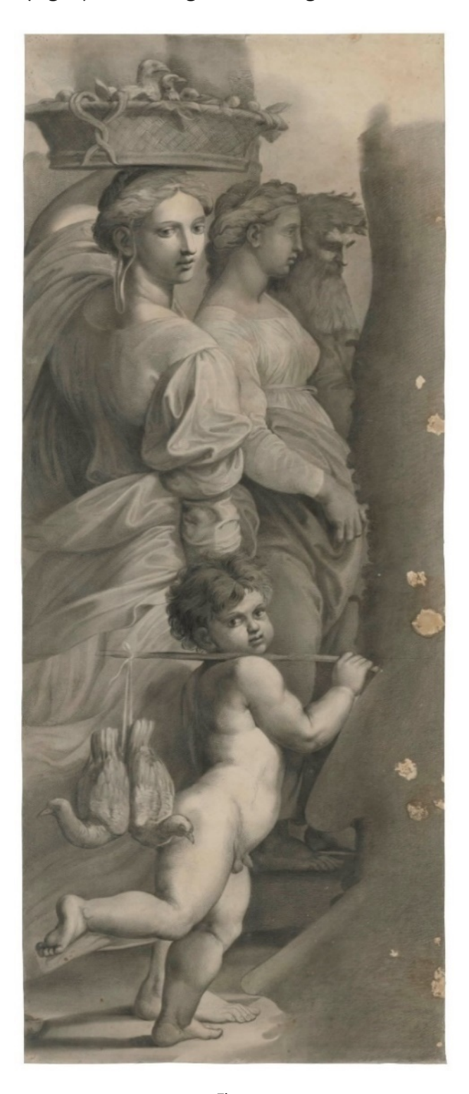
Fig. 7 Ludwig Gruner (Dresden 1801 – Dresden 1882), "The Healing oft he Lame Man", detail © Kupferstich-Kabinett, Staatliche Kunstsammlungen Dresden, C 1960-46, photo: Herbert Boswank

subsequently", "the accomplished study of the unclothed boy" and the "larger version of the Death of Ananias" (Fig. 8) are among the drawings found in Dresden.