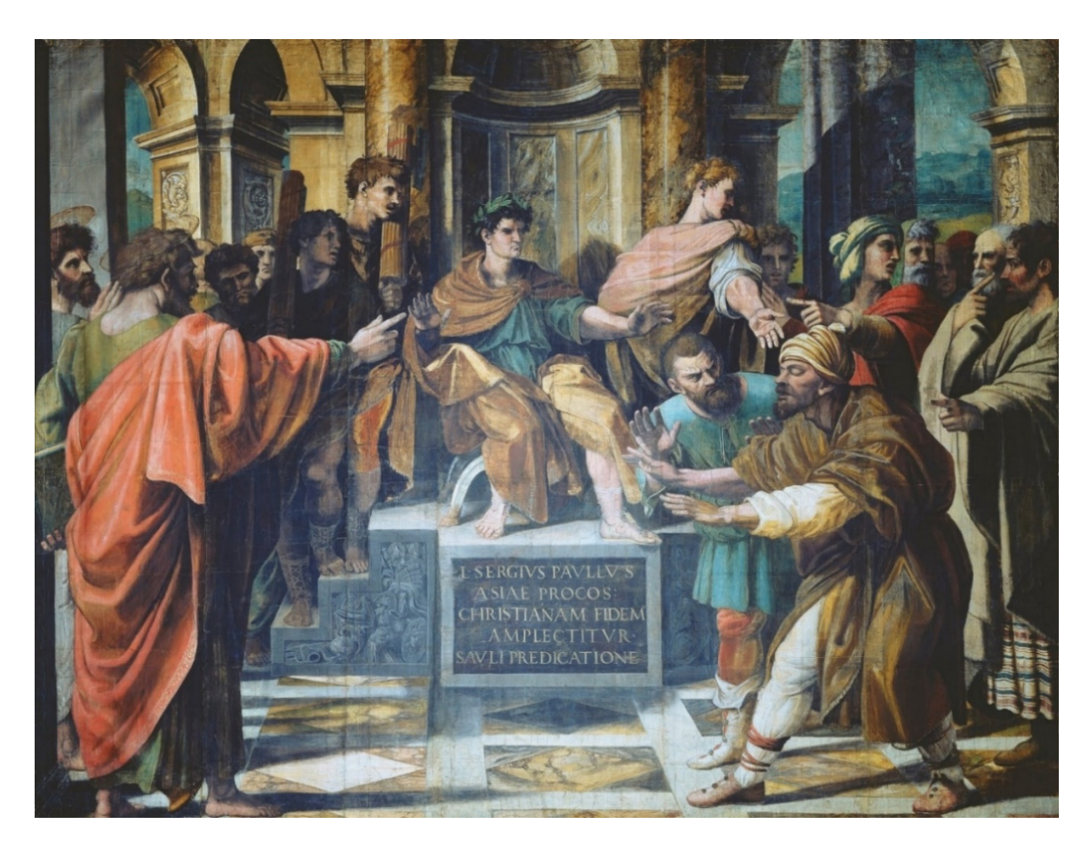
Fig. 2 RAPHAEL (URBINO 1483-ROME 1520) The Conversion of the Proconsul c.1515-6 RCIN 912948

In the following, one of the Dresden drawings – the "Sorcerer Elymas" - is presented and compared with Raphael's Elymas in his cartoon "The Conversion of the Proconsul" in order to show how Gruner translated the figure painted in gouache on Raphael's cartoon into a charcoal drawing.