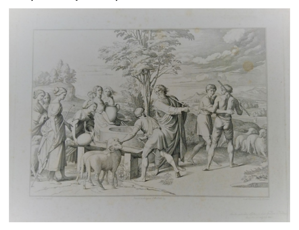
Fig. 1 "Moses Verteidigung der Töchter Jethros gegen die Hirten des Midian", 1838 Ludwig Gruner after a drawing by Friedrich Overbeck Private Collection Heidelberg

The reports in the contemporary German press, however, testify to the assessment of Ludwig Gruner's artistic importance in a time of veneration and multiple reception of the works of Raphael and his school. In the circles of the Nazarenes and their followers, this veneration was extended to the engraver Marcantonio Raimondi, whose early continuing dissemination of Raphael's works in the medium of engraving shaped the image of the artist decisively until the 19th century.<sup>15</sup>