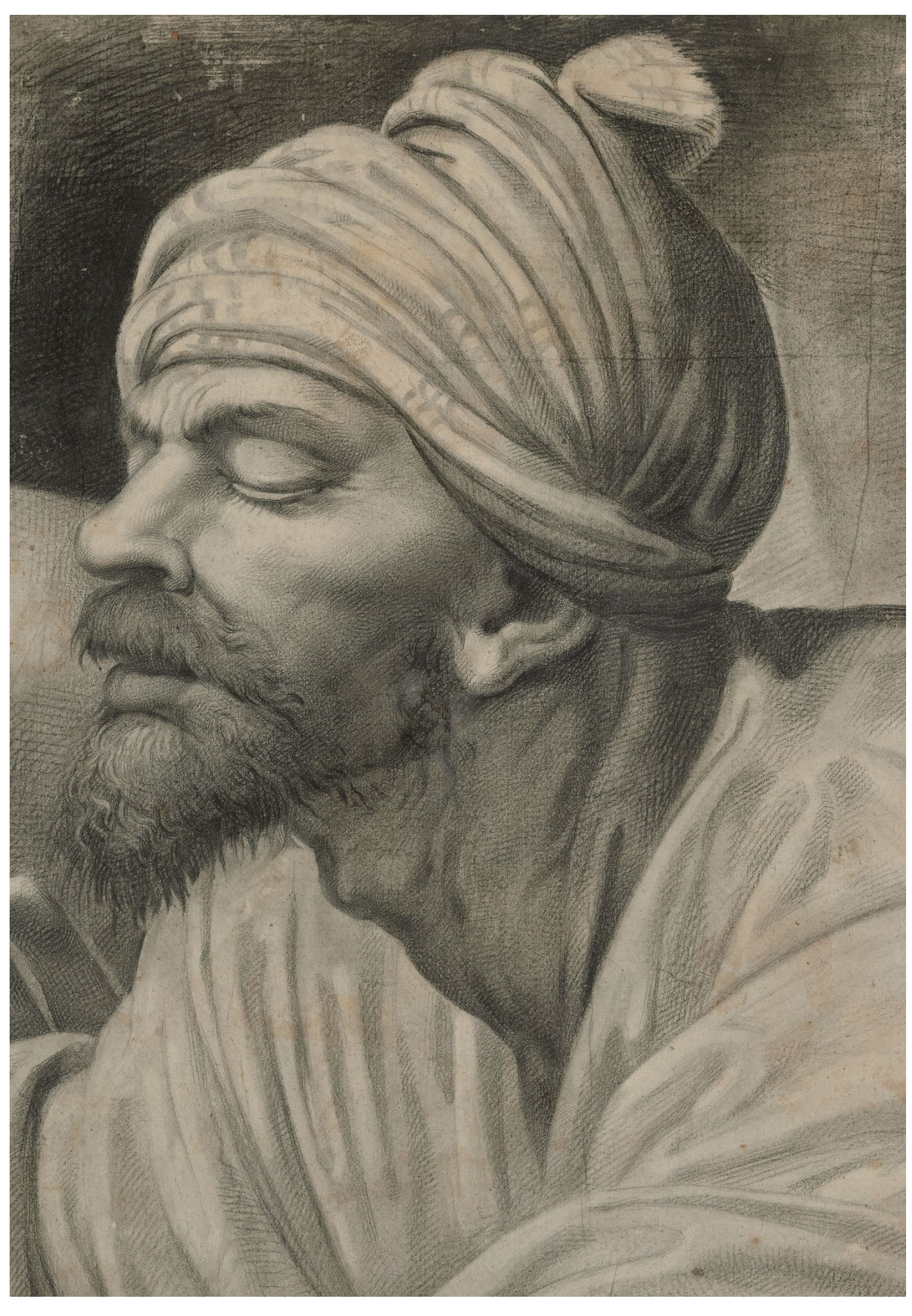
Fig. 4 Ludwig Gruner (Dresden 1801 – Dresden 1882) The Conversion of the Proconsul, detail C 1960-46