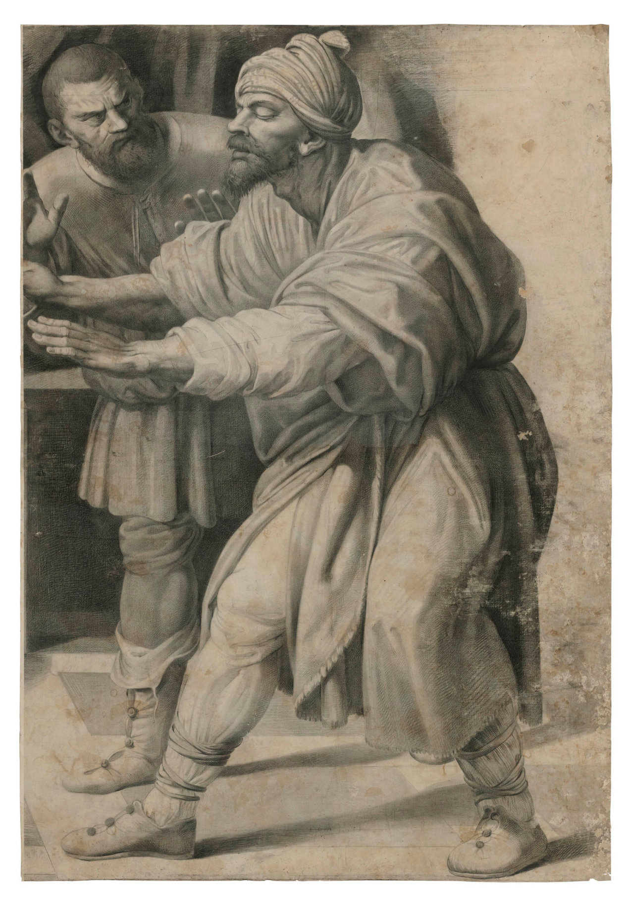
Fig. 3 Ludwig Gruner (Dresden 1801 – Dresden 1882) The Conversion of the Proconsul, detail C 1960-46