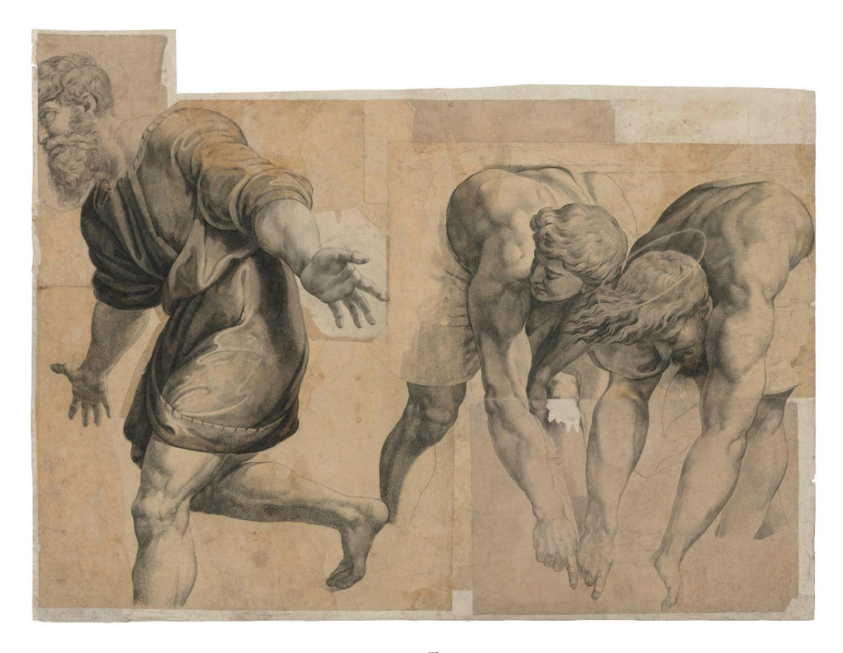
Fig. 5 Ludwig Gruner (Dresden 1801 – Dresden 1882), "The Miraculous Draught of Fishes", detail © Kupferstich-Kabinett, Staatliche Kunstsammlungen Dresden, C 1960-46, photo Herbert Boswank

From this letter we learn that Gruner was still uncertain what use he would make of his drawings after the Raphael Cartoons. The negotiations with S.P.C.K. had not yet led to a decision. However a sample lithograph was printed.<sup>86</sup> Five months later, Gruner was still busy on the drawings at Hampton Court, for he wrote to Overbeck on 1st March 1842: