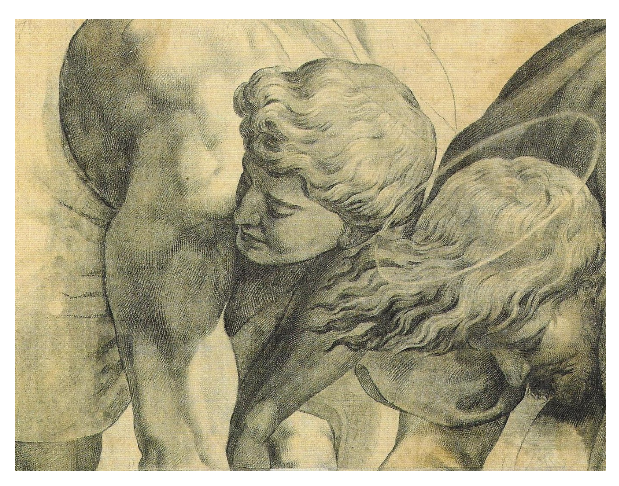
Fig. 10 Ludwig Gruner (Dresden 1801 – Dresden 1882),"The Miraculous Draught of Fishes", detail © Kupferstich-Kabinett, Staatliche Kunstsammlungen Dresden, C 1960-46, photo: Herbert Boswank

been answered in this article. However the question why the drawings discovered in Dresden represent only part of a much larger number of Gruner's copies after Raphael's cartoons, remains unanswered, as does the question of the whereabouts of the remaining drawings. Perhaps the history of the Dresden drawings presented here will lead to the discovery of further parts of Ludwig Gruner's originally much larger collection of detailed studies, which can legitimately be regarded as works of art in their own right that are probably unique in the long history of copies after the Raphael cartoons.