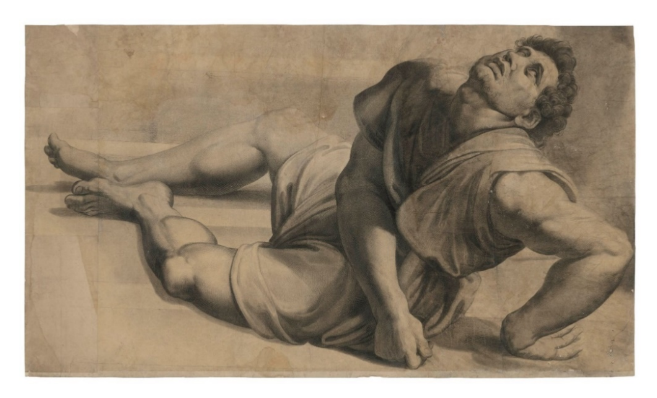
Fig. 8 Ludwig Gruner (Dresden 1801 – Dresden 1882), "The Death of Ananias", detail © Kupferstich-Kabinett, Staatliche Kunstsammlungen Dresden, C 1960-46, photo: Herbert Boswank

The studies by Gruner mentioned in the document for three of the seven cartoons – "Paul in Athens", "The Donation of the Keys" ("Christ's Charge to Peter") and "The Sacrifice at Lystra" – are not however part of the Dresden drawings.