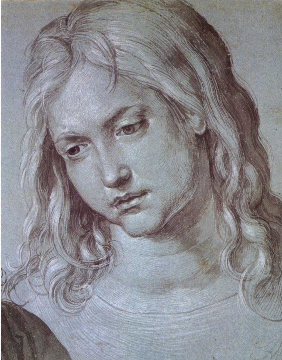
Figure 3: Albrecht Dürer, 1506, Head of Christ drawing on blue Venetian, paper, pencil, heightened with white, 27,5 × 21,1 cm, Albertina, Wien, Inv. 3106 (public domain: http://www.zeno.org )