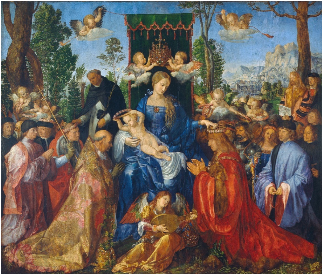
Figure 4: Albrecht Dürer, Feast of Rosary , 1506, Oil on panel, 162 x 192 cm, National Gallery Prague, ID 1552 (PD-US-expired, wiki commons)

However, the attribution of the Feast of Rosary to the iconography of the cult of the Rosary is not clear. Rather, it belongs to the iconography of the brotherhood itself. Thus, Panofsky called it accordingly in contrast to the original title Rosary Brotherhood . This is for Panofsky of importance because the actual “feast” of the Rosary, was not invented until 1573, when Gregory XIII wanted to commemorate Lepanto's victory over the Ottoman Empire. 23 With regard to the motifs and the composition, however, Panofsky's iconological interpretation does not go far enough, for precisely this picture is to be understood rather as a declaration of the German Empire to the Roman Catholic Church, which differs from those of other faiths. This is supported by the location behind the Alps and the naturalized portraits, and thus the individualized view of clergy and laity according to the monumental conception of the foreground. The latter is made clear by the positioning of the Pope in his Fanon and the German Emperor Maximilian I in a knightly amor in devotion before Mary as Queen of Heaven with the Child Jesus.