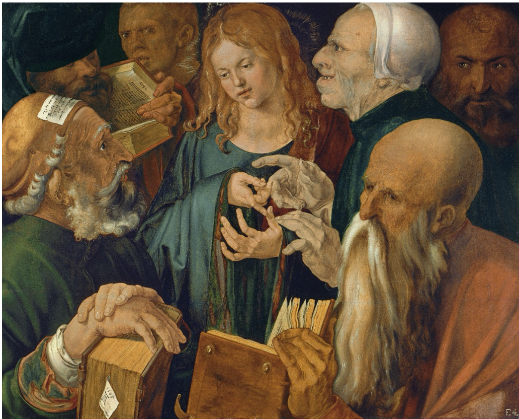
Figure 1: Albrecht Dürer, Christ Among the Doctors (after Leonardo?), 1506, Oil on panel, 64.3 x 80.3 cm, Museo Nacional Thyssen-Bornemisza, Madrid (PD-US-expired, wiki commons) 8