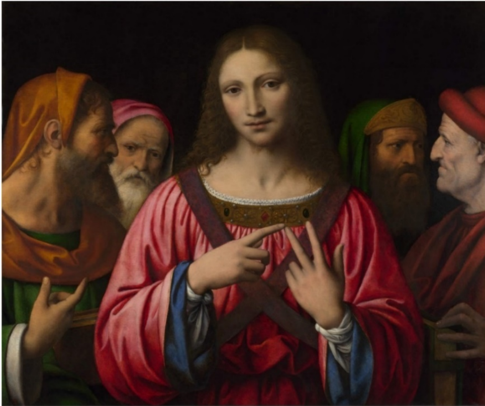
Figure 5: Bernardino Luini, Christ among the Doctors (attributed after Leonardo), 1515-1530, oil on panel, 74,2 x 85,7 cm, National Gallery, London.