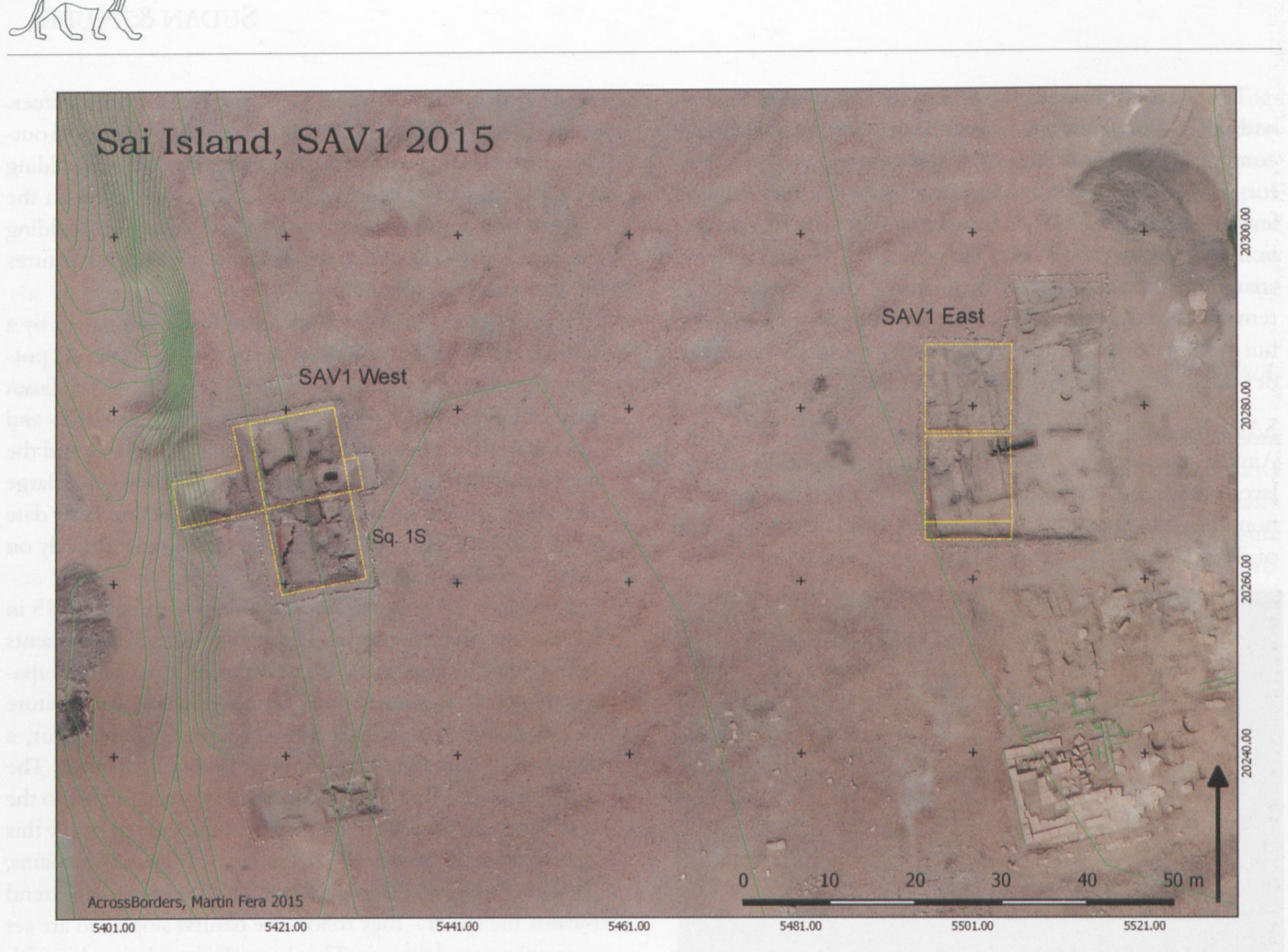
Plate 2. Location of the AcrossBorders excavation trenches. Status 2015 (Map by Martin Fera © AcrossBorders).