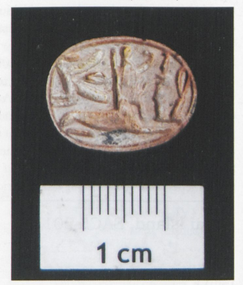
Plate 10. Scarab SAC5 121 from tomb 26.

the filling just above the base of the shaft. This small intact piece made of steatite (17 \times 8 \times 13 \text{mm}) has on the reverse a seated Maat, a recumbent sphinx with a double-crown and a winged cobra.