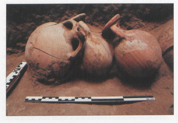
Plate 8: Marl clay pilgrim flasks from the base of the shaft of tomb 26.

was highly interesting: a number of complete vessels were found and several worked stones (pieces of architecture). Three complete, decorated Marl clay pilgrim flasks<sup>25</sup> were assembled (Plate 8), associated with other pottery vessels (especially storage vessels) and one complete stone vessel (Plate 9). Since these remains were clustered along the eastern wall of the shaft and in the south-eastern corner, the most likely explanation is that remains of a burial were removed from