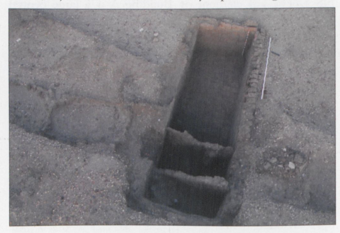
Plate 3. Feature 15 in SAV1 East.

The most interesting find in SAV1 East is a subterranean room, feature 15, located in the central courtyard of Building A (Plate 3). Partly excavated in 2013 and 2014, it was completely exposed in 2015 (5.6 x 2.2 x 1.2m). Dug into the natural gravel deposit, feature 15 represents a New Kingdom storage installation of rectangular shape, with a vaulted roof now missing. Its inner part is lined with red bricks and red bricks also form the pavement of the structure (see Budka 2015a, 62). Due to a number of ashy deposits, large amounts