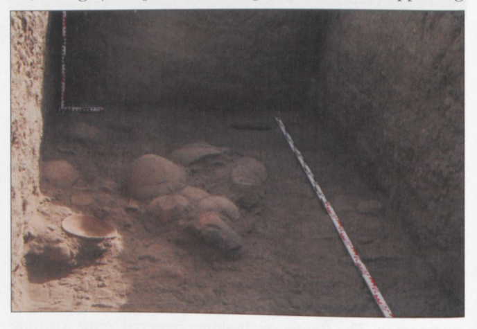
Plate 4. Pottery vessels set on the pavement of feature 15.

of charcoal, hundreds of dom-palm fruits and abundant animal bones with traces of burning, feature 15 might also have been used as a kitchen and a room for food preparation.<sup>22</sup> More than 80 almost intact vessels (with an approximate minimum number of 150 more vessels) were found within it (Plate 4). The main pottery types are plates and dishes, beakers, storage jars, zir vessels and pot stands, thus supporting