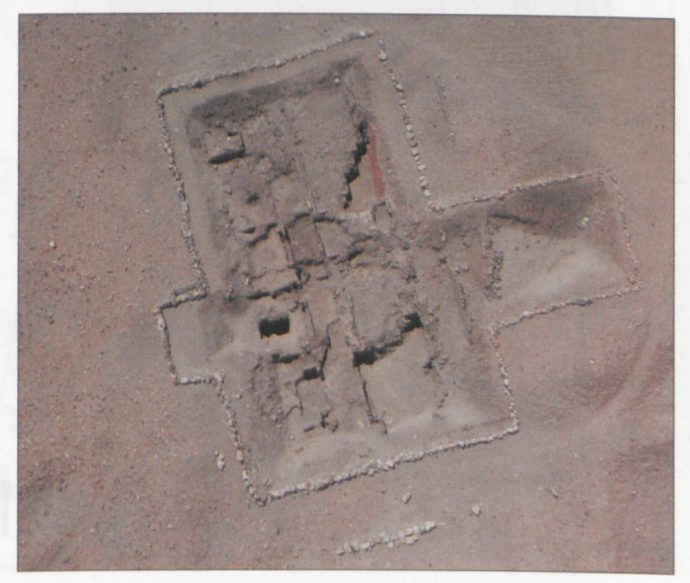
Plate 6. Top view of SAV1 West, March 2015.

Searching for the town enclosure, its date, structure and stratigraphic position, a new site, SAV1 West, was opened in line with the western town gate in 2014 (Plate 2; cf. Budka 2015a, 63-65). Two trenches were laid out, Square 1 (10 x 10m) and Square 2 (5 x 15m). A western (Square 1W, 5 x 10m) and north-western extension (Square 1NW, 2 x 5m) were subsequently added to Square 1 because of the discovery of brickwork at the edge of the trench. In 2015, a new southern extension to Square 1 was opened – Square 1S (10 x 10m). Both the New Kingdom town enclosure and the contemporaneous remains on the inner side of this wall were investigated in SAV1 West (Plate 6).