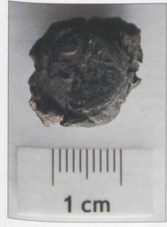
Plate 5. Example of a clay sealing of Hatshepsut from feature 15 (SAV1E 2322). This type is attested ten times.

It is important to stress new evidence for Hatshepsut from SAV1 East: a minimum of 20 clay seals from the lower filling of feature 15 can be attributed to her (Plate 5). Previously, there was no secure testimony of Hatshepsut on the island – a seated statue (Khartoum 443) of a 'god's wife' was interpreted controversially as Ahmose Nefertari, Hatshepsut or Merytamun.<sup>23</sup> Together with the evidence from Dokki Gel/Kerma, the new finds from SAV1 East indicate an Egyptian presence and administrative activities in Nubia immediately after the Kerma revolt under Thutmose II during the era of Hatshepsut.