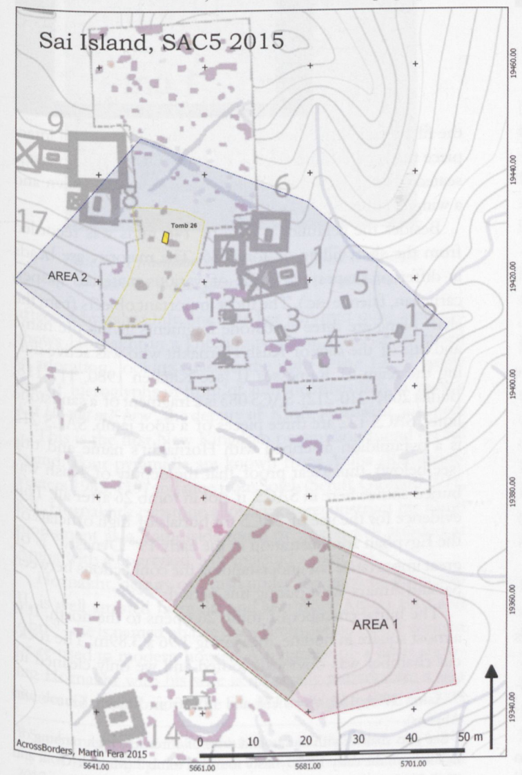
Figure 3. Working areas of SAC5 with location of tomb 26 – scale 1:1000 (Martin Fera 2015 © AcrossBorders).

Two excavation areas were opened in 2015 (Figure 3). Area 1 is located in the south and the aim was to check anomalies visible on the geophysical survey map. A complete surface cleaning of this area was conducted and test excavations proved to be interesting. It is now evident that this large sector set between two small outcrops in the southern part of SAC5 was probably completely devoid of tombs. No burial monuments were located, but rather various topographical