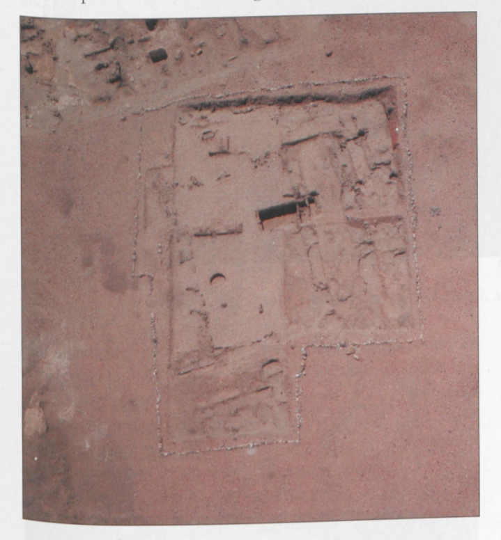
Plate 1. Top view of SAV1 East, March 2015.

Aiming to achieve a more complete understanding of the layout of the 18<sup>th</sup> Dynasty occupation at Sai, a new excavation area was opened in 2013 (SAV1 East), 30-50m north of Temple A at the eastern edge of the town (Plate 1). The