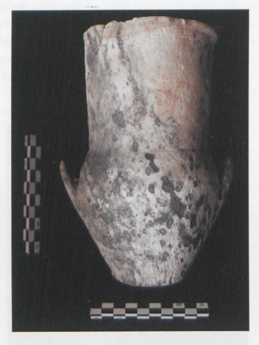
Plate 9. Stone vessel SAC5 212 from tomb 26.

the chamber and left in the shaft during one of the phases of reuse (or possibly plundering?).