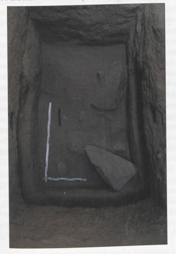
Plate 11. Pyramidion of Hornakht as found in the shaft of tomb 26.

The surface of the pyramidion SAC5 215 found at the bottom of the shaft of tomb 26 (Plate 11) is unfortunately badly