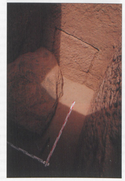
Plate 7. Schist slab in shaft of tomb 26.

The filling material of the shaft just above the base