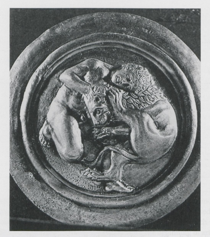
FIG. 30.2 Relief on a harness from the Treasure of Panagyurishte. Heracles and the Nemean Lion. Fourth century BCE. Silver. Sofia, Archaeological Museum.