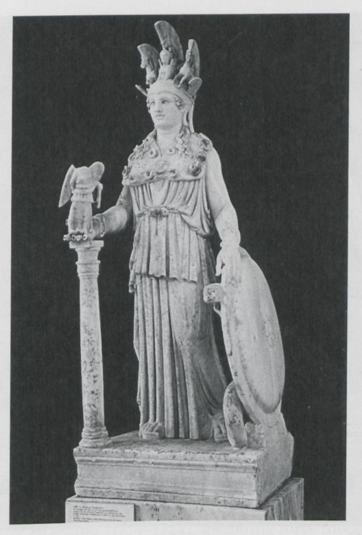
FIG. 30.1 Version of the Athena Parthenos by Phidias of 438 BCE ("Varvakeion statuette"), from Athens (Varvakeion School). First half of the third century CE. Marble. Height with base 1.05 m. Athens, National Archaeological Museum inv. 129.