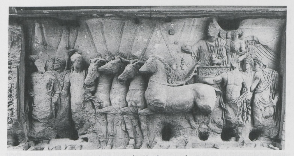
FIG. 30.3 Detail of the Arch of Titus on the Via Sacra in the Forum Romanum. Triumphal procession of the emperor Titus. 81 CE. Marble. Height of the arch 15.40 m.