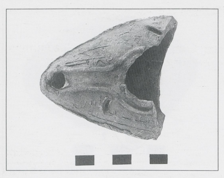
4. Lamp Pol. 159 (cf. Khairy and Amr 1986: FIG. 6).

Sâmid can be dated in 111 H (AD 729/30), as it was indeed dated by A. Battista already in 1947 after a copy in the Palestine Archaeological Museum (Bagatti 1947: 141).