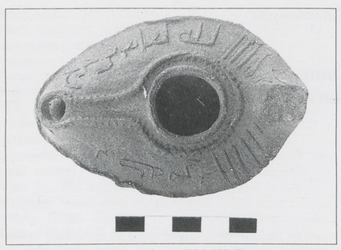
2. Lamp Pol. 41 (cf. Khairy and Amr 1986: FIG. 9).

covered in Jarash (FIGS. 2 and 3.1) (Khairy and Amr 1986: 149, FIGS. 8-9, PL. 39.9), if we adopt the reading "Ibn Khurayj", equally possible, as the letters are not dotted. In both cases, admittedly, the link is tenuous and would need some confirmation before we are able to speak of hereditary workshops.