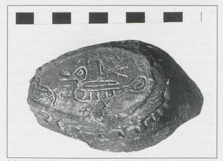
1. Lamp Pol. 211 (cf. Ronzevalle 1914; Khairy and Amr 1986: FIG. 4).

In the same way, the potter whose name is given as Ibn Ḥudaij (Amr 1986: 163, FIGS. 1-2) could be identical with 'Amr bin Kharaj mentioned on three lamps dis-