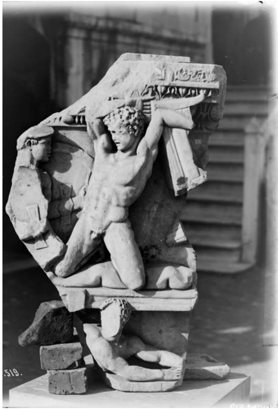
Fig. 4. The killing of the suitors. Attic sarcophagus fragment, ca. 300 c.e. Istanbul, Archaeological Museum. Reproduced by permission.

later on the Heroön from Trysa dated to the beginning of the fourth century B.C.E. Later, two Greek vases, some funerary urns from Etruria and a painting in the Corinthian Peribolus of Apollo attest to the presence of the same theme in the Hellenistic Era. 33 Finally, three or four sarcophagi extend the