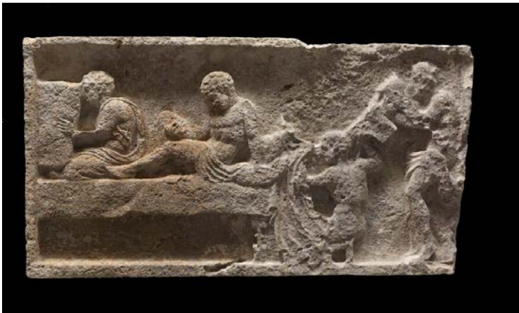
Fig. 2. The killing of the suitors. Relief sculpture, Heroön de Gjölbасchi-Trysa, ca. 400–350 B.C.E. Vienna, Kunsthistorisches Museum–Museumsverband. Reproduced by permission.