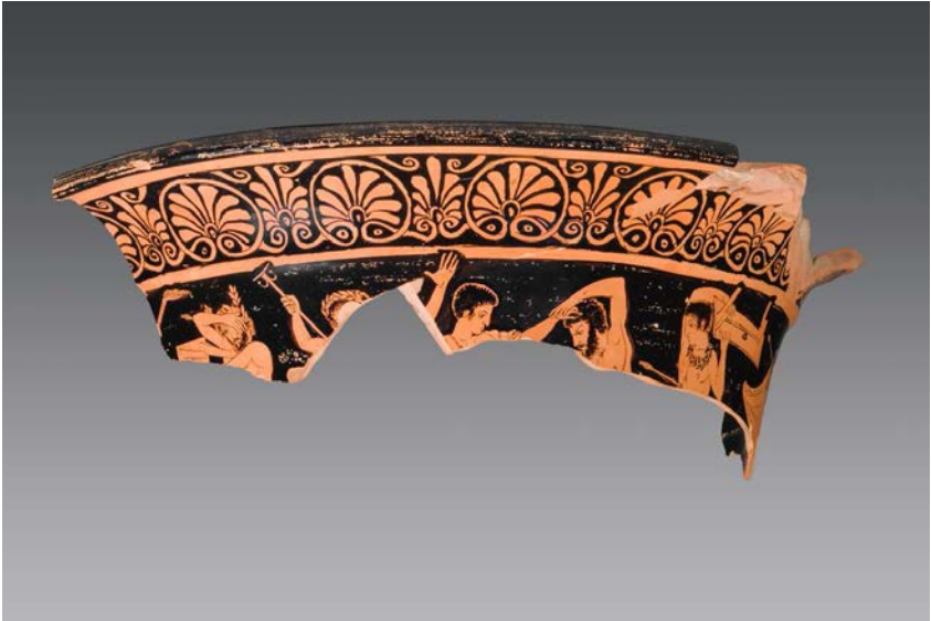
Fig. 1. The killing of the suitors. Apulian calyx-krater fragment, attributed to the Hearst Painter, ca. 400 B.C.E. Basel, Collection of Herbert Cahn. Reproduced by permission.