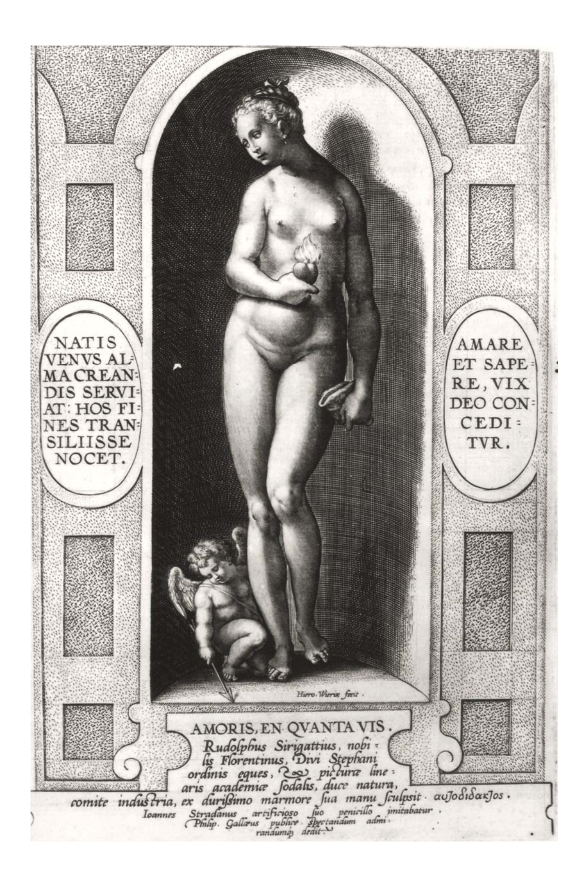
Venus, by Ridolfo Sirigatti, engraved by Hieronymus Wierix, after a drawing by Johannes Stradanus