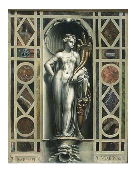
Workshop of Raffaello (attributed to Giulio Romano) Ceres, oil on wood, 38 x 31 cm; Louvre, Paris. ca. 1516