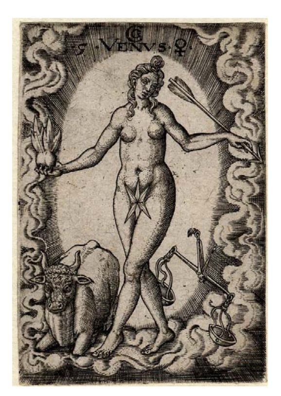
Venus, British Museum, Prints & Drawings Registration number: 1913,0213.6 Hollstein 6 (XIII, p.21); Bartsch IX.17.4

It can possibly not be excluded, however, that the words in large capital letters were simply added in Antwerp at the press of Philips Galle, who has affixed his own notices to the print, in order to give to an image of an obscure statue in far-away Florence a more universal appeal for a wider audience of potential buyers. Galle's engraving of the altar wall of the Galli Chapel in SS. Annunziata in Florence, with Stradanus's Crucifixion , contains some inscriptions that do not refer to the painting (and are not present in the chapel) and perhaps render it a general devotional image rather than simply the reproduction of a painting in Florence, although others of the inscriptions recorded in the print can still be read today in situ .