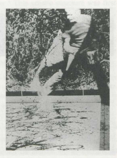
Hans Namuth, Jackson Pollock ca. 1950. © 1991 Hans Namuth Estate, Courtesy Center for Creative Photography, TheUniversity of Arizona. From: Harten.

Using long term exposure, Hans Namuth "catches"-such a nice metaphor-the artist, with a leg spread out, precariously balanced, and a can of paint in his left hand, as he is just pulling a stick from the paint, and swings it over the picture in one extended motion. We can see hanging on the wall behind him-as far as I can tell-Number 31, a 1950 painting now at the Museum of Modern Art. The use of black and white here has the same effect as Beaton's use of color: since Pollock's jeans and T-shirt offer no color contrast to the canvas, body and painting represent unbounded zones that one can barely differentiate. In Beaton's photo, this manifests itself in the soft harmony of colors between the pink and black in the painting and on the dress, and, crucially, between the model's blonde hair and the yellow tones of the painting. Here we have discovered yet another similarity, if not a surprising one: although this is accomplished by using different techniques, both photographs produce the effect in the viewer that body and painting partially merge in the photographic image, that the space between the two disappears.