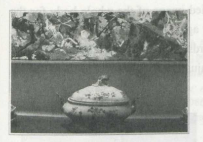
Louise Lawler, Pollock and Tureen , 1984, photograph. From: Bickerton, 84. Cour tesy of the artist and Metro Pictures.

commodity value, as is illustrated by the logic of the private collection. The proximity of both these collector's objects, Pollock and baroque tureen, does not cause the two objects to merge in the near elimination of space between them, as is the case in Beaton's photo, but rather serves to problematize the functional space of art. For