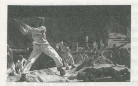
Dejneka, Alexandr Alexandrowitsch, Defence of Sevastopol, 1942, Oil on Canvas, 200x400cm, The State Russian Museum, St. Petersburg. From: Hubertus 204.

The Cold War provided Pollock's drip painting with a superstructure of meaning, which transformed the painterly traces of the artistic act into signifiers of freedom—they became an aesthetic weapon in the Cold War against the "socialist happiness" of Stalinist painting, which took on its full form in that period.<sup>5</sup> In Namuth's photos