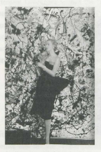
Cecil Beaton, Model in front of Autumn Rhythm , for Vogue , March 1951. Courtesy of Sootherby's London. From: Guilbaut, Cover.