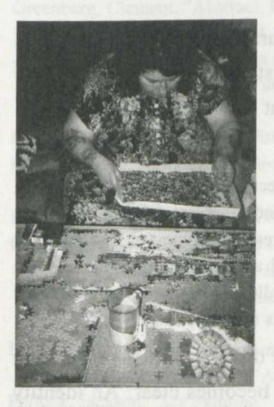
Richard Billingham, Untitled , 1993-95, color photograph on aluminum. From: Adams 53.

Postmodernism neither brackets nor suspends the referent but works instead to problematize the activity of reference... its deconstructive thrust is aimed not only against the contemporary myths that furnish its subject matter, but also against the symbolic, totalizing impulse which characterizes modernist art. (85)