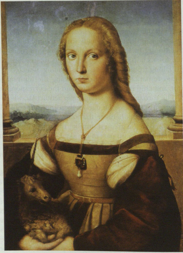
Fig. 13. Raphael, Lady with a Unicorn , c. 1504, tempera and oil (?) on wood, 65 x 51 cm, Rome, Galleria Borghese

most as far as the beginning of the shadows which are below the projections of the face, gradually changing in brightness, until it terminates over the chin with imperceptible shading on every side" 55 .