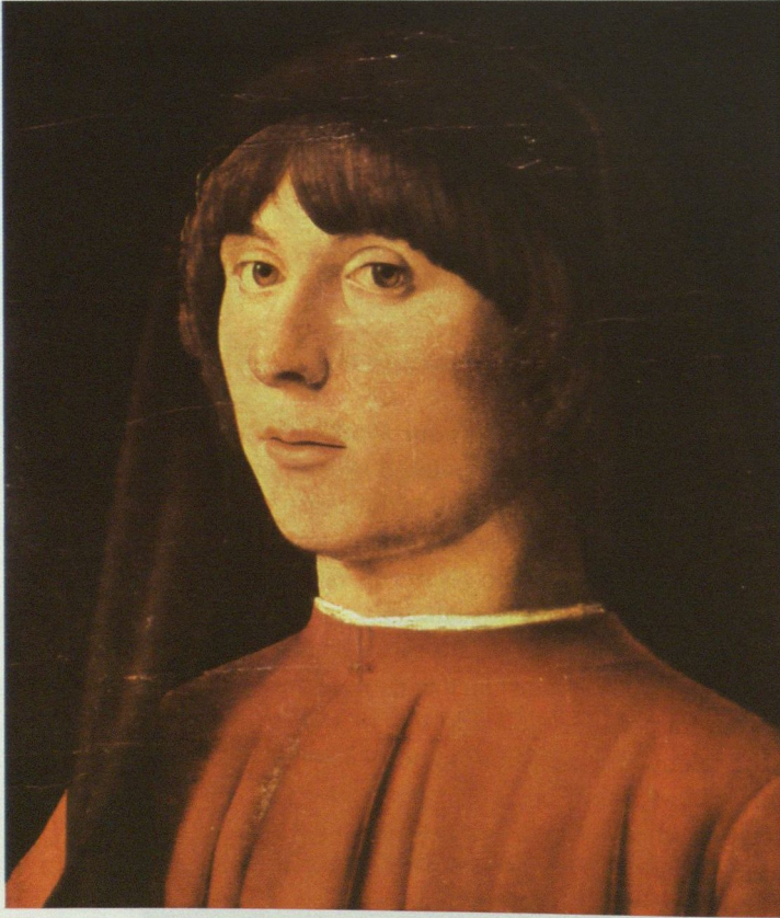
Fig. 7. Antonello da Messina, Portrait of a Young Man , 1474 (signed), tempera (?) and oil on wood (poplar?), 32 x 26 cm, Berlin, Gemäldegalerie

lady in the portrait and the generosity of the patron, and in this case also implies that only in the painting are we seeing the sitter behave in the appropriate manner for young women. Only in her portrait, in other words, is she no longer talking (favella) but listening! Apart from this joking allusion to ideal female behavior, which apparently consists of polite silence, Bellincioni's poem also sheds light on contemporary attitudes towards the function of the portrait: it was to hand down a likeness of the young woman for posterity 29 .