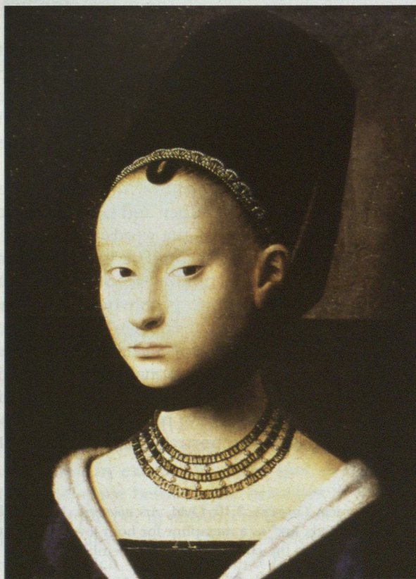
Fig. 2. Petrus Christus, Portrait of a Young Lady , c. 1470 (?), tempera (and oil?) on wood (oak?), 29 x 22,5 cm, Berlin, Gemäldegalerie

Comparable “close-ups” were already to be found in Flemish portraits of the type introduced by Jan van Eyck (c. 1390–1441) a generation earlier, and subsequently popularized by Hans Memlinc (1435–1494) and Petrus Christus (c. 1410–1472/73). Thus the landscape background may be inspired by portraits such as Memlinc's Man with an antique coin showing the emperor Nero (Antwerp) and the overall composition and the pale complexion of Ginevra by portraits like Petrus Christus's Portrait of a Young Lady , now in Berlin but in the 15th century known in Florence (fig. 2) 4 .