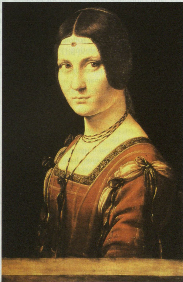
Fig. 8. Leonardo da Vinci, Portrait of a Lady (La Belle Ferronière), c. 1490–1495, oil on wood (walnut?), 63 x 45 cm, Paris, Louvre, inv. 778

Alongside the Portrait of Cecilia Gallerani , Leonardo's early works as court painter also include the so-called Belle Ferronière , whose attribution to Leonardo is today rarely doubted (fig. 8) 30 . In compositional terms, the painting is closely related to a portrait type found across northern Italy, in which a stone parapet separates the viewer from the pictorial space. This same type surfaces in the works of Antonello da Messina (c. 1430–