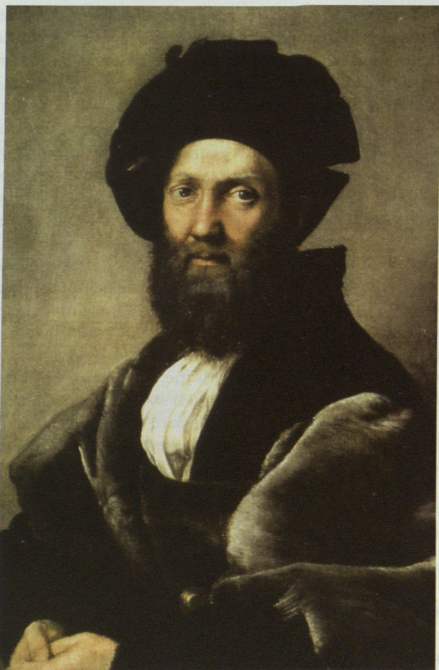
Fig. 14. Raphael, Portrait of Baldassare Castiglione , c. 1515–1516, oil on canvas, 82 x 67 cm, Paris, Louvre

Evidently, the distribution of the shadows in the face of the Mona Lisa closely follows Leonardo's observations in his treatise on painting. The setting of the Mona Lisa, however, is somewhat different than the situation described in the Treatise on Painting . Therefore, the question arises as to whether Leonardo was trying in his portrait to simulate specific lighting conditions which could never have existed in Lisa's loggia in real life. The illumination of the face does not correspond with the natural lighting of a loggia, which would normally receive the large part of its light from the side opening onto the landscape. In the portrait, however, Lisa is illuminated by a light source located above and to the left of the