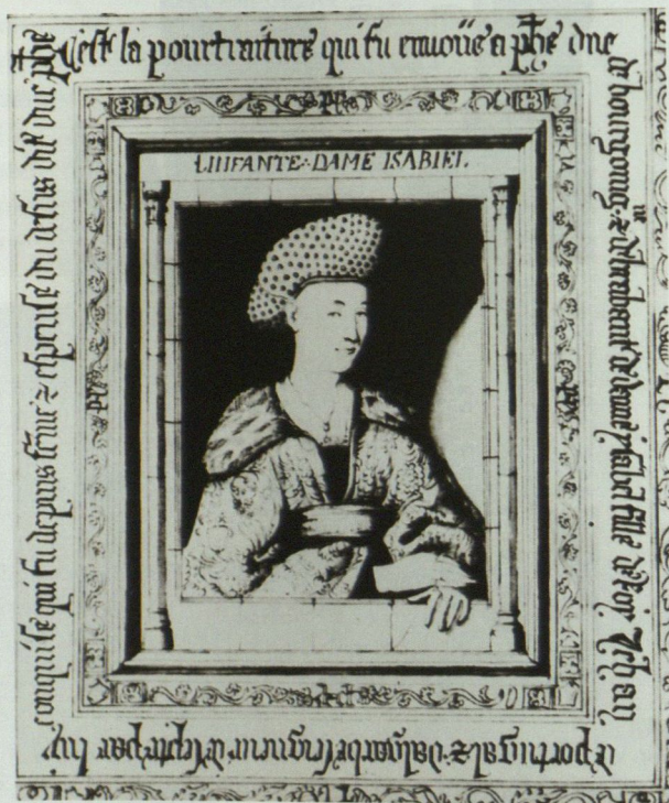
Fig. 12. Unknown Artist of the 17th Century (?), drawing after Jan van Eyck's Portrait of Princess Isabella of Portugal , location unknown

coteca Civica) 41 . These in turn look back to earlier Flemish prototypes such as Jan van Eyck's portrait of Isabella of Portugal, now lost, which already comes very close to the arrangement of Lisa's portrait (fig. 12) 42 .