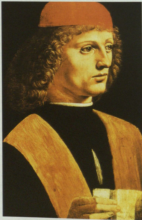
Fig. 9. Giovanni Antonio Boltraffio (?) and Leonardo (?), Portrait of a Musician , c. 1485, tempera and oil on wood, 44,7 x 32 cm, Milan, Pinacoteca Ambrosiana, inv. 99

tain atmosphere, one which arises out of their subtle shading and which would shortly be encapsulated in the term „sfumato”. Contours and outlines hereby begin to dissolve as objects no longer rely on crystalline focus and sharp-edged definition to convey themselves to the viewer. The portrait now takes its meaning less from the realism with which it portrays its sitter than from its constitution of atmosphere, a shift in emphasis which was in turn accompanied by increasing autonomy on the part of the painting. Still, it is difficult maintain the attribution to Leonardo.