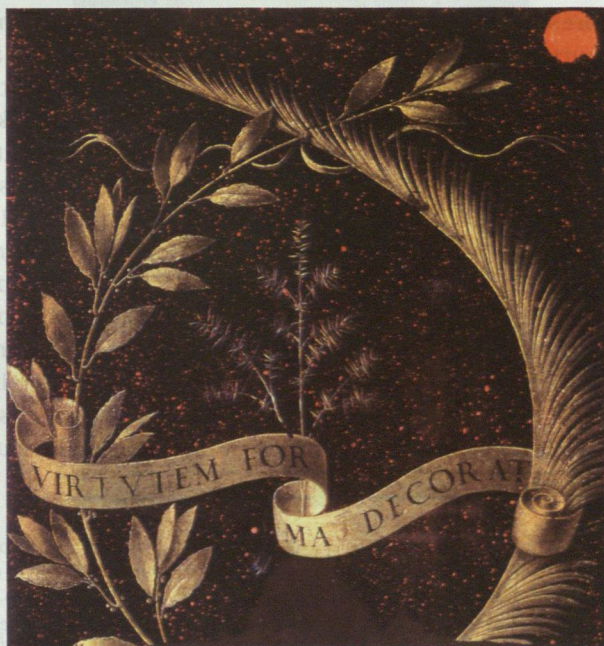
Fig. 3. Leonardo da Vinci, Portrait of Ginevra de' Benci , back of No. 1

DECORAT", but "VIRTUS ET HONOR" 11 . Since this was Bembo's motto, one could assume that Bembo had initially commissioned his own portrait from a Venetian artist, the back of which Leonardo then altered and finished off, before proceeding to execute the portrait of Ginevra de' Benci on the front 12 .