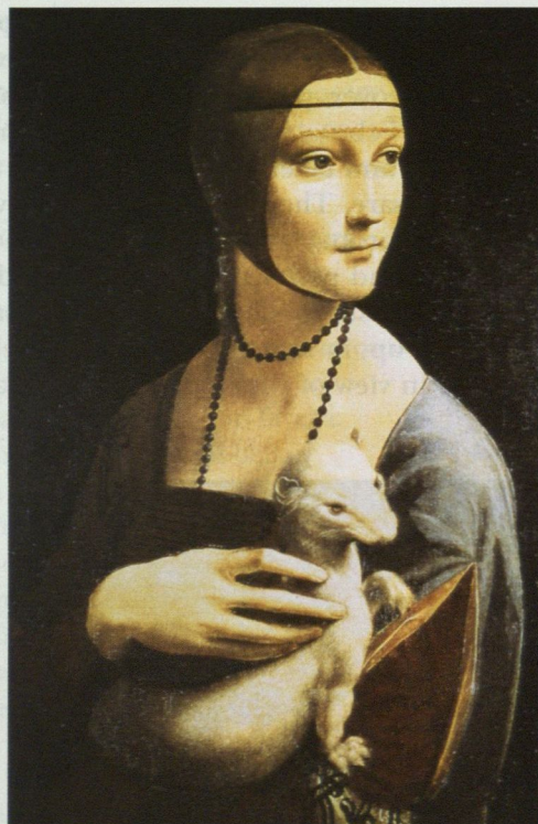
Fig. 5. Leonardo da Vinci, Portrait of Cecilia Gallerani , c. 1489–1490, oil on wood (walnut?), 55 x 40,5 cm, Cracow, Muzeum Czartoryskich, inv. 134

From the late 1480s onwards, moreover, the ermine could also be read as an allusion to Ludovico Sforza, who used it as one of his emblems. In the figurative sense, therefore, this portrait shows Ludovico, in the shape of his symbolic animal, being tenderly stroked in the sitter's arms. The comparatively complex symbolism of this portrait, and the delicate situation it portrays, have their explanation in the fact that the young woman was Ludovico Sforza's favourite mistress. Born Cecilia Bergamini in 1473, at the age of ten she was betrothed ( pro verba ) to Giovanni Stefano Visconti. This betrothal was dissolved in 1487. Not long afterwards Cecilia became the mistress of Ludovico Sforza, who for his part had been betrothed to Beatrice d'Este (1475–1497) since 1480 25 . The official solemnization of Ludovico's marriage to Beatrice d'Este seems to have been delayed from 1490, as originally planned, to 1491 as a consequence of Ludovico's affair with Cecilia. Thus the Ferrarese envoy in Milan, Giacomo Trotti,