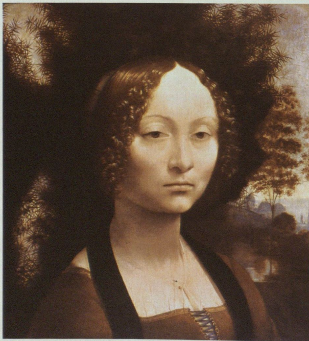
Fig. 1. Portrait of Ginevra de' Benci , c. 1479–1480, oil and tempera on wood (poplar), 38,8 x 36,7 cm, Washington DC, National Gallery of Art (Ailsa Mellon Bruce Fund, 1967), inv. 2326

This small portrait (fig. 1) represents a first truly fixed point of reference in Leonardo's painted Oeuvre, since it is the earliest extant work which can be linked with two well-documented individuals: the sitter, Ginevra de' Benci (1457–c. 1520), a young woman very well known in Florence, and Bernardo Bembo (1433–1519), who in all likelihood commissioned the picture between July 1479 and May 1480 3 . The Portrait of Ginevra de' Benci is Leonardo's first secular painting. Much more than his religious paintings, it succeeds in breaking away from the pictorial conventions of Verrocchio's workshop. The most striking feature of the portrait is the immediate proximity of the sitter both to the viewer and to the vegetation behind her; together they share virtually the entire pictorial plane. The young woman is brought right to the front of the picture. She is seated in front of a juniper bush, which seems to surround her head like a wreath.