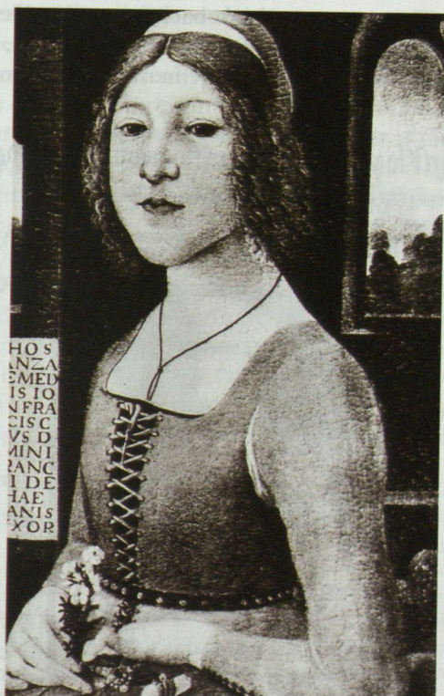
Fig. 11. Workshop of Domenico Ghirlandaio, Portrait of Costanza Caetani , c. 1480–1490, tempera on wood, 57,2 x 37,5 cm, London, National Gallery, inv. 2490

Leonardo clearly draws in the Mona Lisa upon the formal vocabulary of Florentine portraiture of the late 15th century. The half-length figure is turned two-thirds towards the viewer, and a balustrade carried on slender pillars provides the point of transition between the foreground and the background landscape. Formally similar half-length portraits of young women from the period before 1500 include those by the so-called Master of Santo Spirito in the Gemäldegalerie in Berlin 39 , the Costanza Caetani from the workshop of Domenico Ghirlandaio (London, National Gallery; fig. 11) 40 and a female portrait by Lorenzo di Credi (Forli, Pina-