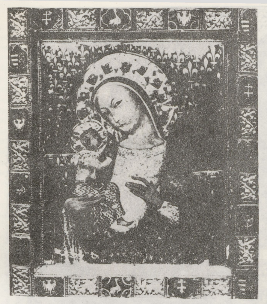
1. Holy Virgin with Infant Jesus, Mariazell, Town Church