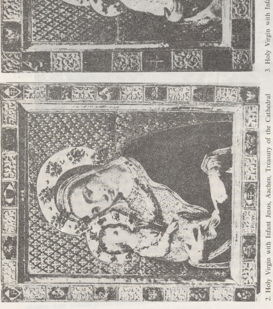
3. Holy Virgin with Infant Jesus, Aachen, Treasury of the Cathedral