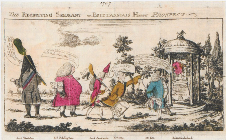
Illustration 1: George Townshend, The Recruiting Serjeant or Britannia's Happy Prospect, April 1757, etching, BM 1868,0808.4057

of ornamental outline that, once studied, is easily repeatable. Townshend amused his parliamentary colleagues greatly with his caricatures and used his drawings to slander his political opponents. This in turn was only possible in the English context of the constitutional monarchy, in which political parties, the Whigs and Tories, competed with one another. In this context, the caricature was well suited as an argument for disparagement and derision.