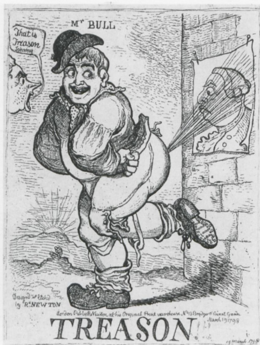
Illustration 16: Richard Newton, Treason!!!, 19 March 1798, etching, BM 1868,0808.6712

to take care of their support – which, knowing their miserliness, in itself makes an unintentionally humorous impression (Illustration 17). But the caricaturing of the royal couple, particularly of Charlotte, stops at nothing, not even rank. Newton is in the position to create unmistakable figures using very few features. The king has found a particularly expressive pose; the butler in Dinner for One could not have presented a better one. 24 Step by step the significance of the monarchy is being undermined; the king no longer needs to be executed.