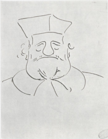
Illustration 3: Gianlorenzo Bernini, Caricature of Cardinal Scipione Borghese, drawing © Rome, Vatican Library