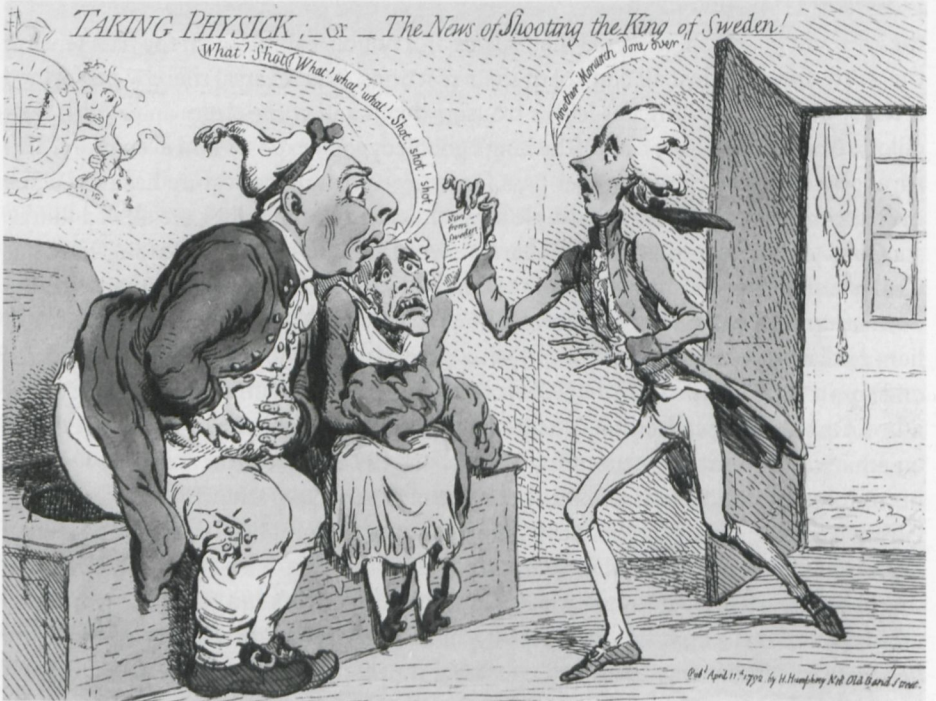
Illustration 15: James Gillray, Taking Physick; -or- The News of Shooting the King of Sweden!, 11 April 1792, etching, BM 1868,0808.6181