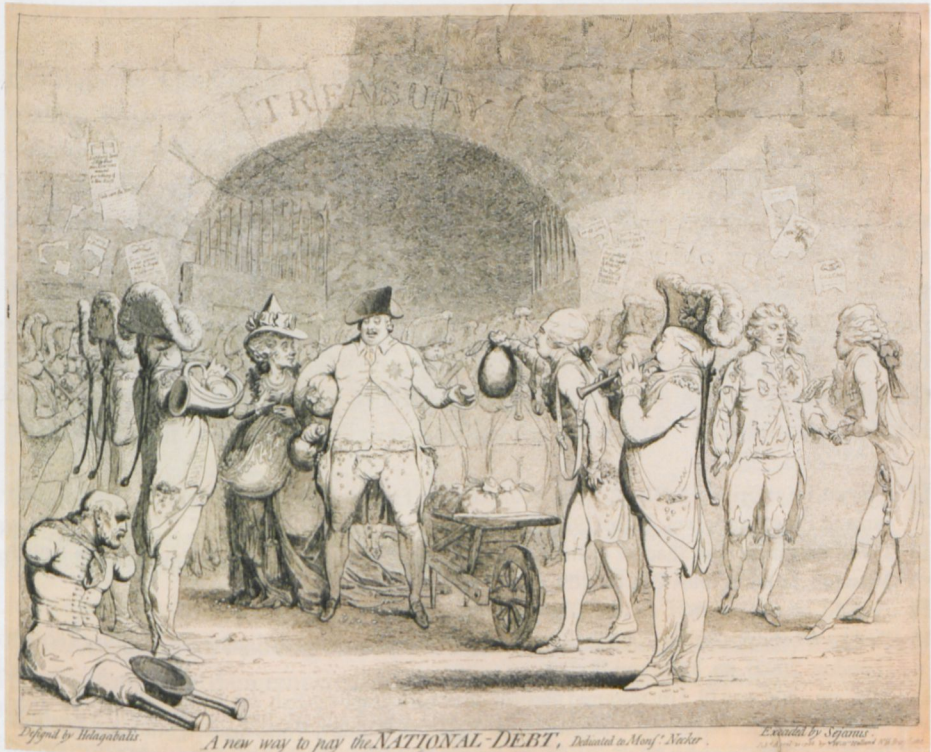
Illustration 10: James Gillray, A new way to pay the National-Debt, 21 April 1786, etching, BM 1868,0808.12472