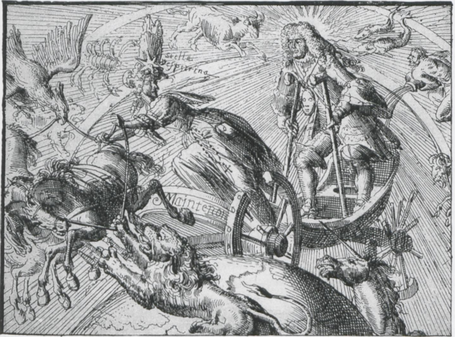
Illustration 6: Romeyn de Hooghe, Louis XIV as Phaeton, aus: Aesopus in Europa, 1701/02, etching