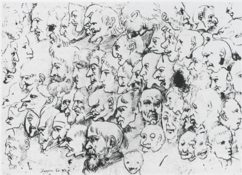
Illustration 2: Agostino Carracci, Grottesque Heads and Caricatures , 1594

His caricatures were so popular that the travellers went to him to let themselves be caricatured as they would to an official portrait session. This suggests to us that in the first 150 years of their existence there was something very exclusive about drawn caricatures, they were not made public, they remained at the papal court or in closed aristocratic circles, serving to amuse them – an amusement that this circle could afford; they were laughing at themselves and were not being scoffed at by a public audience. Such circles were able to enjoy the caricature as an intellectual experiment and understood caricature as the dialectic counterpart to fine art, to the official portrait. Just as caricature makes something appear ugly, the official portrait enhances one's appearance – the artistic process of careful deviation is more or less identical – even Winckelmann still defined caricature in this way. Bernini preferred profile and en-face depictions and developed an amazingly convincing method of abbreviation, which sketched memorable two-dimensional figures. We are fortunate to possess a