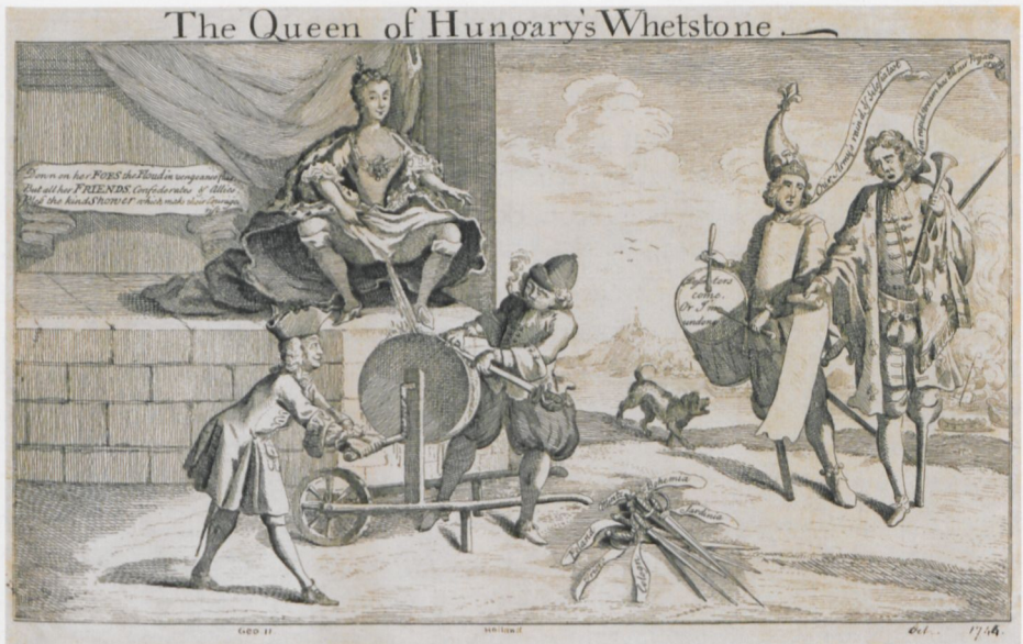
Illustration 9: George Bickham, The Queen of Hungary's Whetstone , approx. 1744, etching, BM 1868,0808.376