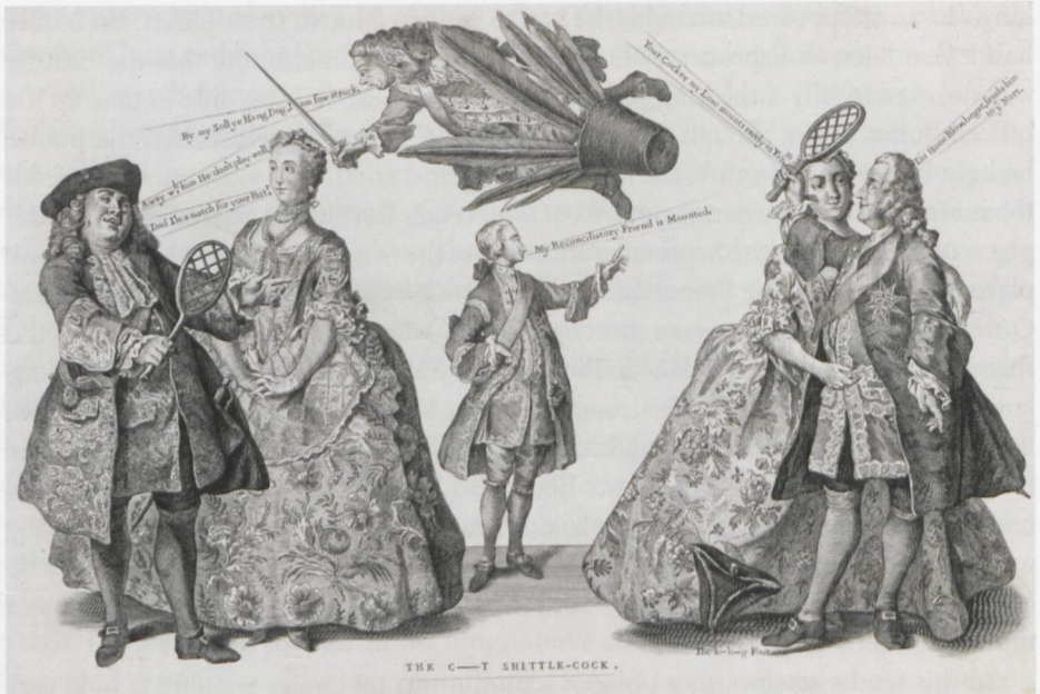
Illustration 8: George Bickham, The Court Shuttle Cock, 1740, etching, BM 1868,0808.3679

basic physiognomy can suggest this tendency towards allegorisation. This is at best on the border to caricature.