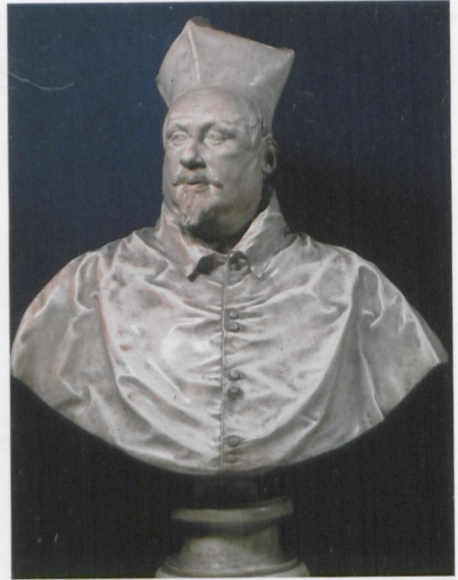
Illustration 4: Gianlorenzo Bernini, Bust of Cardinal Scipione Borghese, 1632, marble

provoke furious reactions among his opponents. It was obvious to imagine the sun chariot crashing down, thereby replacing the allusion to Apollo with one to Phaeton, who was not capable of steering the horses harnessed to the sun chariot, was thrown off his course and plummeted down to Orcus. This scene is to be found on numerous counter-medallions, though one should note that while the sun king does meet with an evil end, the imagery remains within the allegorical tradition and the king's features are not distorted. 8 This is also confirmed, ultimately, by the pamphlet propaganda directed at Louis that swamped France from Holland. If Louis XIV is represented directly in satirical images or in pamphlet literature, it remains an undistorted portrait, as a German etching of 1702 entitled The Hawker of Versailles (Illustration 5) demonstrates, which recognisably follows Hyacinthe Rigaud's often repeated official state portrait of Louis XIV of 1701. Romeyn de Hooghe's illustration of his Aesopus in Europa (Illustration 6) is from the same time, 1701/02, and is more interesting inasmuch as it develops the Phaeton iconography further and the defamation of Louis as a person increases. Even if his features are still not really caricatured, he does nevertheless become a ridiculous figure. His seat in the sun chariot, from which he has risen with some difficulty, is shaped like a toilet stool, he is using crutches and is try-