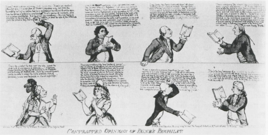
Illustration 14: Anonymus, Contrasted Opinions of Paine's Pamphlet , 26 May 1791, etching