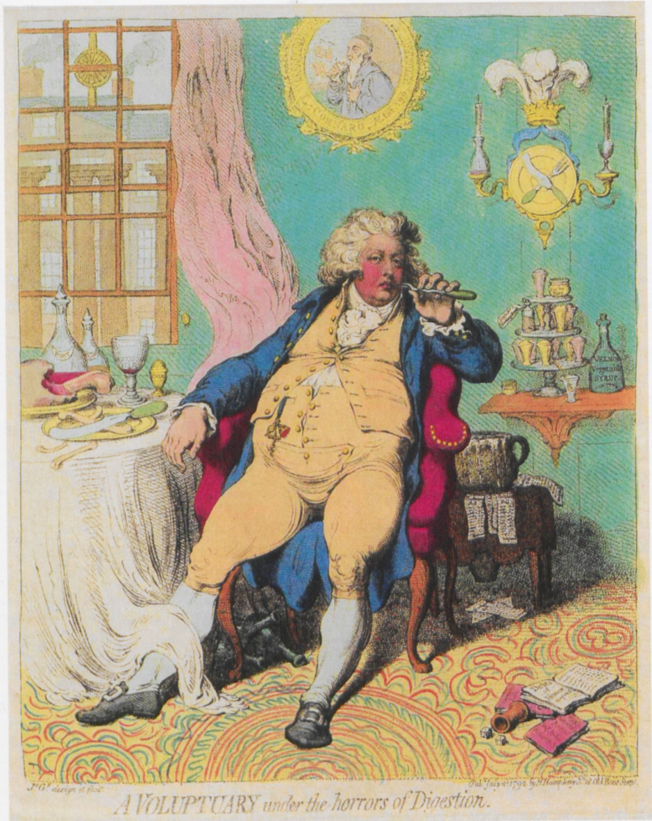
Illustration 11: James Gillray, A Voluptuary under the Horrors of Digestion, 2 July 1792, etching, BM 1868,0808.6219

of the king and Pitt, by being contrasted both parties come out it equally badly. The prince's stomach is dangerously stretched, he has already wolfed down mountains of meat, the bones are lying on his plate, the chamber pot behind him has already had to accommodate the puked up contents of his gluttony, now he is poking around in his teeth with a fork – for someone of princely lineage a faux pas of the first order.