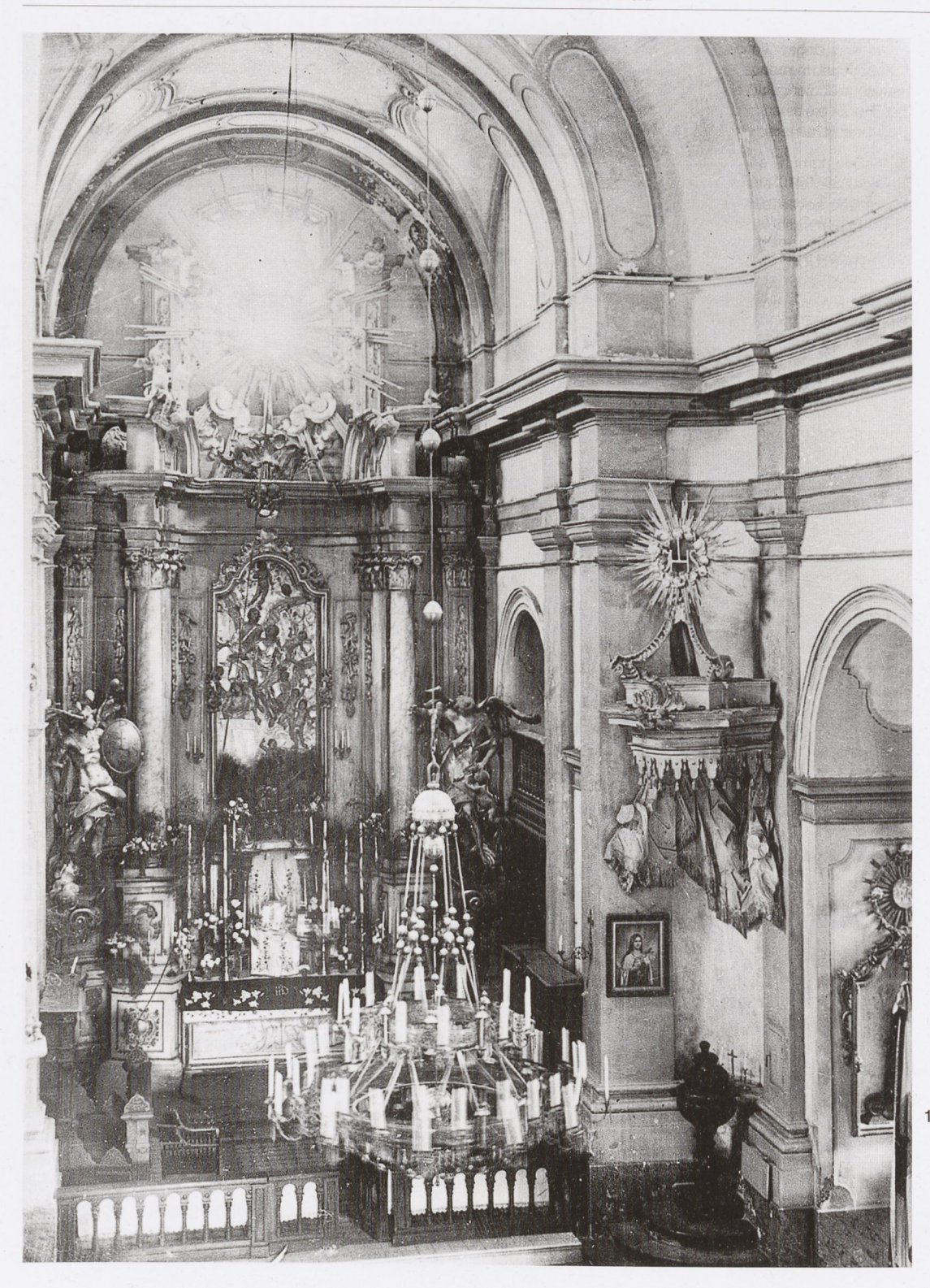
Monasterzyska, Roman Catholic parish church, interior with the high altar, before 1939.