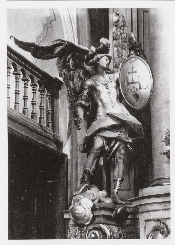
Johann Georg Pinsel, «Archangel Michael», high altar of the Roman Catholic parish church in Monasterzyska.