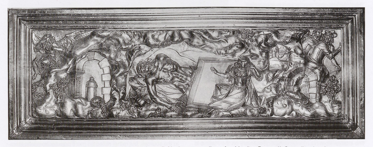
15. «Dead Christ Mourned by Saint Mary Magdalene», bas-relief in the antependium of a side altar, Przemyśl, Carmelite church.