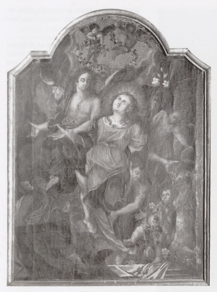
«Assumption of the Virgin Mary», mid-18<sup>th</sup> c., Zajączki Pierwsze, Roman Catholic parish church.

sion of Christ ('Quam autem ob causam [Christus] advenit, nisi ut te ex peccati voragine liberatum et regni currum, id est virtutis institutum ipso ascensu adhibentem, in monte adduceret?').<sup>36</sup>