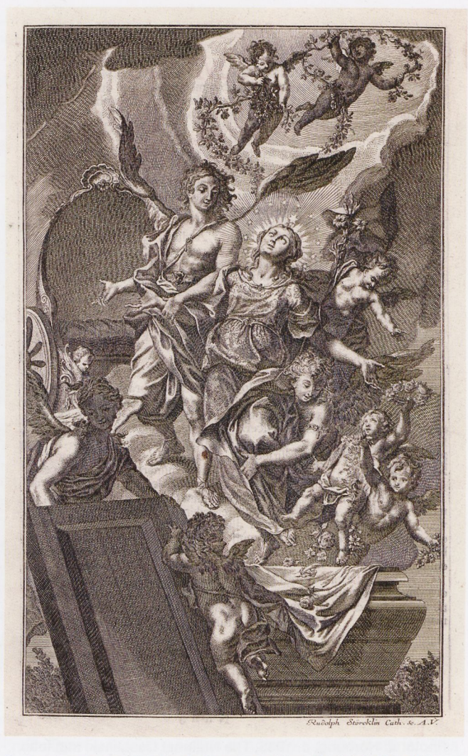
«Assumption of the Virgin Mary», etching, Rudolph Störcklin cath. sc. A.V. (version used by the publishing house of the Kempten monastery)

two separate series of copper plates for the Augsburg and Kempten publishing houses. The prints differ in small details, which can be noticed only through a meticulous comparison of the originals [Fig. 5].<sup>20</sup>