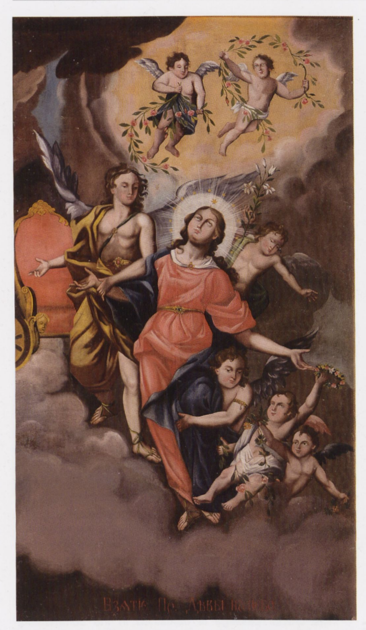
9. «Assumption of the Virgin Mary», end of the 18<sup>th</sup> c., Ryboły, Greek Catholic church.