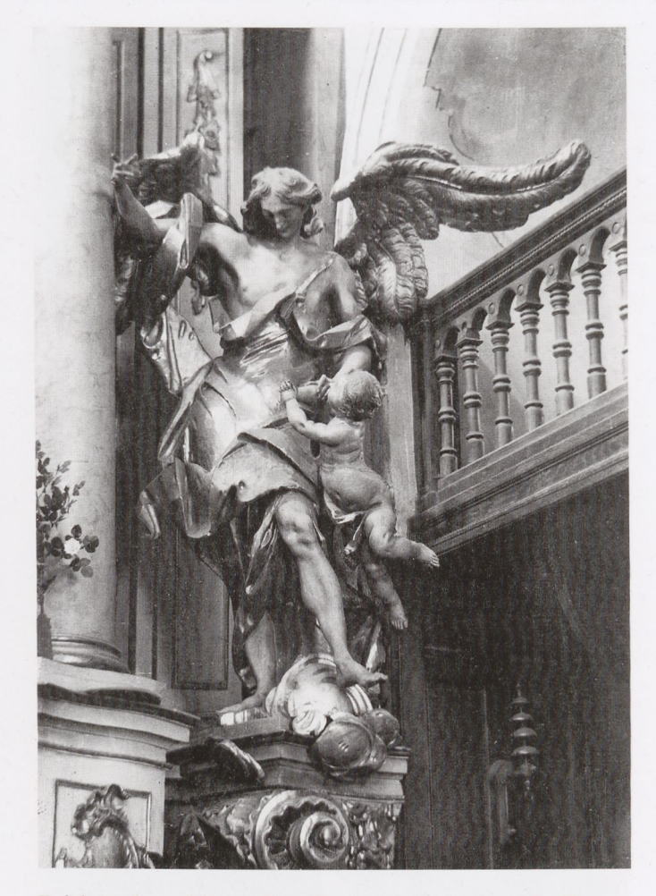
Johann Georg Pinsel, «Guardian Angel», high altar of the Roman Catholic parish church in Monasterzyska.

The discovery of the originality of Göz's Assumption composition brought about some interesting side effects. It turned out that, in this sense, the aforementioned bas-relief from Mo-