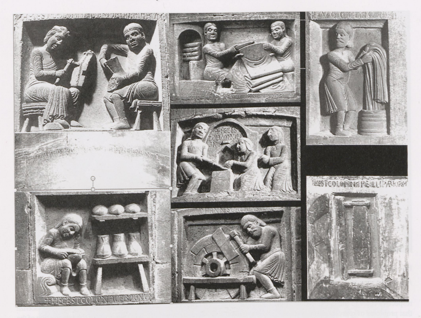
Figure 3.5 Piacenza Cathedral: Nave reliefs of lay patrons (Bruno Klein)

century (Figure 3.5). They are integrated in the pillars, and represent lay persons who without doubt contributed to the construction of the cathedral, because the reliefs are accompanied by inscriptions, saying that the columns were almost in the possession of those people: 'haec est columna – 'this is the column' of the represented person is the usual formulation of the inscriptions. <sup>14</sup> It is obvious that there must be some relation between the representations of the lay founders and the saints above them. Maybe, that those citizens were less interested in the representations of saint bishops, counterparts of the ecclesiastical lord of the city, than in images of more 'modern' and more 'popular' saints, which could not easily be claimed by one or another party of the society at Piacenza.