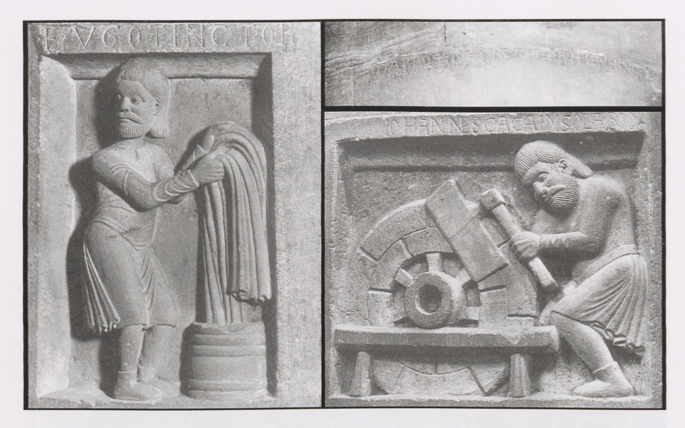
FIGURE 3.6 Piacenza Cathedral: Nave reliefs of Ugo and Johannes (Bruno Klein)

respective roles in the construction of the Cathedral, and that problems of representation were solved by the diversity of representations and inscriptions.