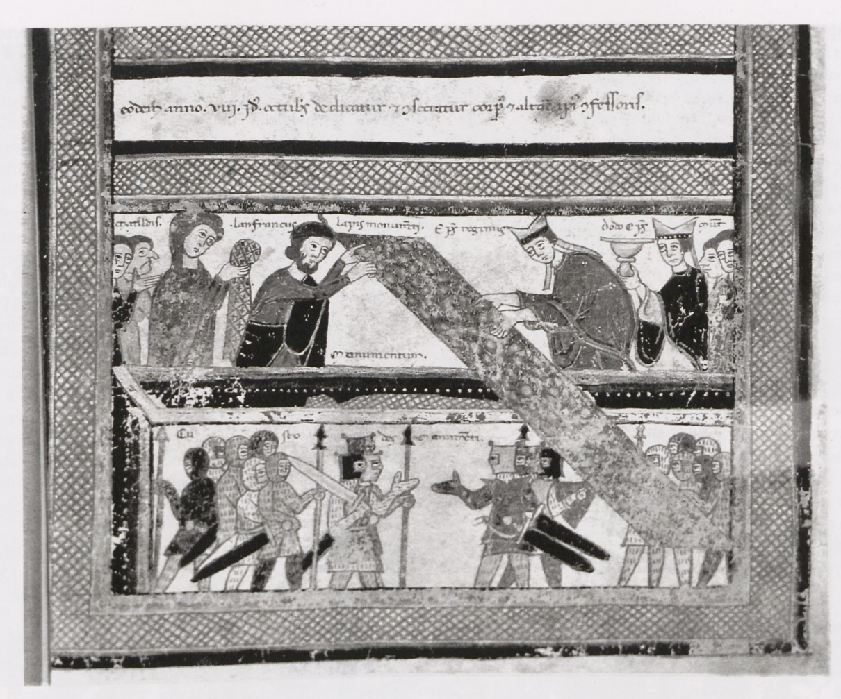
FIGURE 3.2 Modena, Archivio capitolare di Modena MS II.11, fol. 9r: Translation of the relics of S. Geminiano