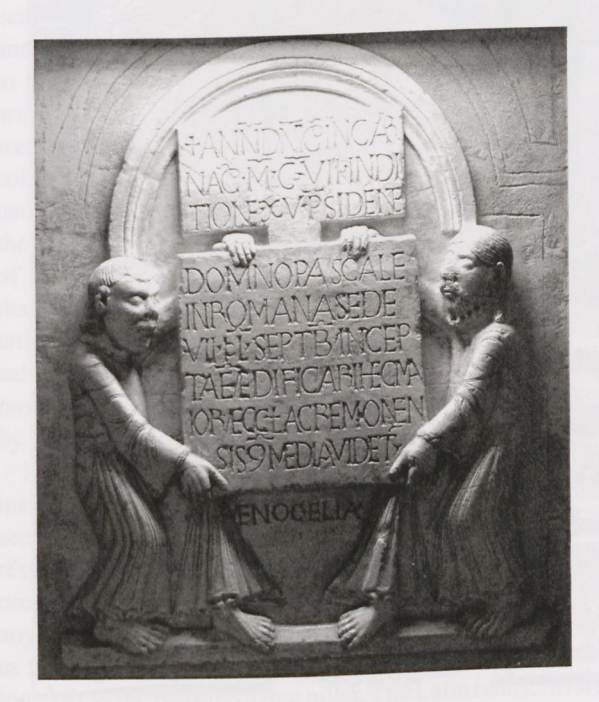
Figure 3.3 Cremona Cathedral: Plaque recording the foundation of the Romanesque cathedral (Renzo Dionigi)

of Piacenza for nearly 25 years, died and his successor, named Arduino, was elected? Only four years later, in 1126, the 'consuls' of the city were mentioned for the first time. This doesn't mean that the office of the 'consul' was created exactly at that moment, because consuls normally appeared in written records only some time after the installation of that office. But it is certain that the existence of consuls always indicates the achievement of a certain degree of autonomy of a commune. So it seems quite likely that there were connections between the change in the episcopate, the beginning of the construction of a new cathedral and the creation of the commune of Piacenza. Here it is possible to observe social instability combined with a new political dynamic, and cathedral-building as a means in the struggle between old forces and new claims.