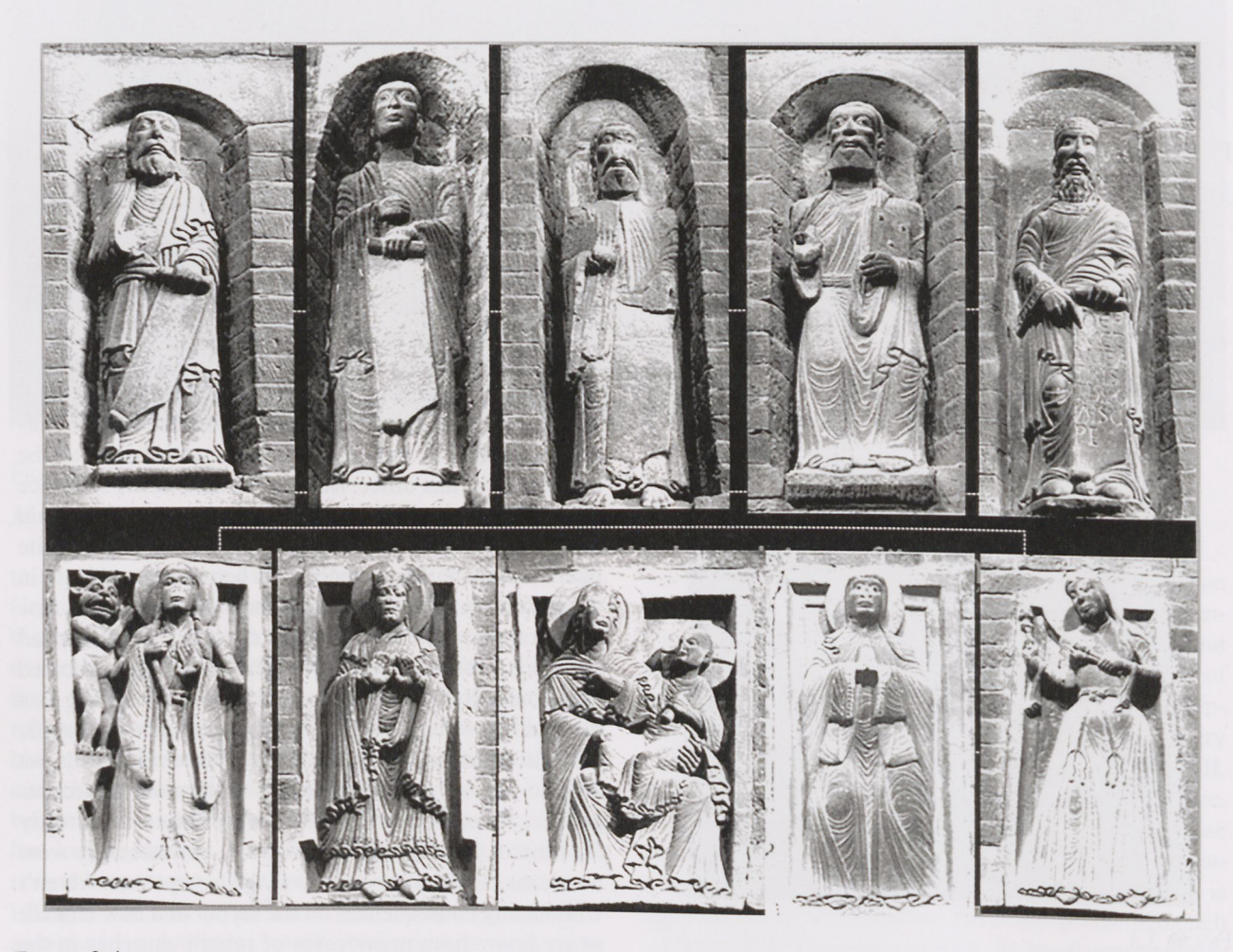
Figure 3.4 Piacenza Cathedral: Nave reliefs of saints and prophets (Bruno Klein)

It is also only in those western parts of the cathedral that we find some other, very uncommon, reliefs of the 12th