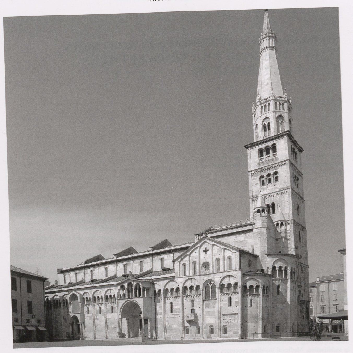
Figure 3.1 Modena Cathedral: Exterior from south-east

to translate the relics of the patron saint of the city, San Geminiano, in 1106, it was extremely difficult to resolve the problem of how to manage that move, due to the extreme suspicion between the different parties. Each of them feared that the others would take possession of the relics. It is very surprising to see that in the end the new bishop and the architect of the building, named Lanfrancus, carried the relics together. It seems that the bishop became able to fulfill that very difficult task, because he had lost importance during the building process and was now able to act more freely. On the other hand, it is astonishing to see how an architect, hitherto nearly unknown as person or institution, could obtain such an important role. It seems that building processes were able to open and to set moving historically fairly closed constellations.