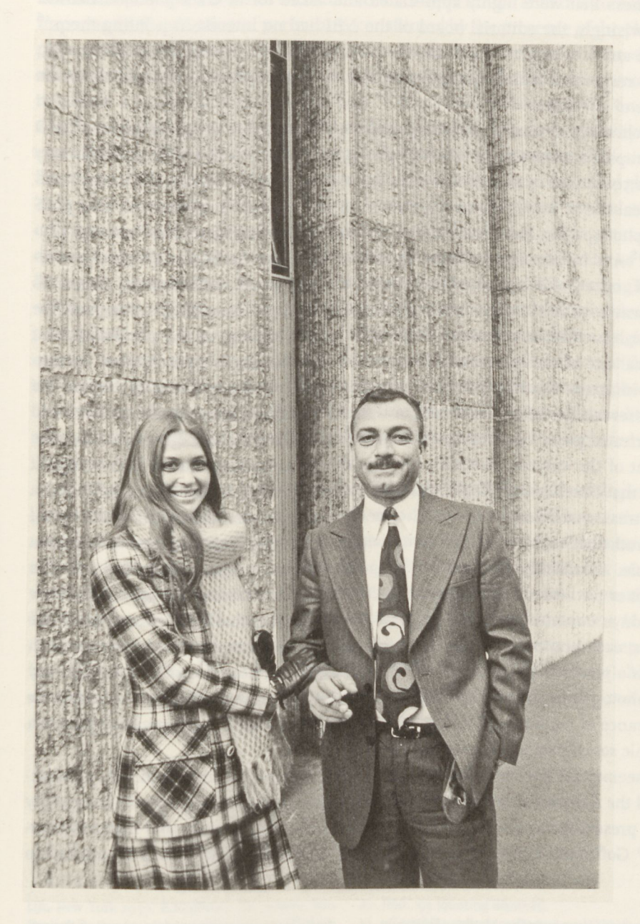
Fig. 1: Couple in front of the Hotel «Duma» in Budapest, 1972, Gelatin Silver Print, 238 \times 159 mm