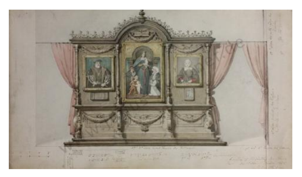
Figure 8 Julius Hübner, Design for the installation of Holbein's Madonna in the Dresden Gemäldegalerie, 1857. German private collection, <u>www.julius-huebner.de</u>.