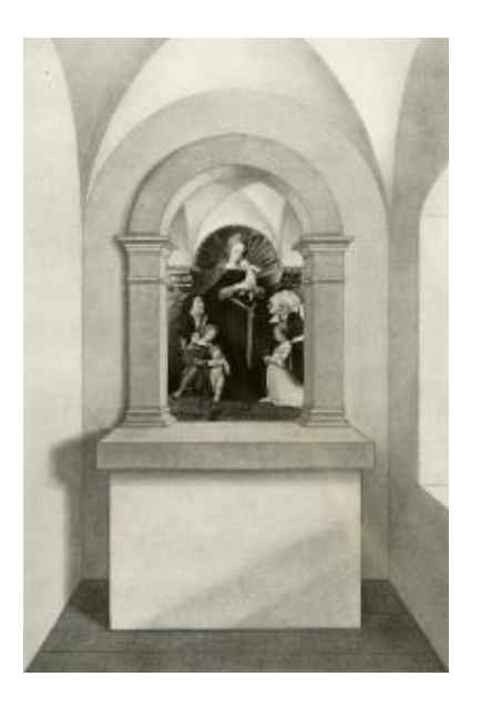
Figure 11 Hans Reinhardt, reconstruction of the original installation using Grüder's copy of 1860, Basel 1954. Hans Reinhardt, "Die Madonna des Bürgermeisters Meyer von Hans Holbein d. J., Nachforschungen zur Entstehungsgeschichte und Aufstellung des Gemäldes," in Zeitschrift für schweizerische Archäologie und Kunstgeschichte 15/4 (1954/1955), 244-254, plates 82 and 83.

A remarkable image process preceded the pictorial montage: in order to reconstruct the original presentation, Reinhard first referred to Grüder's copy in Basel and hung it experimentally in the mansion in Gundeldingen. As already in the case of the restoration, work on the image led to conjuring a type of originality that went beyond the original (in its present state): 'Holbein must have made his