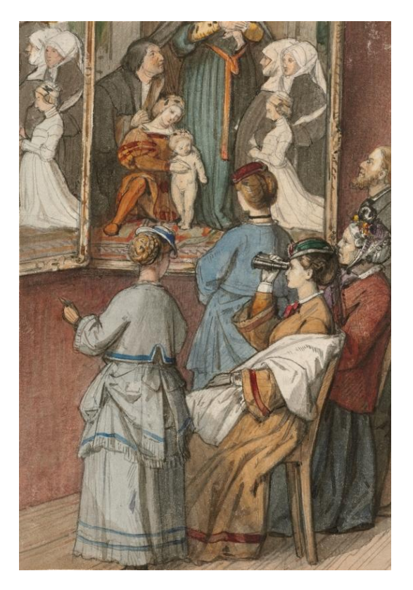
Figure 1 Alfred Richard Diethe, Visitors at the Holbein Exhibition, 1871. Staatliche Kunstsammlungen Dresden, Kupferstich-Kabinett, Inv.-Nr. C 1985-84, Photo: Herbert Boswank.