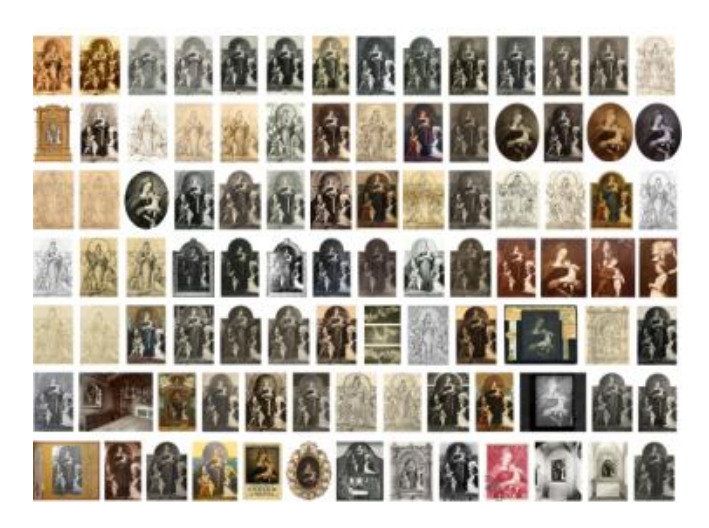
Figure 12 Original reproductions of the Holbein Madonna, selection from 1635 through 1954. Montage: Lena Bader.

The Holbein controversy is the visual testament to a wide-reaching orientation to images (fig. 12). The pleasure in images that emerges from the early representations shows itself as a noteworthy reflection of the dispute: only in the side-by-side viewing of the pictures do the complex interferences between original, copy, and reproduction become manifest. The surviving original-reproductions join together into a revealing composite image, through which the Holbein controversy emerges as a testament to an active will to images. The panorama of 'interpretations of effect' attests to a fascination of creative variation and breaks apart established representational hierarchies between original and reproduction. The images' historical entanglements take precedence over the unique image, and the perspective of inter-iconicity over fetishism of the original. Instead of becoming the projection screen for a one-sided auratization, the single image, in the course of being viewed together with other images, emerges from the iconic cosmos in a state of enrichment.