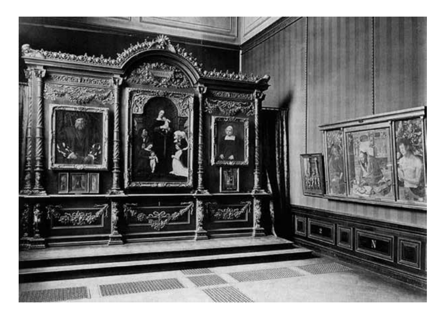
Figure 9 Mise en valeur of the Dresden Madonna in the so-called "Holbein-Saal" [Holbein Room], photograph ca. 1900. Harald Marx, Gemäldegalerie Alte Meister Dresden , vol. 2, Illustriertes Gesamtverzeichnis (Cologne 2005), 36.