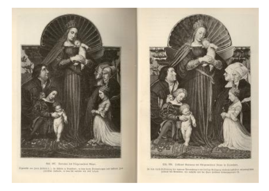
Figure 6 The Holbein Madonna before and after its restoration, juxtaposition from Knackfuß's Deutsche Kunstgeschichte , 1888. Hermann Knackfuß, Deutsche Kunstgeschichte , vol. 1, Bielefeld/Leipzig 1888, figs. 397-398, pp. 674-575.

It was especially the striking differences between the two versions that intensified the authenticity dilemma. One detail was particularly salient: while the Darmstadt Christ child seemed to smile, his counterpart from Dresden seemed relatively melancholy. This small difference affected the centre of the composition and was quickly declared the 'main difficulty'<sup>48</sup> in the Holbein controversy. From a contemporary perspective, the related discussions are necessarily frustrating since they can no longer be followed on the basis of the original, following the picture's thorough restoration in 1887. This 'rebirth,' which was celebrated as a 'true miracle',<sup>49</sup> left an interesting trace in Hermann Knackfuß's monograph on German art (fig. 6). Here, the original was presented in a juxtaposition of its two states: the 'marred state' on the left, and the 'restored, original state' on the right. Against the background of then current moment photography and the simultaneous discussions surrounding the déjà-vu phenomenon, the image-historical staging of the pair is all the more significant: 'Whoever has seen the picture before and after its rebirth can hardly believe that he is looking at the same work.' <sup>50</sup>