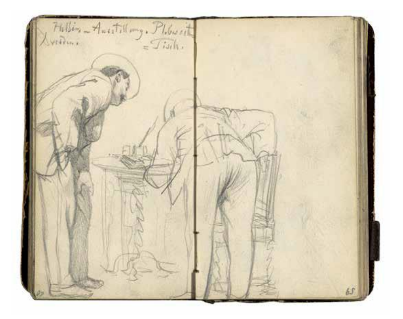
Figure 4 Adolph Menzel, "Holbein-Ausstellung, Plebiscit-Tisch" [Holbein Exhibition, plebiscite table] Dresden, 1871. Berlin, Kupferstichkabinett, Inv. SZ Menzel Skb. 36,1871/75, pp. 59–60

other items exhibited, but simply two men at the 'plebiscite table' (fig. 4).<sup>28</sup> Menzel is among the renowned figures who visited the exhibition in Dresden in 1871. However he did not support the artists' majority vote and instead openly sided with