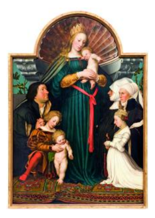
Figure 3 "The Darmstadt Madonna": Hans Holbein the younger, The Madonna of Jakob Meyer zum Hasen, 1526/1528. Sammlung Würth, Inv. 14910

a version that had only resurfaced in 1821, which remained in private possession during the entire debate, first, for several years in Berlin, then in Darmstadt (fig. 3). The Dresden Madonna was until that time considered a 'major painting of German art'<sup>2</sup> and was celebrated on a par with Raphael's Sistine Madonna, also in Dresden. Much-discussed exhibitions, publicity-garnering press releases, countless essays, and numerous reproductions were made to unravel the riddle of the duplication. The less popular painting ultimately won out: today, only the Darmstadt Madonna is considered an original by Holbein. It recently made headlines as 'Germany's most expensive artwork'<sup>3</sup> and since 2012 has hung in Schwäbisch Hall. Meanwhile, the Dresden Madonna was attributed to Bartholomäus Sarburgh and dated later, ca. 1635/1637.