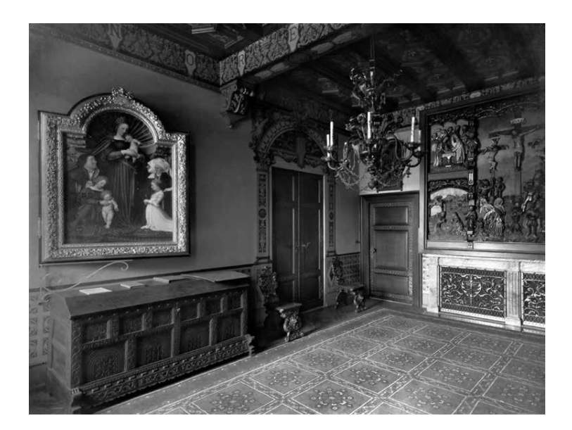
Figure 7 Joseph Magnus, Holbein Room in Darmstadt Residenzschloss, photograph ca. 1900. Hessisches Staatsarchiv Darmstadt, folder R 4 no. 18764.

attached to the subsequently destroyed Baroque frame, which was not the original frame from the time of Holbein, but which contained the painting during the Holbein controversy). Here, too, the mobile mounting elicited variation, inviting the viewer to perceive the painting in motion: its manner of appearance could be modified according to the angle of light and of view. These manipulations to the picture are characteristic of the Holbein controversy; with them, a changing mode of appearance was tested for both original and copy.