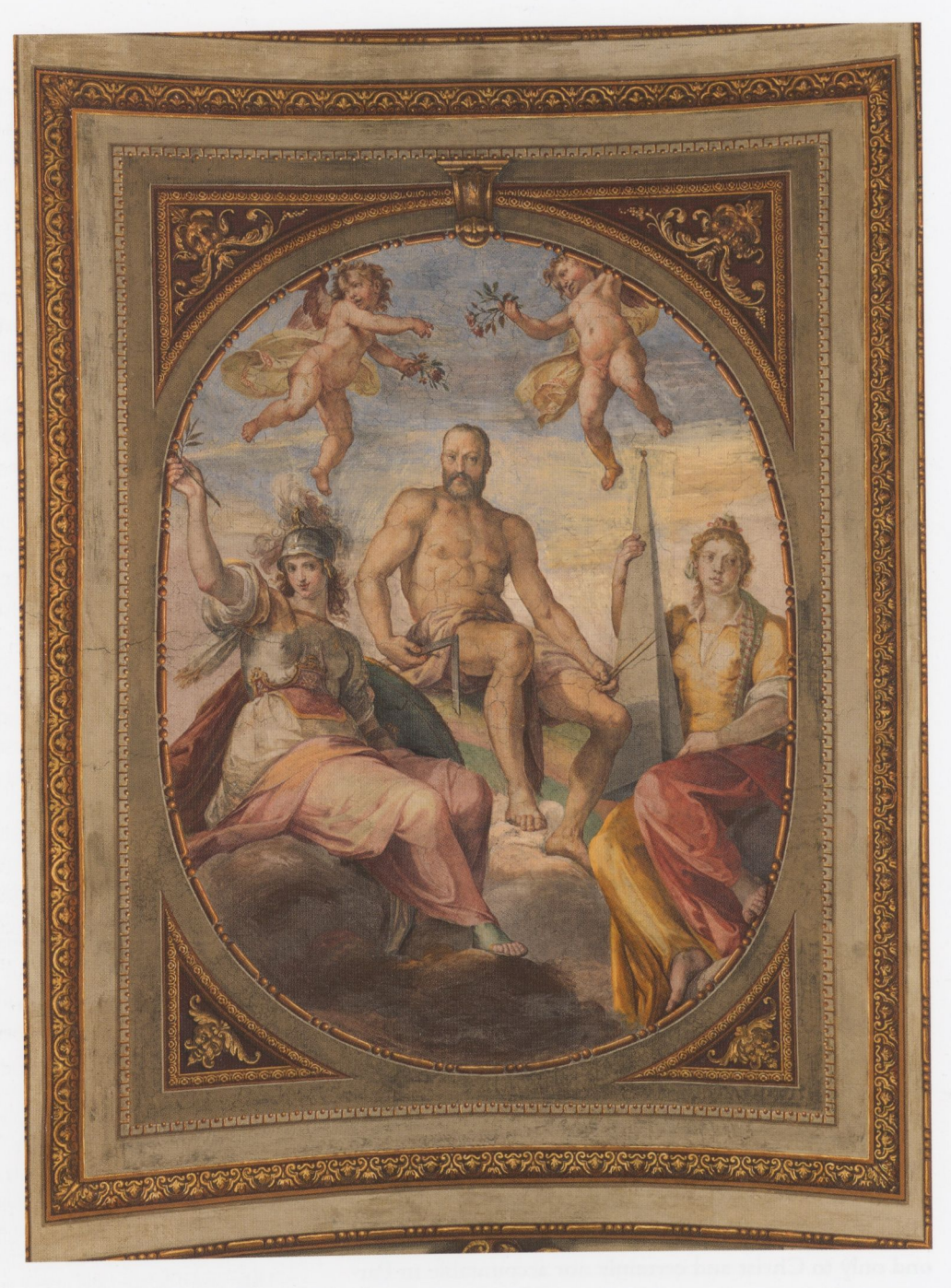
Fig. 5 | Bernardino Poccetti, Allegory of the rule of Cosimo I de' Medici. Florence, Palazzo Pitti, Sala di Bona, ceiling painting.

picting the Last Supper highlighted precisely this ceremony of communion. The altar that stood beneath the painting was enclosed by rails in order to mark the sanctity of that space.<sup>69</sup> In this context it is interesting to read the polemical treatise Altare Christianum by John Pocklington, one of the chaplains of King Charles I. He stressed the dignity of the altar by calling it "the Saviour's Chaire of State upon Earth".<sup>70</sup> The parallel between altar and throne is even