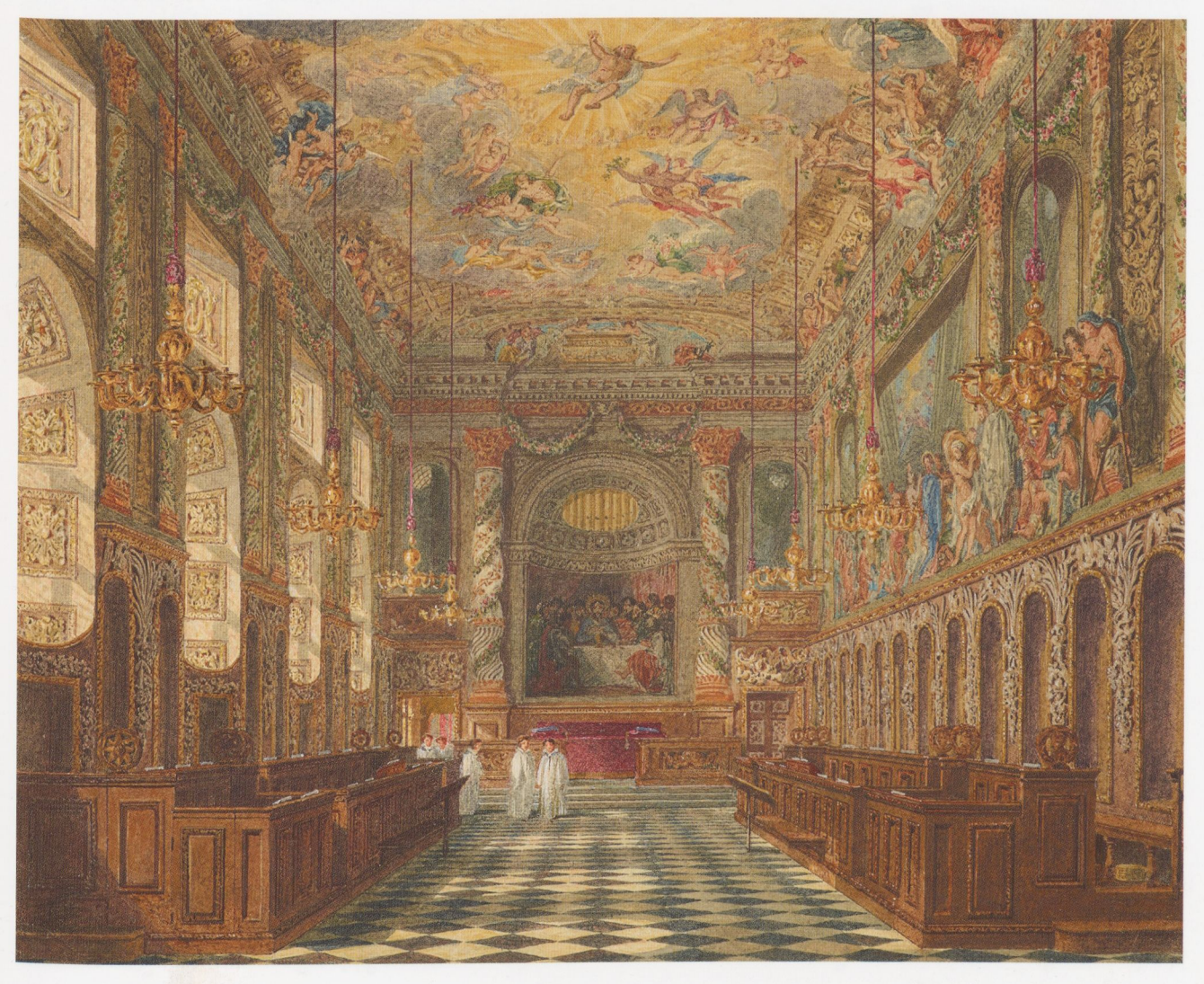
Fig. 1 | Charles Wild, The Royal Chapel, Windsor Castle, watercolour, ca. 1818. Royal Collection, RCIN 922113.

Throne and Altar: Antonio Verrio's Decoration of the Royal Chapel and St George's Hall at Windsor Castle (1680-1683) 9