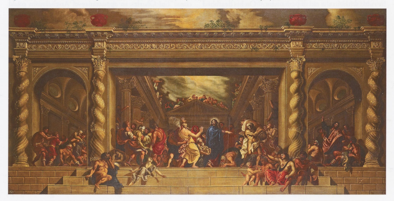
Fig. 3 | Antonio Verrio, Christ Healing the Sick (OM 298, RCIN 404052).

In a subsequent chapter Tenison points out that it is legitimate to paint Christ's glory: