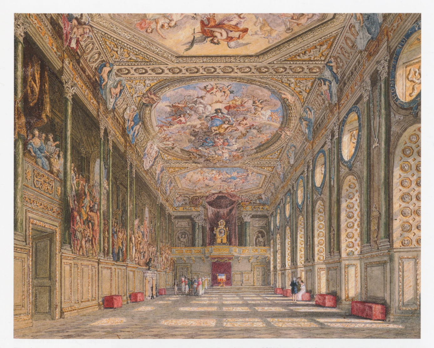
Fig. 4 | Charles Wild, St. George's Hall, Windsor Castle, watercolour, ca. 1818. Royal Collection, RCIN 922112.

If anything of the Divinity be to be portraied, we learn from hence what it may be, not the Godhead but the Shechinah: That is visible, and the expressing of it with the best lights and shadows of Art may therefore be not unlawful, though I know not whether I ought to plead for the expediency of it in common use.<sup>50</sup>