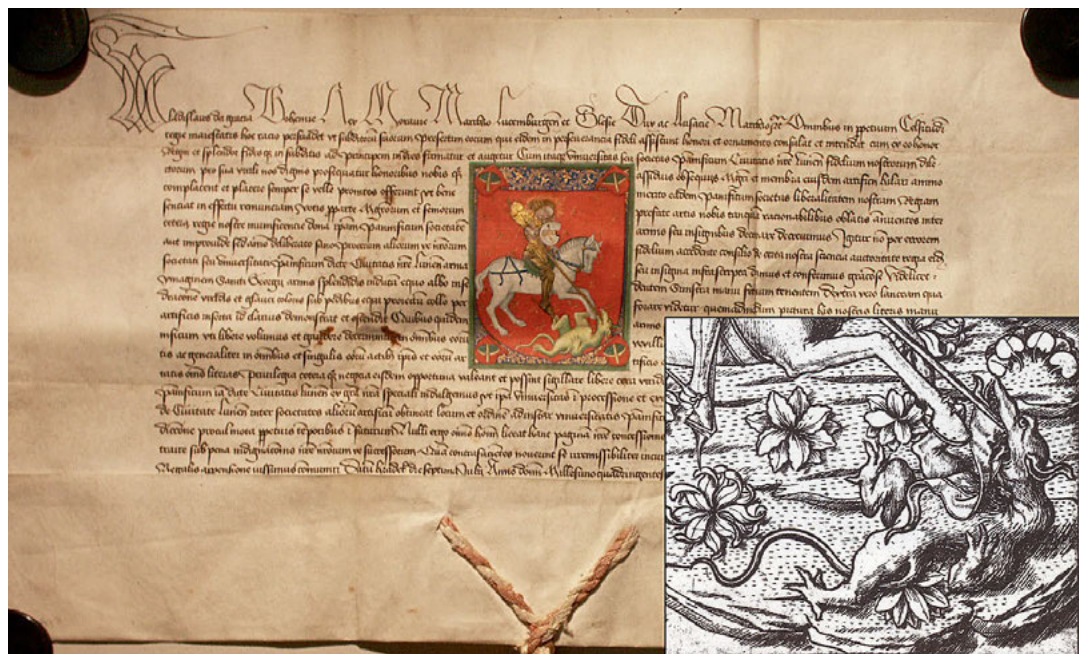
Fig. 7: 1473, Clothmakers of Laun (see no. 53) (a) and copper engraving of Master E.S. (see no. 55) (b).

mous breviary 54 . As was customary for him to do, the Master copied copper engravings made by Master E. S., in this case the dragon fallen onto its back, from Lehrs 146 (fig. 7b) 55 .