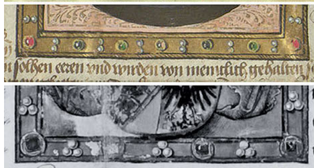
Fig. 6: 1454, Coat of arms from the Flins charter (see no. 48) (a) with details of the frame from the Krems (1443 – see no. 50) (b) and Perotti (1440 – see no. 49) (c) charters; all by the master of the ›Handregistratur‹ of Frederick III. http://monasterium.net/mom/IlluminierteUrkunden/collection