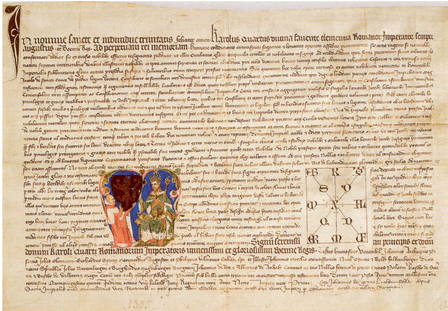
Fig. 4: 1355, Santacroce grant, overall view (see no. 33). http://monasterium.net/mom/IlluminierteUrkunden/collection