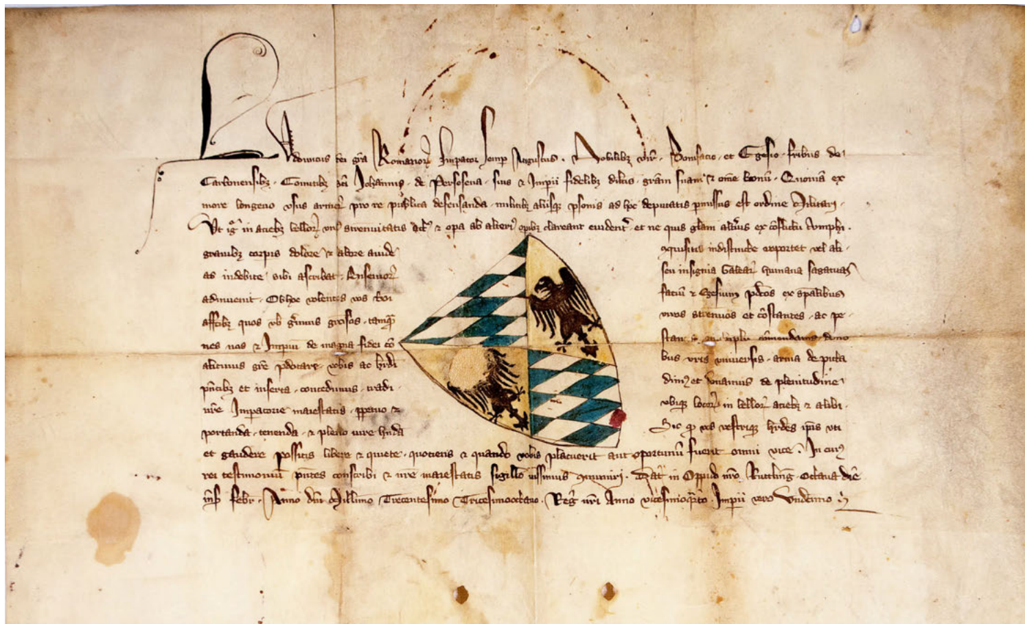
Fig. 3: 1338, Emperor Louis the Bavarian grants a coat of arms to the brothers Boniface and Egesius de Carbonesibus, counts of San Giovanni in Persiceto (near Bologna) (see no. 21). http://monasterium.net/mom/illuminierteUrkunden/collection