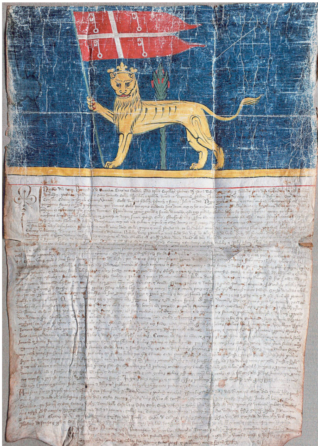
Fig. 1: 1316, Bernard de Coucy to Viterbo (see no. 11). http://monasterium.net/mom/IlluminierteUrkunden/collection