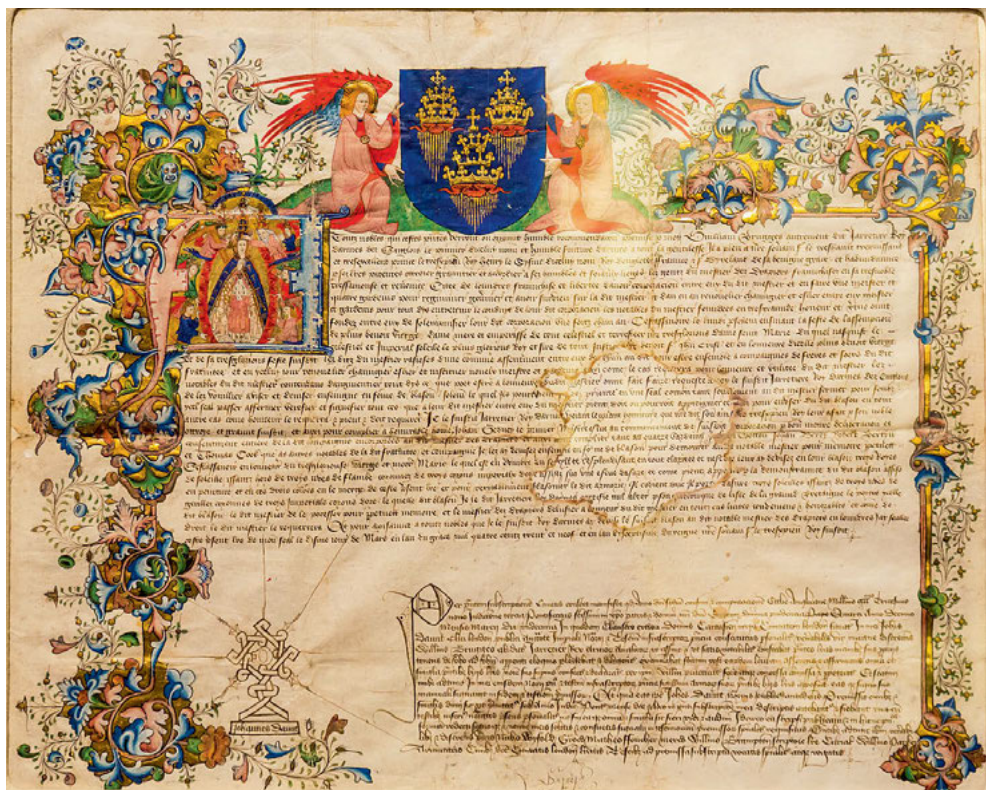
Fig. 5: 1439, Grant of arms to the Company of Drapers (see no. 37).

https://www.pinterest.at/pin/AYY0oWQMhgtr-qxHttvWIDfGC4x-eQLCT3h1SjpcJbi9Xz6DMwpr4