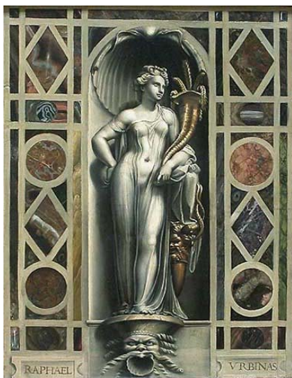
Workshop of Raffaello (attributed to Giulio Romano) Ceres, oil on wood, 38 x 31 cm; Louvre, Paris. ca. 1516