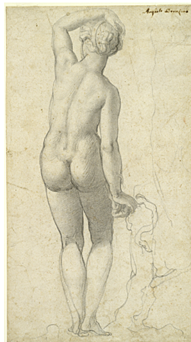
Bronzino, Leda , after Bandinelli