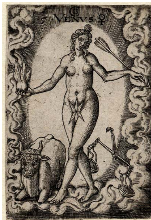
Venus , British Museum, Prints & Drawings Registration number: 1913,0213.6 Hollstein 6 (XIII, p.21); Bartsch IX.17.4

It can possibly not be excluded, however, that the words in large capital letters were simply added in Antwerp at the press of Philips Galle, who has affixed his own notices to the print, in order to give to an image of an obscure statue in far-away Florence a more universal appeal for a wider audience of potential buyers. Galle's engraving of the altar wall of the Galli Chapel in SS. Annunziata in Florence, with Stradanus's Crucifixion , contains some inscriptions that do not refer to the painting (and are not present in the chapel) and perhaps render it a general devotional image rather than simply the reproduction of a painting in Florence, although others of the inscriptions recorded in the print can still be read today in situ .