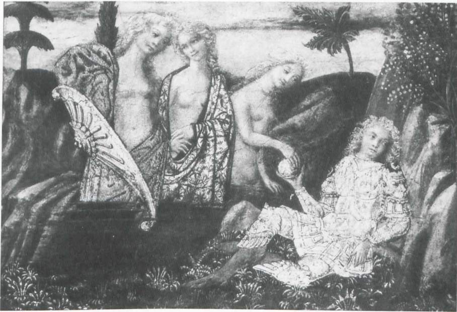
15 Francesco di Giorgio Martini (attributed to), The Judgment of Paris as a dream-vision (fragment of a cassone front, tempera on wood). Los Angeles, The J. Paul Getty Museum.