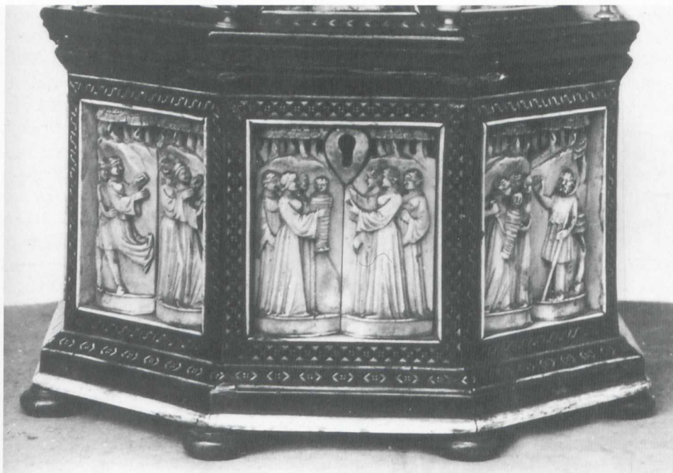
8 Embriachi workshop, Scenes from the life of Paris (The birth of Paris, Paris being given to his new mother). Vienna, Kunsthistorisches Museum.