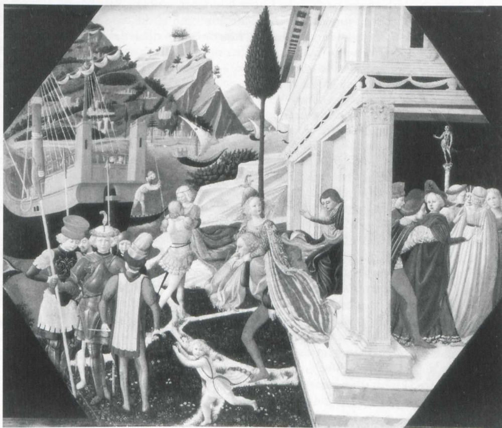
23 Follower of Beato Angelico (Zanobi Strozzi), The Rape of Helen (tempera on wood). London, National Gallery.