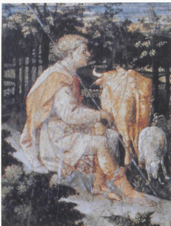
25 The Judgment of Paris, detail of fig. 12.