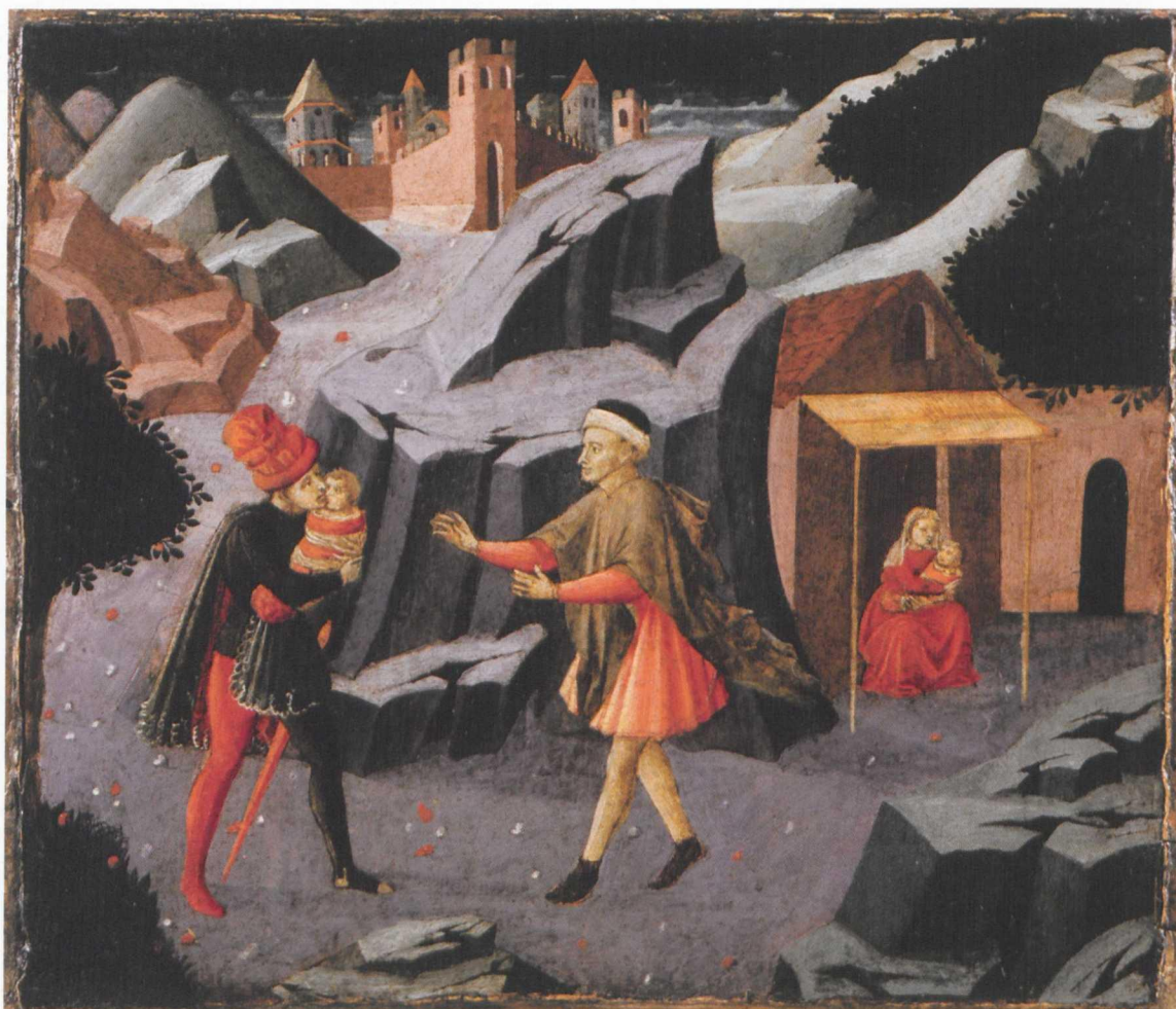
6 Florentine painter, The childhood of Paris (tempera on wood, 46 x 53,2 cm, ca. 1450). Kraków, Royal Wawel Castle.