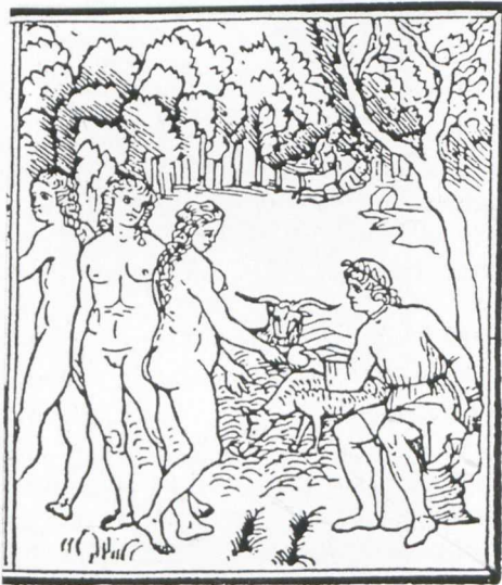
16 The Judgment of Paris , woodcut, from Francesco Colonna, Hypnerotomachia Poliphili , Venice 1499, fol. k vii r°.