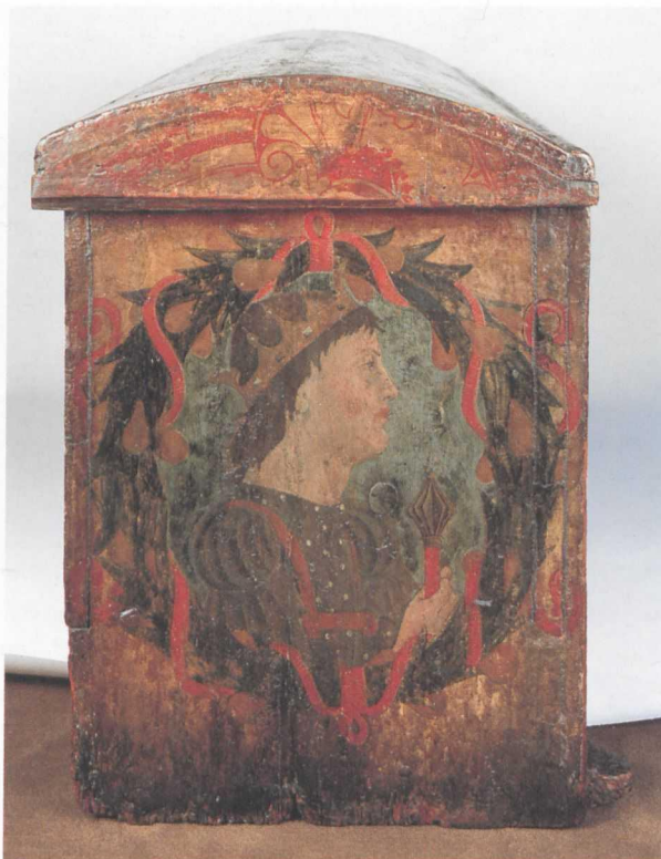
2 Portrait of an Emperor, side panel of fig. 1.