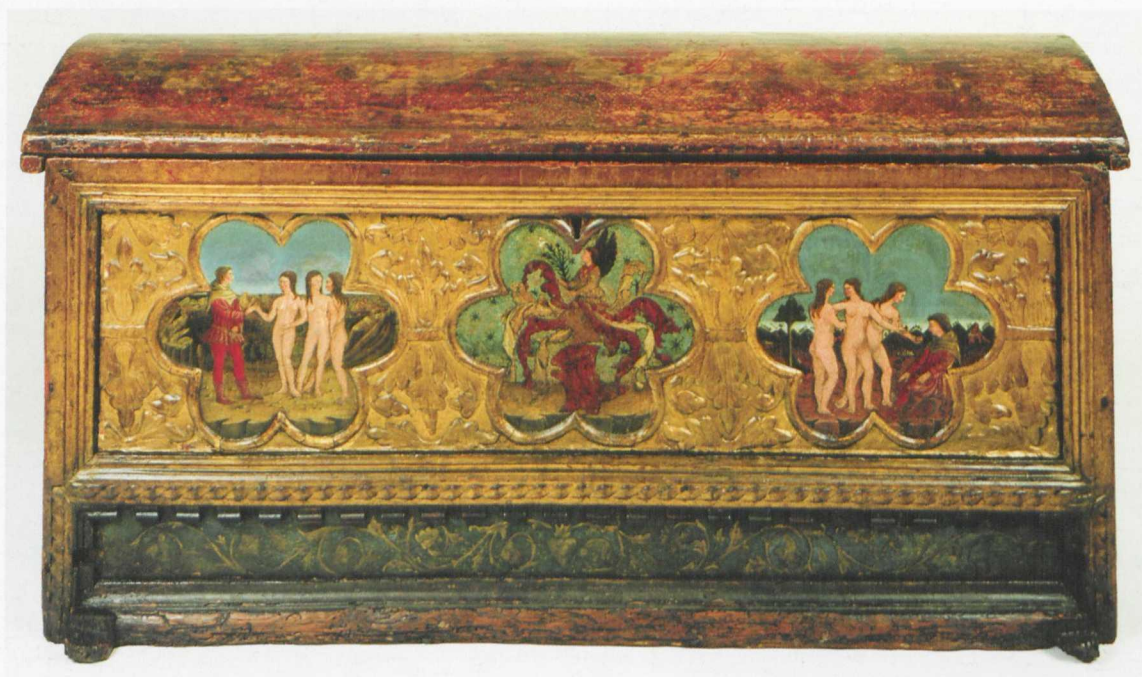
1 Cassone from Verona with scenes depicting the myth of Paris (poplar wood, tempera and pastiglia dorata, ca. 1450). Once in the Lanckoroński collection, now in a private collection.