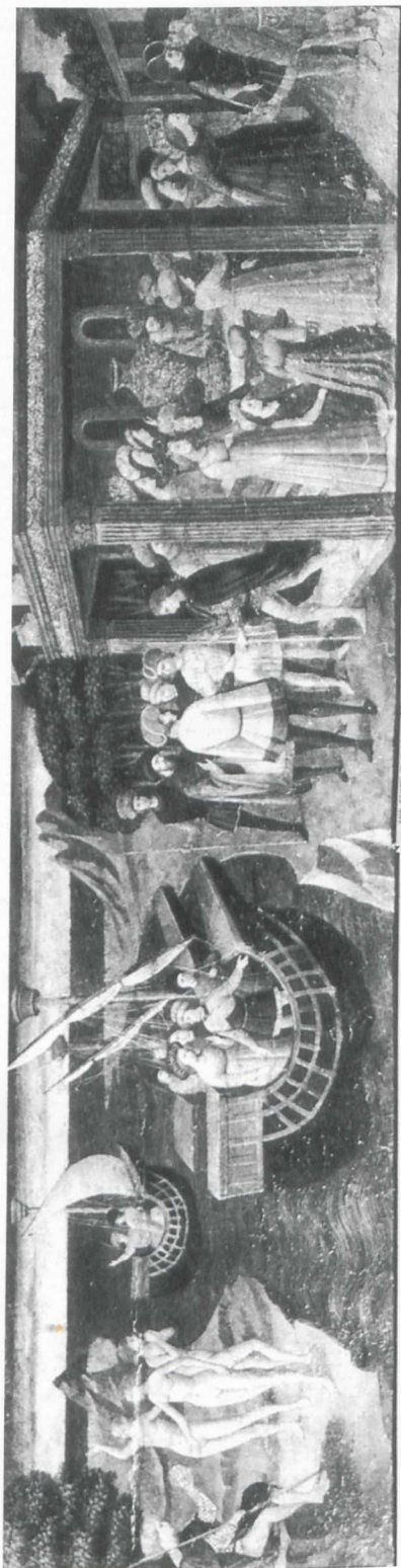
18 Cassone front with scenes from The Judgment of Paris (tempera on wood). Once New York, Metropolitan Museum of Art, sold at Christie's 15 October, 1992.