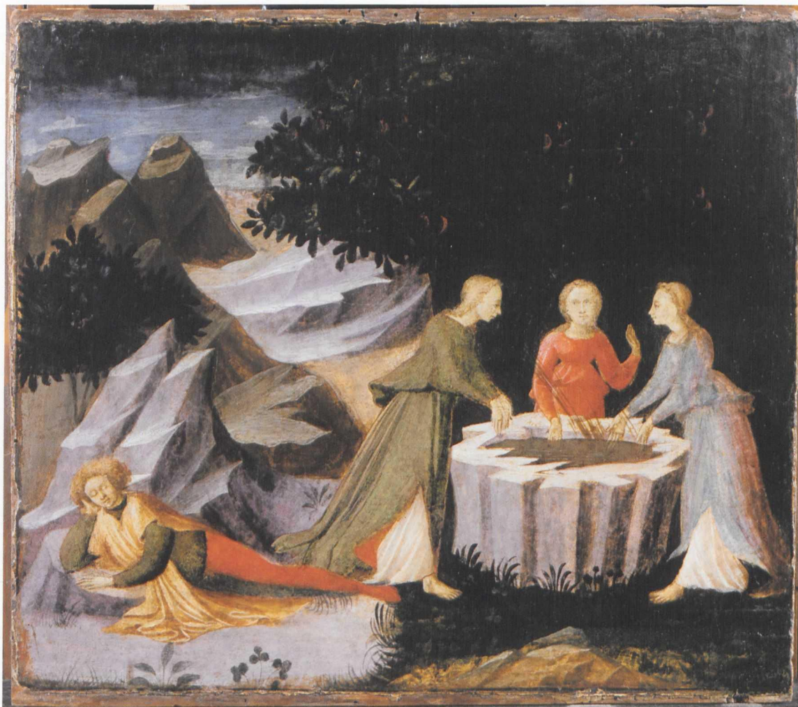
10, 11 Florentine painter, Paris's dream-vision and the three Goddesses by the well (tempera on wood, 42,2 x 49,6 cm, ca. 1450) and detail. Kraków, Royal Wawel Castle.