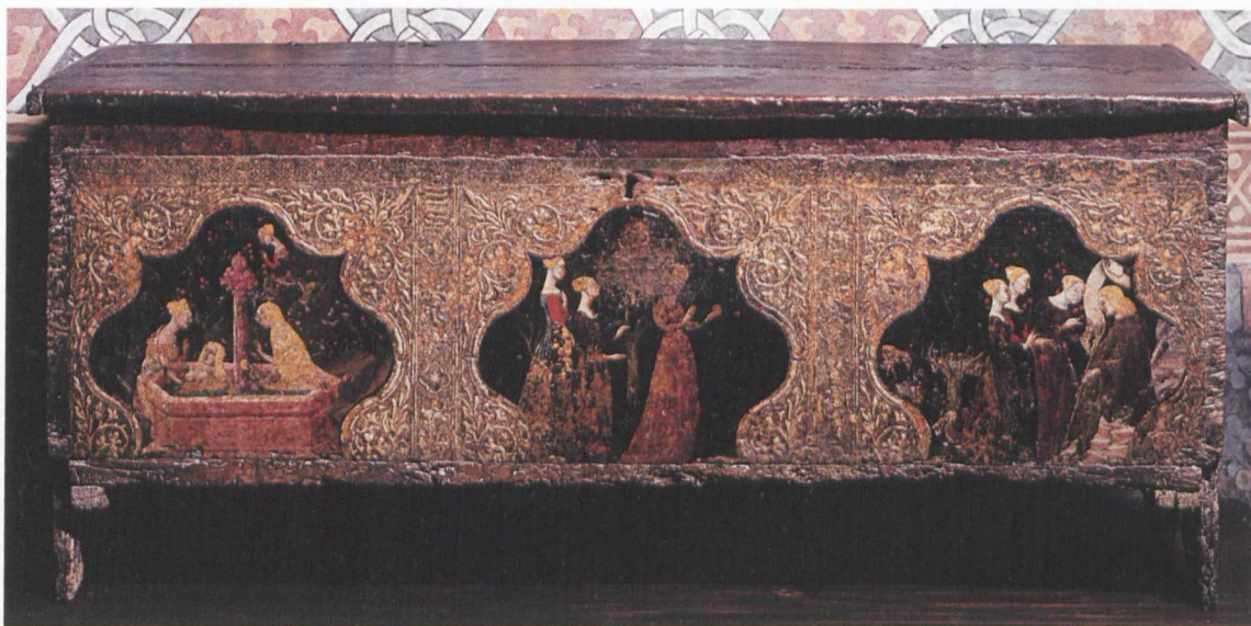
17 Cassone with scenes from The Judgment of Paris (tempera and pastiglia on wood). Florence, Palazzo Davanzati.

the foreground, a male figure is handing over a newborn baby to another older man. To the right, there is a woman with (another?) infant seated in front of a modest hut. This could be the next scene in the same episode, in which the baby is entrusted to his new mother's care. It is clear that the painter was not trying to render a historically accurate view of antiquity since all the personages in the picture are dressed in typical early Renaissance clothes, such as the characteristic caps, hose or stockings and short coats ( guarnaca ) with hoods. The man holding the baby has a long sword buckled to his belt and the city in the background resembles most mid-fifteenth century Italian cities. Given the context of these two scenes, there is no doubt that this picture does indeed show the episode from Paris's infancy, in which he is given as a newborn baby to a shepherd family. 60