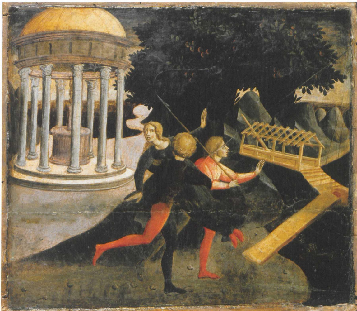
21 Florentine painter, The Rape of Helen (tempera on wood, 43,4 x 50,3 cm, ca. 1450). Kraków, Royal Wawel Castle.

The Abduction of Helen was much less popular in the art of the Renaissance than the Judgment of Paris . 107 There are, however, some interesting depictions of this scene, which deserve to be cited here, for instance a small panel (most probably the franco of a cassone ), dated ca. 1440, now in the Národní Galerie, Prague. 108 It shows Paris carrying Helen, who is obviously resisting. As in the Lanckoroński panel, there is also a ship, but this time it is depicted on the left hand side of the painting. Some analogies are to be found in two contemporary representations of this subject on deschi da parto or birth salvers in the National Gallery in London (figs. 22-23). The first is a work attributed to the Master of the Judgment of Paris, while the second to a follower of Fra Angelico, perhaps Zanobi Strozzi. 109 Both paintings depict a temple; on the former, it is rather small and dedicated to Apollo, whereas on the latter, it is much larger, with a statue of Venus inside. In addition, there is a ship on the seashore and many participants to the event. The scene on the first desco da parto depicting slender, elegant women, is still some-