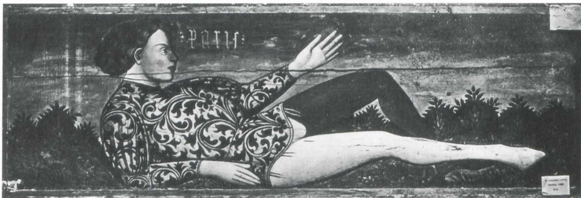
24 Paris, the inside of a cassone lid (tempera on wood). Florence, Museo Horne.

what Gothic, while the second by Fra Angelico's follower is somewhat similar in style to the panel from the Lanckoroński collection, but is of a higher artistic quality and certainly much better preserved. There is a great tumult, yet without any visible signs of a battle, despite the presence of many witnesses; a companion of Paris is carrying the beautifully clad Helen over his shoulder, while Paris himself is probably the figure in armour shown frontally in company of a group of men armed with spears or swords. Other Greeks in wake of Paris's servant are running towards the ship carrying the women who have already been abducted, while others are trying to follow their example. Francesco di Giorgio Martini also depicted this subject ca. 1470, although this time not on a cassone front but rather on a spalliera panel, which, unfortunately, was cut into pieces. 110 His work also clearly shows a real abduction and not Helen voluntarily making her way to the ship.