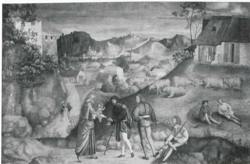
9 School of Giorgione, The handing of Infant Paris to a Nurse. Once Milan, private collection.