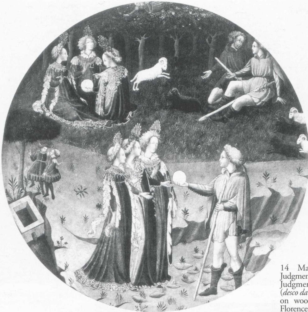
14 Master of the Judgment of Paris, The Judgment of Paris ( desco da parto , tempera on wood, ca. 1430). Florence, Bargello.

It seems that the story of Paris's childhood was invented much later than the tales about his judgment and the abduction of Helen. The tale of a prophecy was made up to explain somehow the circumstances of the famous judgment. According to this story, the fall of Troy was not only due to the fact that Eris had not been invited to Thetis's and Peleus's wedding party, but also because several prophetic dreams and visions had been ignored. One of these prophecies said that Priam's wife would give birth to a boy who would be the "brand of a great fire". The oldest extant literary reference to Hecuba's dream occurs in Pindar's VIIIth Pean, and the same version can also be found in Euripides's "Andromache". 52 Meanwhile, Virgil refers to the tale as follows: "Blood of Trojan and Rutulian shall be thy dower, maiden, and Bellona awaits thee as thy bridal matron. Nor did Cisseus' daughter alone conceive a firebrand and give birth to nuptial flames" (Aeneid VII, 317- 320). 53 It is also mentioned in Ovid's "Heroides" 54 and again in Hyginus's "Fabulae", which include all the key events of Paris's story. 55 Many medieval and modern writers also recount this tale, such as the anonymous author of the so-called "Compendium historiae Troianae-Romanae" 56 , Armannino Giudice (also known as Armannino da Bologna) 57 in his "Fiorita", and Giovanni Boccaccio. 58 These authors also relate Paris's birth and the events directly following it.