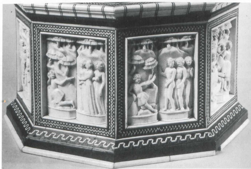
13 Embriachi workshop, The Judgment of Paris. Vienna, Kunsthistorisches Museum.