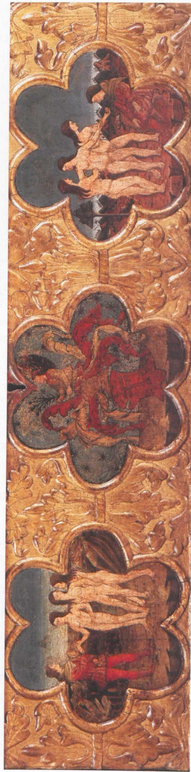
19 The awakening of Paris and the Judgment of Paris, detail of fig. 1.