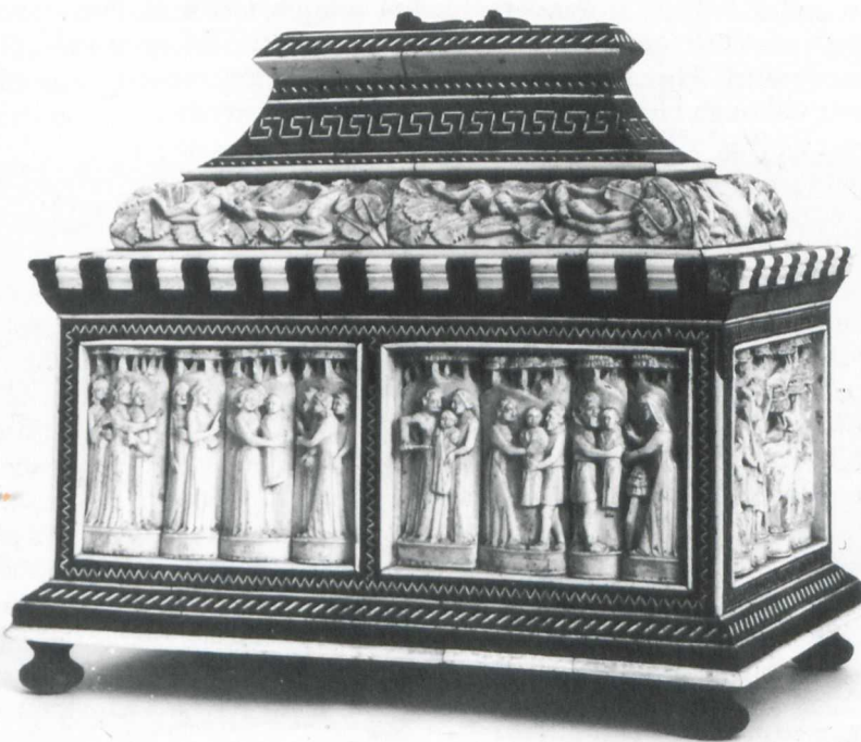
7 Embriachi workshop, Scenes from the life of Paris (The birth of Paris, An attempt to put Paris to the sword, Paris being delivered to the shepherd and being given to his new mother). Oxford, Ashmolean Museum.