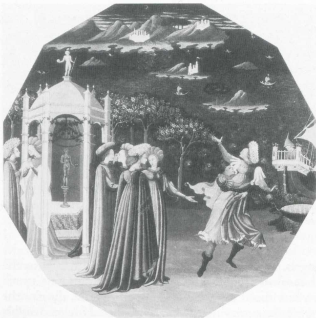
22 Master of the Judgment of Paris, The Rape of Helen ( desco da parto , tempera on wood). Private collection, on display in London, National Gallery.