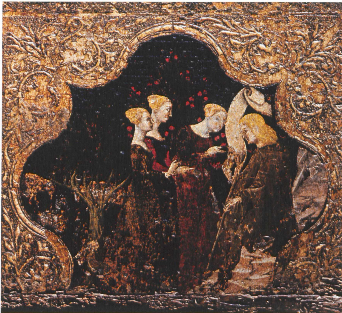
20 The awakening of Paris, detail of fig. 17.

Thus, there are two distinct episodes described; in the first, a tired Paris lies down on the ground and falls asleep, and in the second, he is an arbiter who is entirely aware of his verdict. Therefore, in this case the judgment cannot have been a vision in a dream, but a 'real' event, as written about by the ancient mythographers and poets. Furthermore, what is interesting in the "Istorieta" version is the absence of Hermes (the wedding of Thetis and Peleus also remains unmentioned) and the fact that the golden ball is thrown amongst the goddesses by unidentified forces — it simply falls from the sky. The judgment described in the "Istorieta" clearly refers to earlier sources (among them Benoît de Sainte-Maure, who mentions Paris's dream by the fountain), but the concept of the two fountains and, above all, the idea of Paris being awoken by the goddesses, is an original invention by the author of the "Istorieta". On this point, the painter showed great imagination since he probably added yet another new element. It would