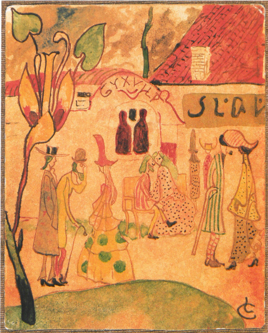
11. Lajos Gulácsy, Gyxyilp , c. 1910, watercolour, pen on cardboard, 11.2 × 9.2 cm. Private Collection, Budapest