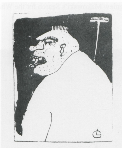
12. Lajos Gulácsy, Bam, the Caretaker , c. 1910, pen on paper, 14 × 20 cm. Budapest, National Széchenyi Library, Manuscript Collection, Fond 124/282.