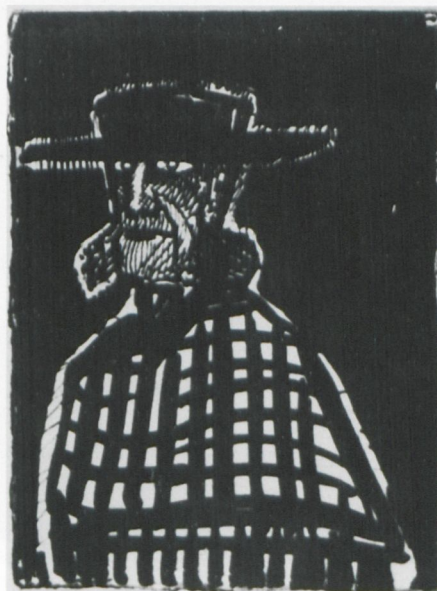
13. Lajos Gulácsy, Doctor Huttertonn , c. 1910, pen on paper, 7.8 × 6.3 cm. Budapest, National Széchenyi Library, Manuscript Collection, Fond 124/282.