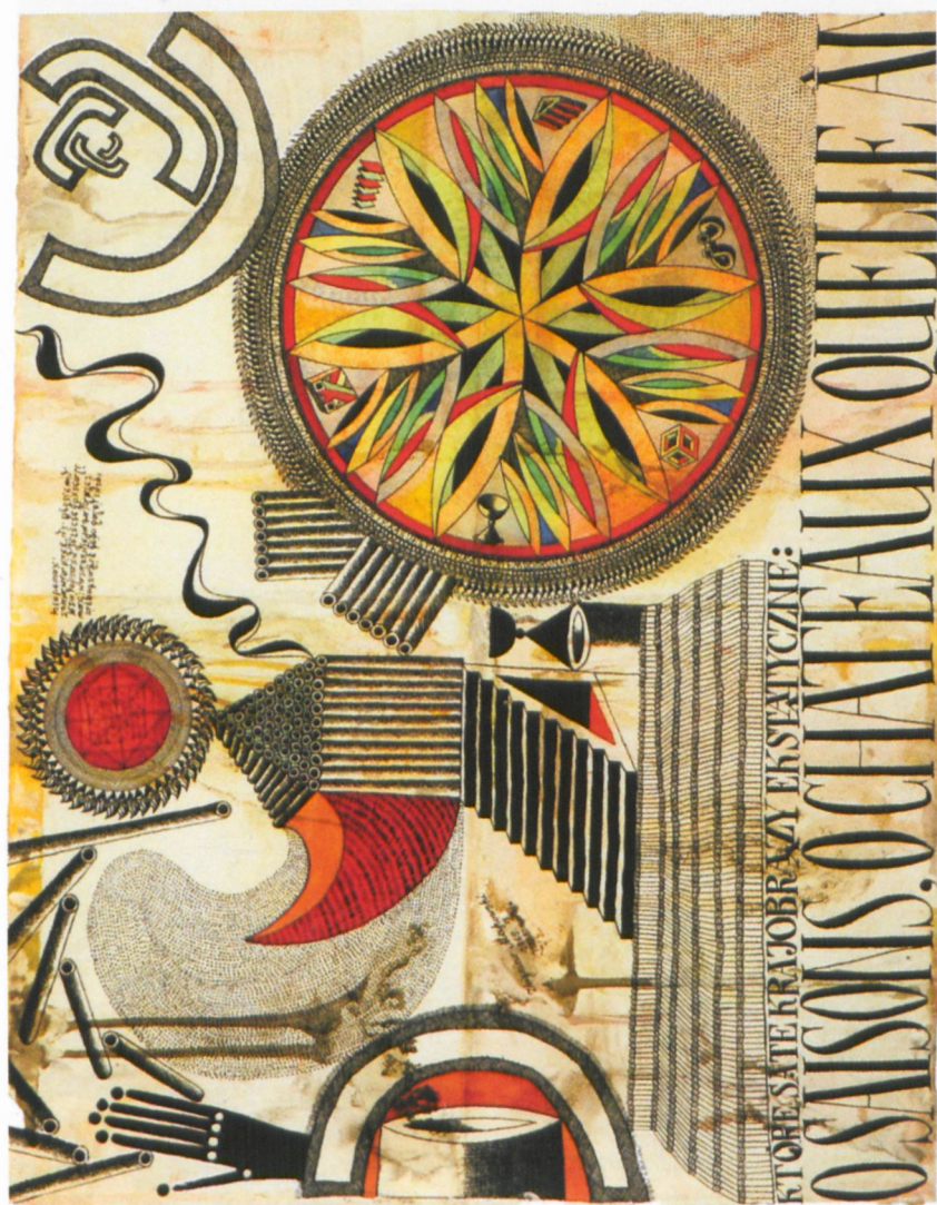
15. Zbigniew Makowski, O saisons, o chateaux , 1966, ink, paper, 45.5 × 57.5 cm. Cracow Fine Arts Academy Museum Collection M 1398