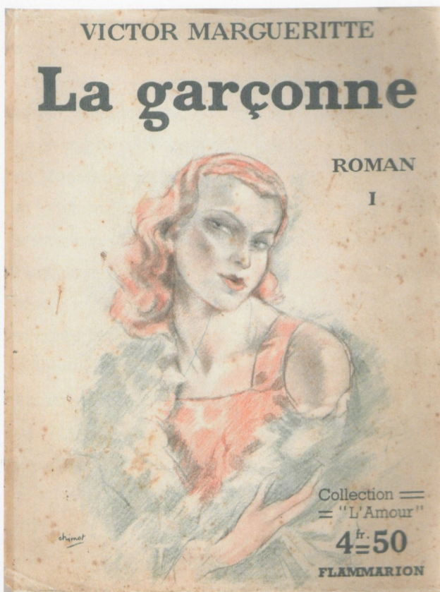
Cover of the first edition of La garçonne , published in two volumes, vol. 1, Flammarion, 1922