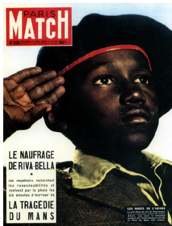
Figure 4: Cover, Paris Match , No. 326, 25th-26th June 1955 ( https://en.wikipedia.org/wiki/Mythologies_(book) ), use Rationale for Roland Barthes "Mythologies", 1957

Roland Barthes is one of the first to make a significant contribution to the study of postmodern age, 'avant la lettre'. (Cf. re. cultural studies, Grabbe, Rupert-Kruse 2009, 21-31) In his key book Mythologies from 1957, he spoke of facts, which precisely characterizes the everyday understanding of media, be it words or pictures, without us recognizing their subliminal meaning. (Cf. re. images, Jöckel 2018, 255-273) The Fruits of Karin Kneffel are a good example of this. Influenced by our everyday experiences, they too give us credible impressions of fruits that look exactly the way we think they should look, be it peaches, grapes, apples, plums or cherries. But Roland Barthes abandoned this idea by showing that what we see is never factual or neutral, but "mythologies". One of the best-known examples, with which he also presented his theoretical considerations on the subject, is the cover of the magazine Paris Match from June 1955 of a young black man in uniform saluting with a military greeting.