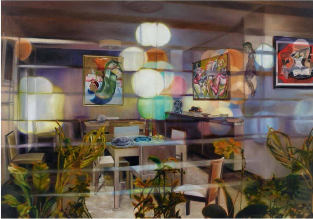
Figure 6: untitled (Haus Lange, Krefeld, dining room), 2017/5, oil on canvas, 1,80 x 2,40 m, private collection.