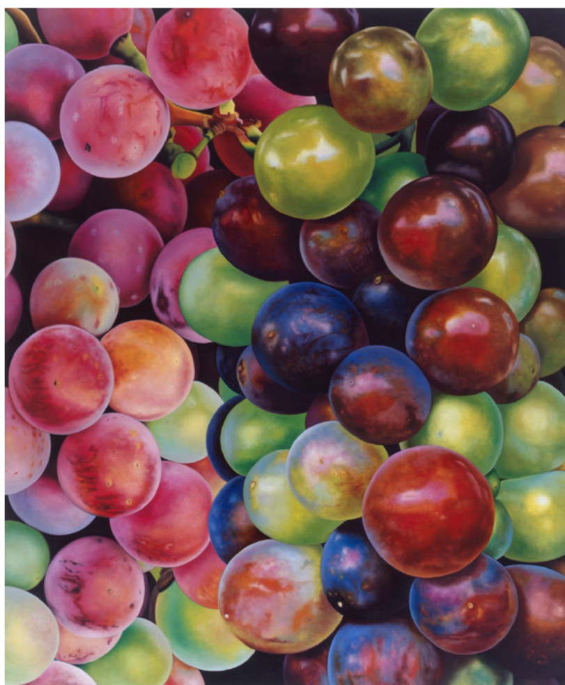
Figure 3: untitled (grapes), 2004, oil on canvas, 2,40 x 2,00 m, Museum Frieder Burda Baden-Baden