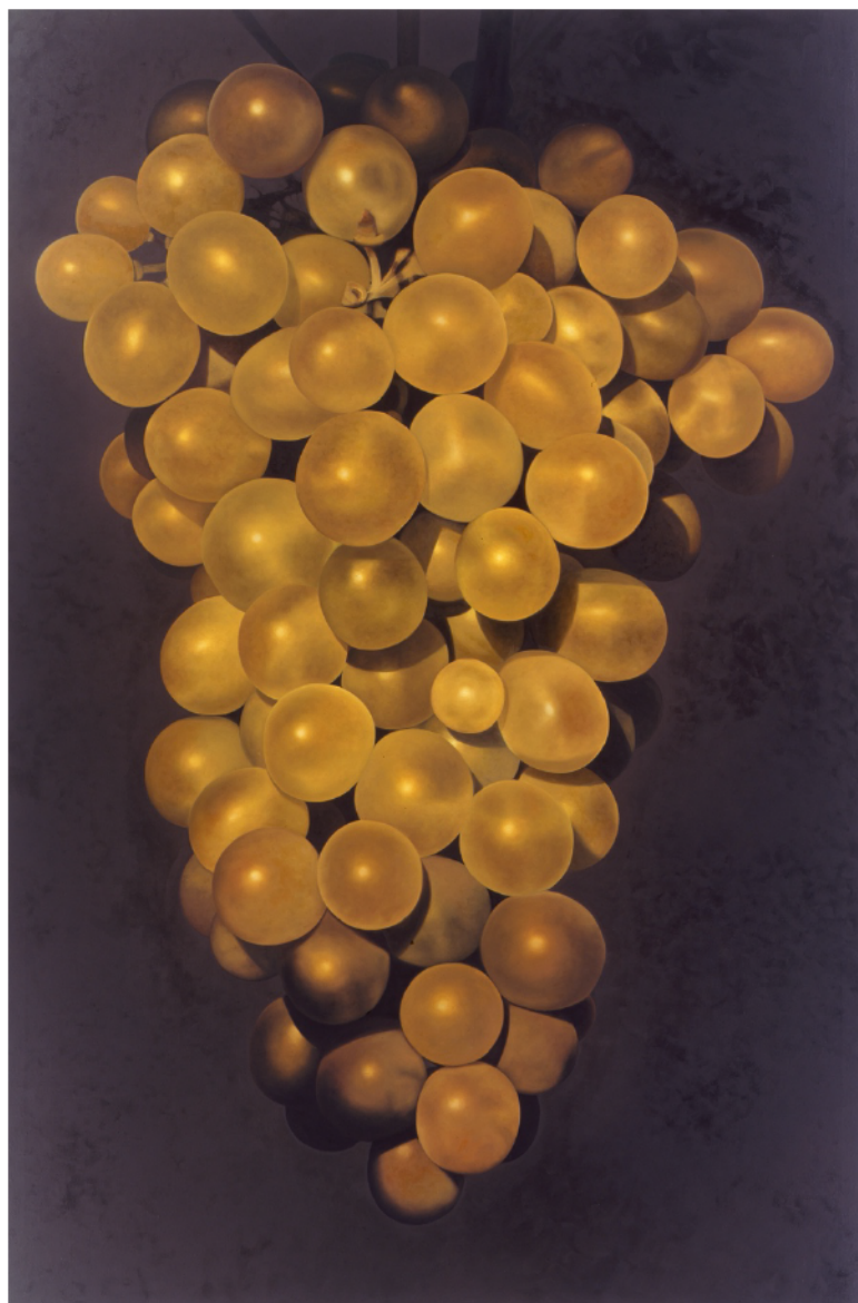
Figure 2: untitled (grapes), 1998, oil on canvas, 3,00 x 2,00 m, DZ Bank, Kunstsammlung Düsseldorf