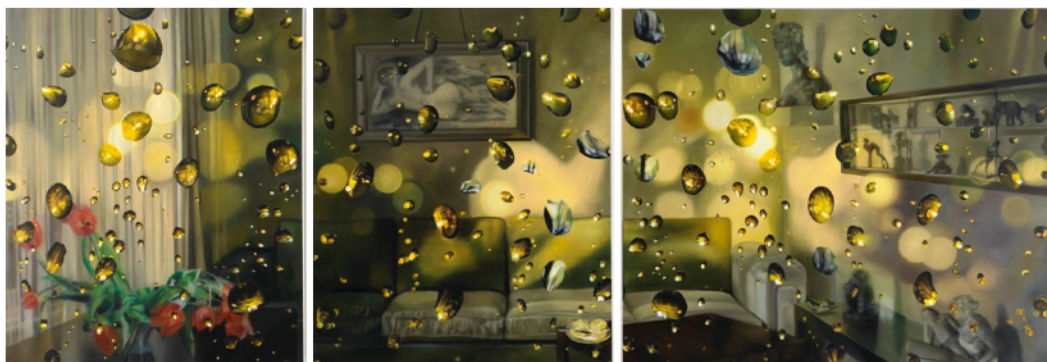
Figure 5: untitled ( Haus Lange , Krefeld, living room), 2009, four-part, oil on canvas, 1,80 x 5,20 m, Collection Heinz und Marianne Ebers-Stiftung.

Kneffel's desire to reproduce everything as plausible and ‘authentic’ as possible, as it looked, inspired her to examine, especially with regard to the latter, who owns the works today and where they hang (fig. 7). (Voss 2019, 86) In this way, she can give a faithful picture of their appearance. With regard to Kneffel's realized Interiors, they seem to fulfil this claim so authentically, which they in turn do not.