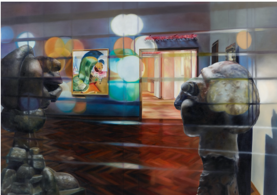
Figure 7: untitled (Marc Chagall, The Holy Coachman, 1911, Städel Museum Frankfurt a.M.), 2017/6, oil on canvas, 1,80 x 2,40 m, private collection.