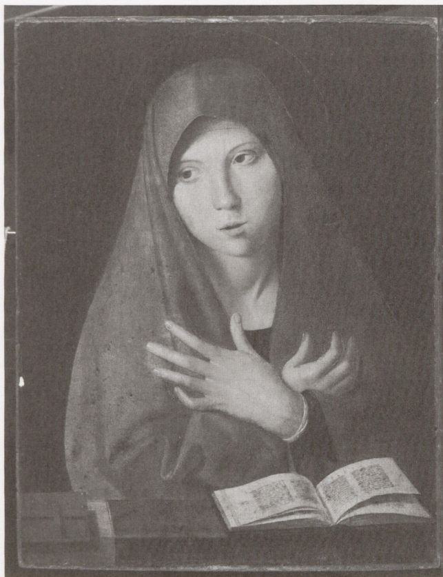
FIGURE 2.7 Antonello da Messina, Virgin Annunciate (ca. 1474). Oil on wood, 43 cm x 32 cm. Munich, Alte Pinakothek.