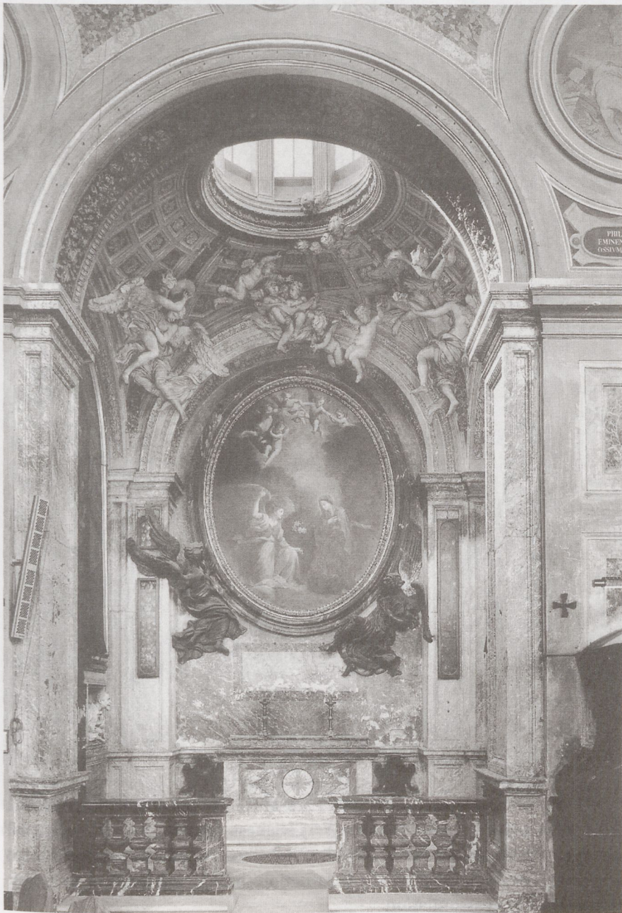
FIGURE 2.15 Gian Lorenzo Bernini, Cappella Fonseca (ca. 1663–1675), Rome, San Lorenzo in Lucina.