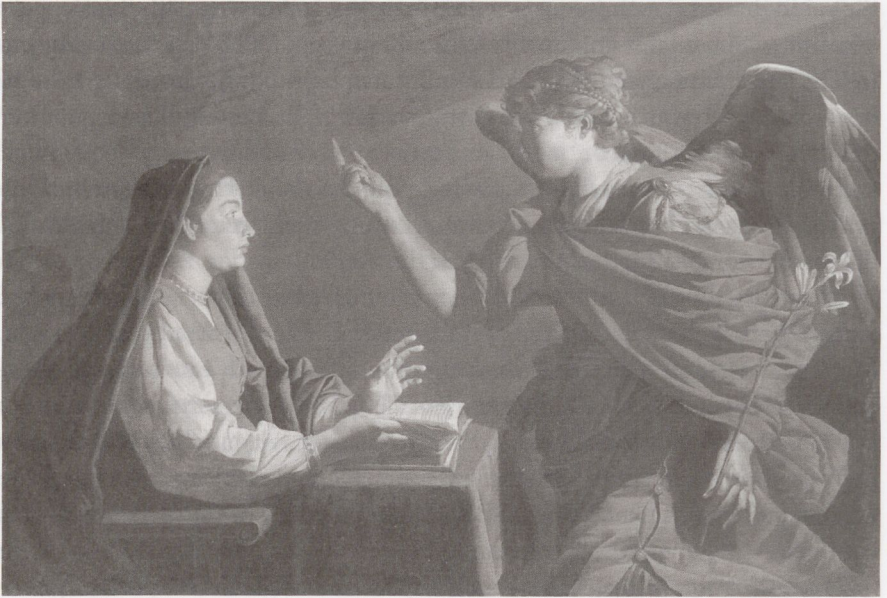
FIGURE 2.2 Matthias Stomer, Annunciation (ca. 1630–32). Oil on canvas, 117 × 171,5 cm. Vienna, Kunsthistorisches Museum.