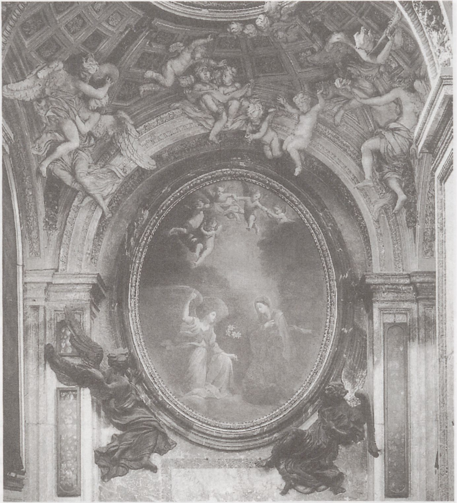
FIGURE 2.16 Gian Lorenzo Bernini, Cappella Fonseca, detail with the altar painting of the Annunciation after Guido Reni (ca. 1663–1675). Rome, San Lorenzo in Lucina.

from the imaginary presence of the ‘Very Highest Potency’ of the Holy Spirit, 41 down to the physical, earthly existence of man. The worshiper accordingly comprehends the mystery of the Incarnation through a process of participation and internal assimilation.