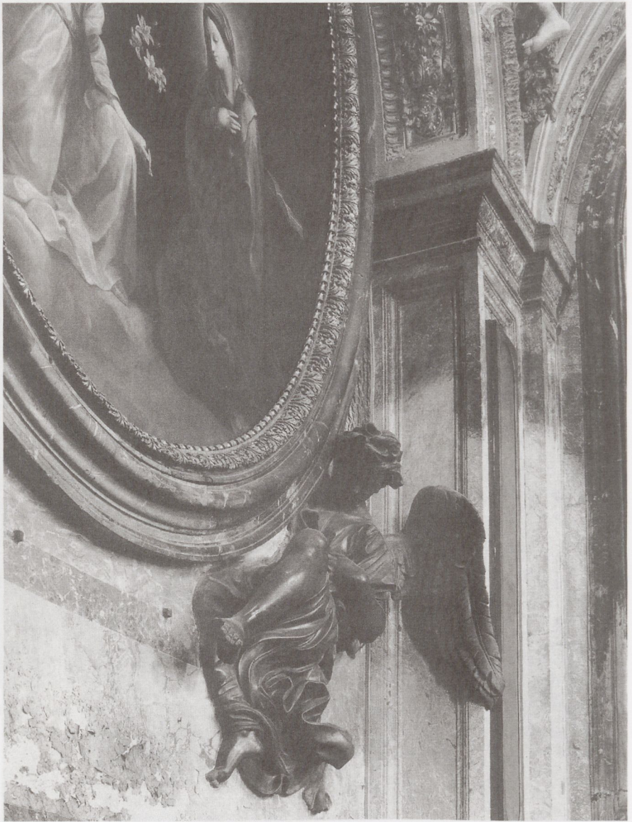
FIGURE 2.18 Gian Lorenzo Bernini, Cappella Fonseca, detail with an angel holding the altar painting of the Annunciation after Guido Reni (ca. 1663–1675). Rome, San Lorenzo in Lucina.