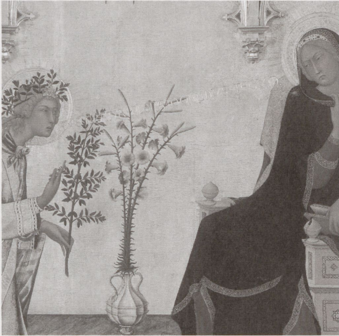
FIGURE 2.3 Simone Martini, Annunciation, detail with the Angel Gabriel saying 'Ave' (1333). Tempera and gold on wood, 184 × 210 cm. Florence, Galleria degli Uffizi.