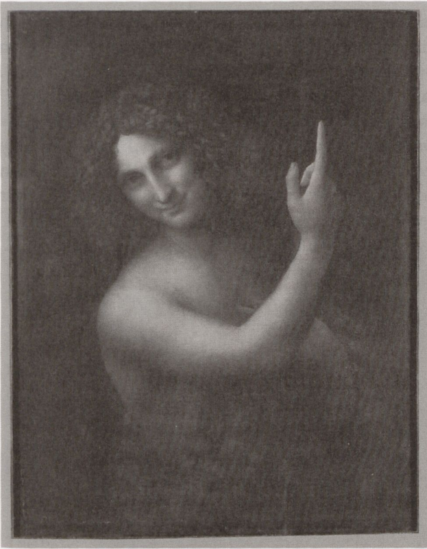
FIGURE 2.10 Leonardo da Vinci, St. John the Baptist (ca. 1513–1516). Oil on wood, 69 × 57 cm. Paris, Musée du Louvre.