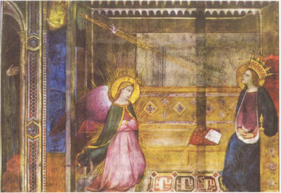
FIGURE 2.14 Unknown artist, Miraculous image of the Annunciation (14th cent.). Fresco. Florence, ss. Annunziata.