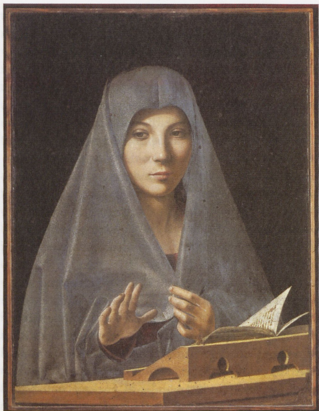
FIGURE 2.1 Antonello da Messina, Virgin Annunciate (ca. 1475–76). Oil on wood, 45 × 34.5 cm. Palermo, Galleria Regionale della Sicilia.