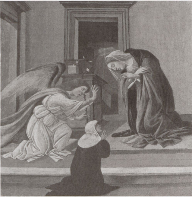
FIGURE 2.5 Sandro Botticelli (workshop), Annunciation (ca. 1495). Tempera on wood, 36,5 × 35 cm. Hannover, Niedersächsisches Landesmuseum. IMAGE © LANDESMUSEUM HANNOVER.