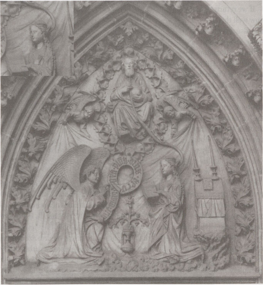
FIGURE 2.4 Unknown master, Annunciation through the Ear (ca. 1400). Stone carving. Würzburg, Chapel of Mary, northern portal.