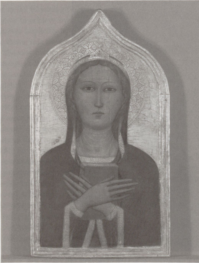
FIGURE 2.8 Niccolò di Pietro Gerini, Virgin Annunciate (ca. 1385–1390). Tempera on wood, 80 × 45 cm. Munich, Alte Pinakothek.

concentrates on the event at hand, she remains remote from the beholder. In a word: what we look at is a subtle fictionalization of the icon, creating a specific combination of proximity and distance that may be regarded as a fundamental characteristic of aesthetic illusion.