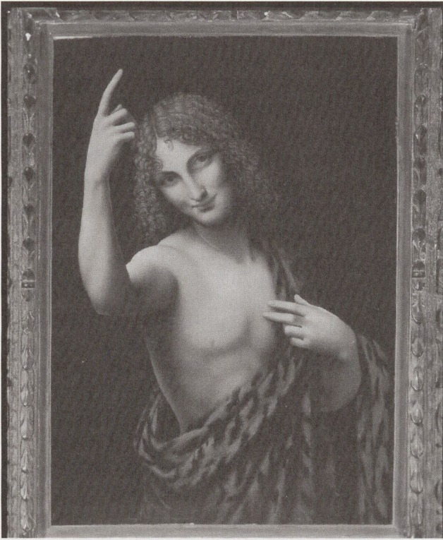
FIGURE 2.9 Unknown artist after Leonardo da Vinci, Angel of the Annunciation (ca. 1510–1520). Oil on wood, 75 × 53,4 cm. Oxford, Ashmolean Museum.