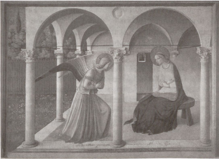
FIGURE 2.6 Fra Angelico, Annunciation (ca. 1442-43). Fresco, 230 × 321 cm. Florence, Convent of San Marco.