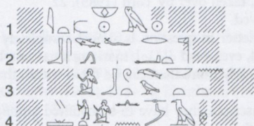
Fig. 11.1. PSI Inv. I 89, first fragment PSI Inv. I 89, second fragment, PSI Inv. I 89, third fragment P.Carlsberg 312