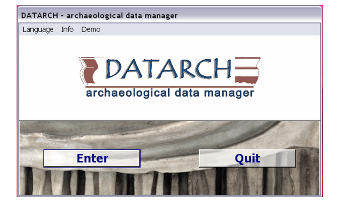
Fig. 2. DATARCH starting panel.

This feature was integrated in DATARCH by developing a tool called "Variable Transparency Image Stacker". When DATARCH is installed, it creates an folder named "IMAGES" on the user's hard disk.