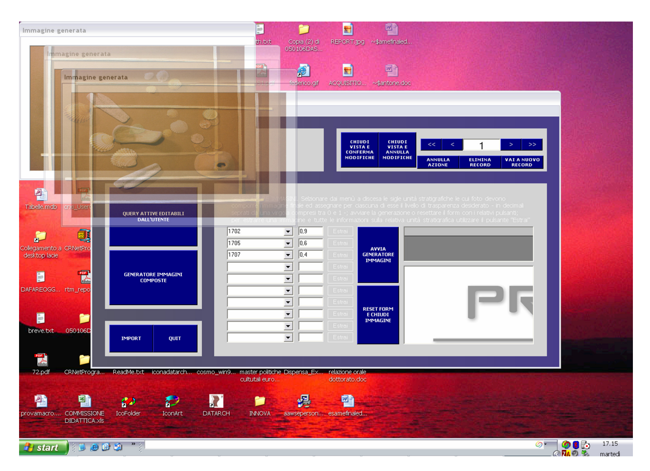
Fig. 5. The "Variable Transparency Image Stacker".