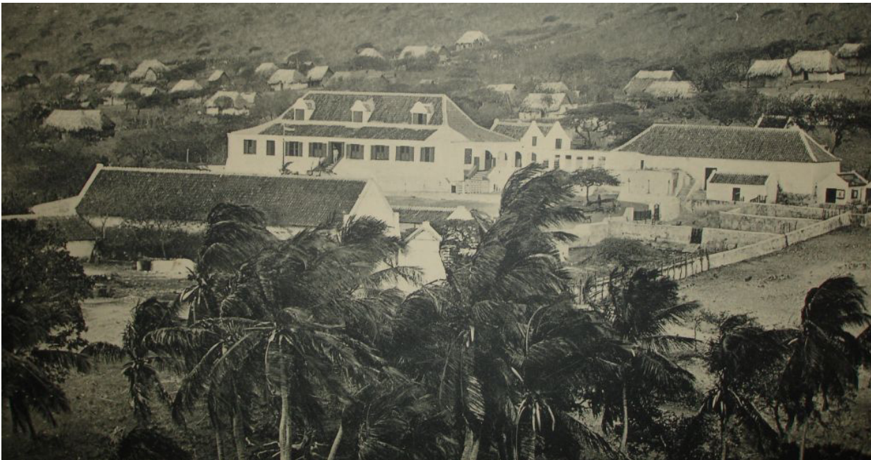
Fig. 2. Early 20 th century photograph of San Juan plantation (Schoolplate nr. 156 Plantage op Curaçao, by Kleynenberg & Co, Haarlem. Photo by author).

not been located yet. San Juan has been owned by members of one family, the Schotborghs, for more than 200 years and remains virtually unchanged by later developments. In 2006 and 2007, field surveys were conducted and many interesting features documented. The report of the research into plantation San Juan is forthcoming as a masters thesis.