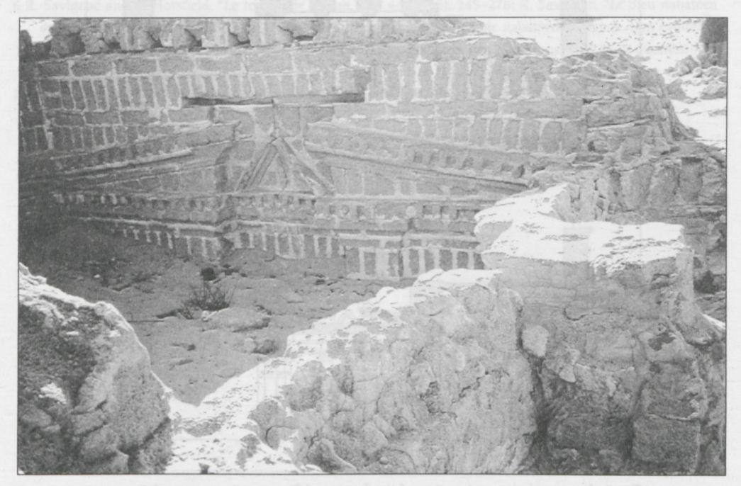
Fig. 2: A glimpse of the inner pediment.

It has recently been proposed that the square platforms of these temples might be "thrones" of Nabataean deities. In fact, such a seat (motab) is mentioned in the extant inscriptions only twice in relation to Dushara, the main god of the Nabataeans, and the meaning of the word remains far from certain. In this hypothesis, of course, the columns surrounding the platform