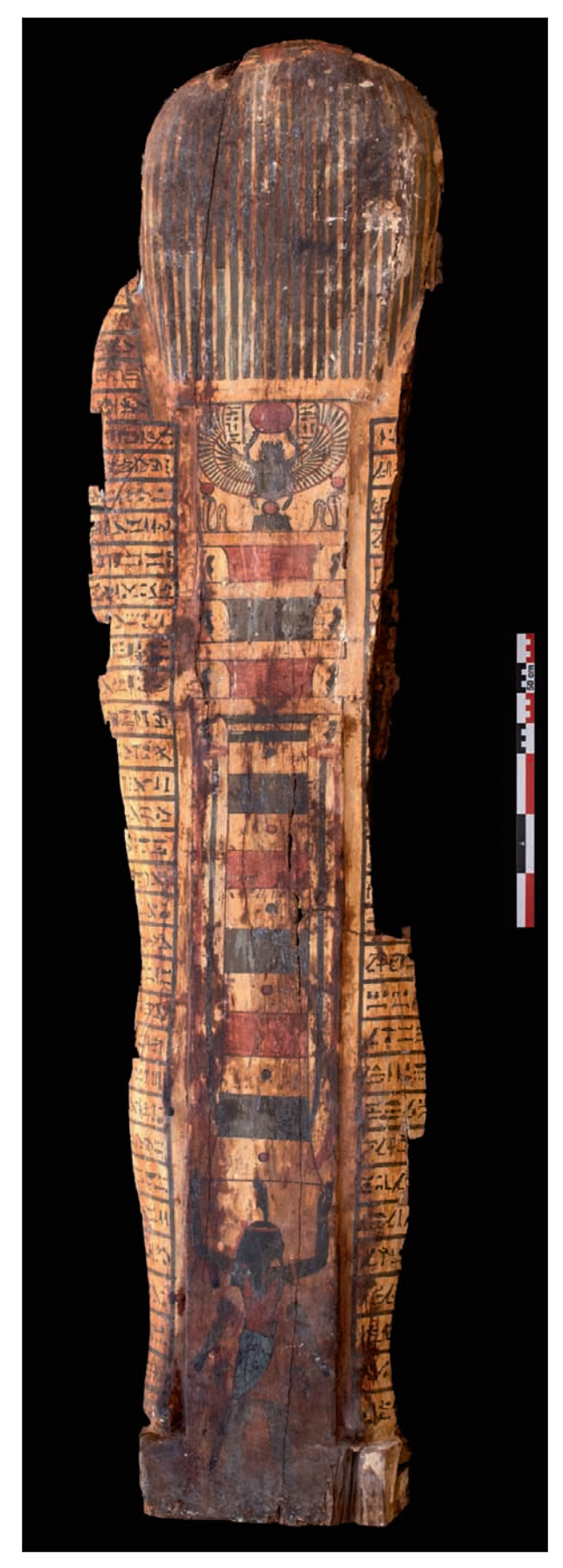
Fig. 6 Back side of anthropoid inner coffin of Iret-Hor-ru, Reg. 590.

The lower part of the associated inner coffin (Reg. 591) of Psametik-men-em-Waset II could be retrieved from shaft 10 again. The once elaborate painting on canvas in blue on white, for which numerous parallels can be found among 26<sup>th</sup> Dynasty coffins from Thebes, has suffered greatly due to the robbery and rearrangement. The back of the inner coffin falls into Design 2 after John Taylor, consisting of vertical columns and horizontal lines of texts.<sup>42</sup> All in all, the poor state of preservation of the entire coffin ensemble of Psametikmen-em-Waset II is attributable to repeated deprivation and the reuse and related construction measures.<sup>43</sup>