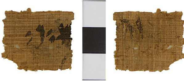
FIGURE 1 p. 23141 recto and verso (paper backing visible)

Recto [ ] :!: ⋈ ⋈° [ ] 1. [ ] ⋈ [ ] 2. Verso [ ]° 2 ⋈!/ ⋈ [ ] 1. [ ] [ ] 2.