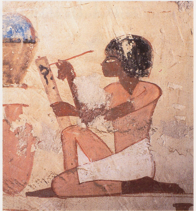
A scribe at work using a brush (Theban tomb 56).

At first sight, it might seem that our painter left his tools close to his working place: the orderly way in which he 'stored' them would indicate that he intended