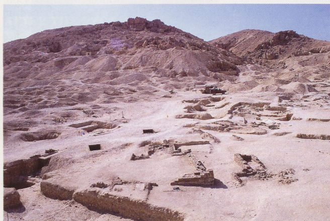
Remains of superstructures in the necropolis

The bowls date to the early New Kingdom and are rather common-ware vessels indicating that they were not manufactured especially for the purpose of being used as a painter's 'palette.' All of the bowls still contain more or less substantial amounts of colour pigments. Indeed, they represent the entire colour palette used during the New Kingdom: red, yellow, green, blue, white, and black. Most of the bowls had been used extensively and show breaks and cracks, while others are half-broken. Almost all of them were used