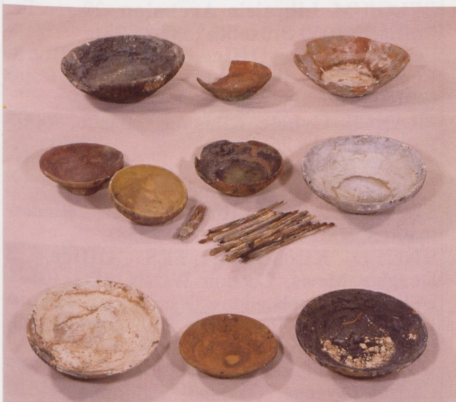
The painter's utensils.

But why would our painter take a considerable amount of effort and labour to excavate a hole in the thick layer of limestone chips, and why would he put three of the bowls upside down to cover the others? There may be another explanation. The tools were used to paint a decorated and inscribed stela, an object closely related to the funerary ceremonies as a substitute for the offerings made during the actual ceremonies. Possibly, the tools employed were regarded as sacrosanct, in the same way as the pottery vessels used during the ceremonies. This would explain why we know of several comparable finds from other tombs of the Theban necropolis. Once the tools had been used to paint a funeral-related object of a certain importance, they may have been considered sacred and were thus buried close to the tomb for which they were employed.