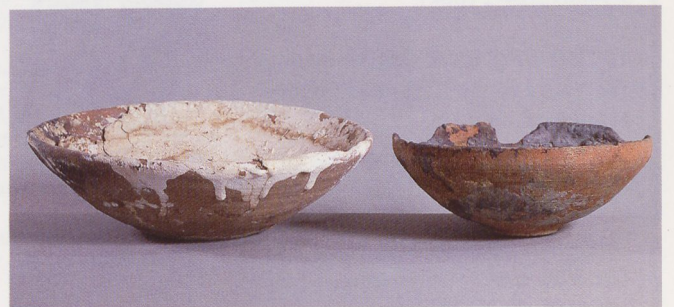
Two bowls with remains of white, blue and green pigments.