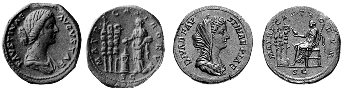
Fig. 5: Sestertii for Faustina minor, RIC 1711 and 1660.