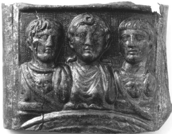
Fig. 1: Scabbard-Relief in Bonn, Landesmus., Inv. 4320.