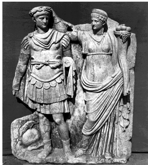
Fig. 4: Relief from Aphrodisias. After Alexandridis 2004, pl. 27, 2.

dynasty the decoration of military equipment and thus of the imagery of the soldiers' environment changes markedly: the production of glass phalerae ceases and portraits disappear from the decorations of the most military objects (Künzl 1996; Künzl 2009, 89). This seems to have affected even the standards. Solely on standards of praetorians do we