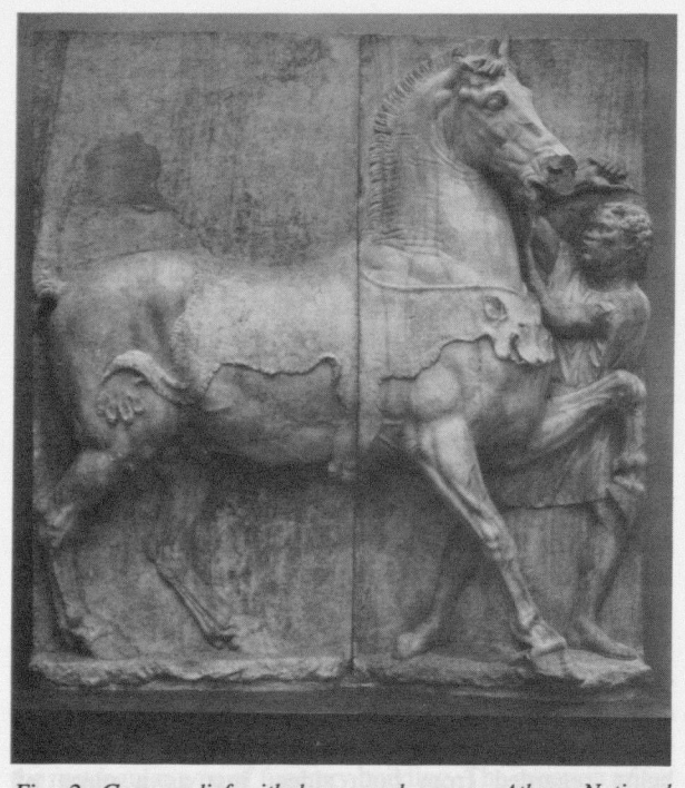
Fig. 2. Grave relief with horse and groom. Athens National Museum 4464.