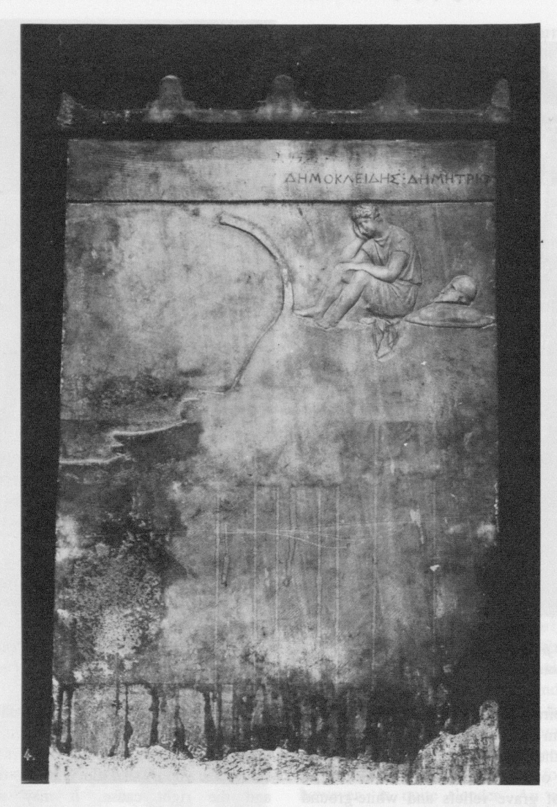
Fig. 6. Grave relief of Demokleides. Athens National Museum 752. Photo German Archaeological Institute (Athens) N.M. 404.

monuments and heroa.<sup>64</sup> As such, it may also have been depicted on the friezes of the monuments of the state burials. There is, however, no certain evidence for this. The analogy of the fighting scenes on the Nereid Monument at Xanthos<sup>65</sup> to amazonomachies does not help any more than the fighting Scythians on a monumental relief from the Taman peninsula.<sup>66</sup> But there are amazons fighting on the red-figure loutrophoros already mentioned, once in the possession of Schliemann, as well as on the main frieze of three others, one said to have been found in the Kerameikos.<sup>67</sup>