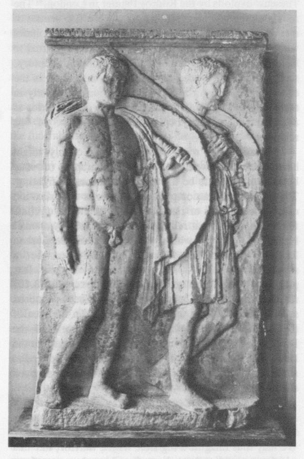
Fig. 3. Grave relief of Chairedemos and Lykeas. Piraeus Museum. Photo German Archaeological Institute (Athens) Pir. 204.

sema . The same scheme of a warrior standing quietly is used for one of the brothers on the relief of Chairedemos and Lykeas (Fig. 3), which is dated to 412/11 B.C. by mention of Lykeas in a casualty list.<sup>47</sup> Warriors standing side by side give the impression that they are part of a phalanx.