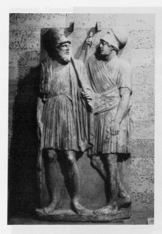
Fig. 4. Relief from the Taman Peninsula. Moscow, Pushkin Museum.

Library.<sup>57</sup> The inspiration for the sarcophagus of mourning women from Sidon may even be Attic.<sup>58</sup>