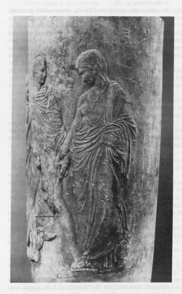
Fig. 7. Grave lekythos of Myrrhine. Athens National Museum 4485. Photo German Archaeological Institute (Athens) N.M. 5251.

immortality. Compared to his appearance on ceramic lekythoi Hermes does not occur on many tomb reliefs; examples of the latter consist of the marble lekythos of Myrrhine (Fig. 7) and a small pediment from a sepulchral naiskos of uncertain provenience in Zurich.<sup>73</sup>