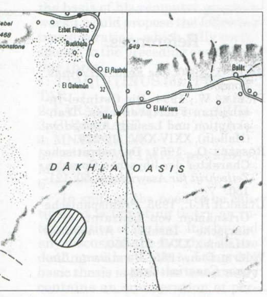
Fig. 1. Map of the area with approximate position of the inscription.