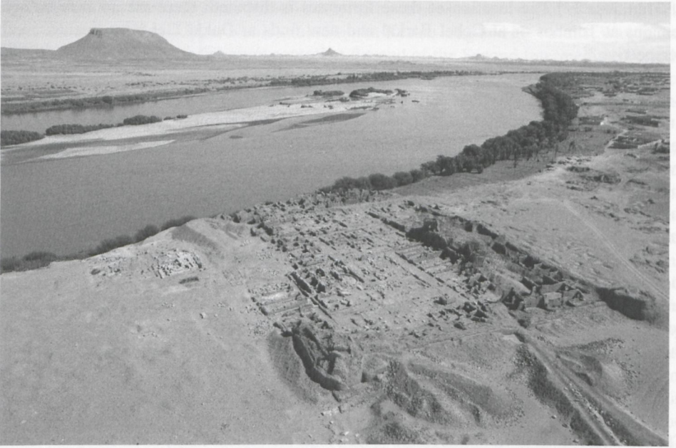
Fig. 1 View of the Southern part of Sai Island, New Kingdom town with Temple A and the Ottoman fortress, Qalat Sai (looking southeast).