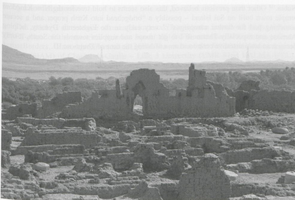
Fig. 3 Overview of Pharaonic remains in the southern part of the New Kingdom town, SAVI, with Ottoman remains in the background (looking east).

texts concerning the Kushites, but still remains elusive after all. As far as Egyptian officials and the Egyptian administration in Kush are concerned, we only encounter scattered traces before the time of Thutmose III. Viceroys of Kush are traceable in Kush proper not before the reign of this king, coinciding with the major building activities in the area regarding temple structures. To sum up, more nuances and a complex picture emerge if both archaeology and texts are considered – but also more unanswered questions come up. The case study of Sai seems to be highly significant: The changing character of this major Egyptian site from the reign of Ahmose to the time of Thutmose III seems to reflect real life changes, the details of which are still uncertain. The archaeological investigation of Sai supports the assumption that the missing evidence for an administrative system in Upper Nubia prior to the reign of Thutmose III is not accidental, but that only from the time that the Egyptian presence was firmly established and was longer-lasting, also more than scatters have survived in the record. 117 The earlier remains and traces are still not completely understood, but they seem to point rather to periodical phases of Egyptian presence and a constant power shift between Kerma Nubians and Egyptians, taking into consideration a considerable influence by the local elite and princes of Nubian chiefdoms.