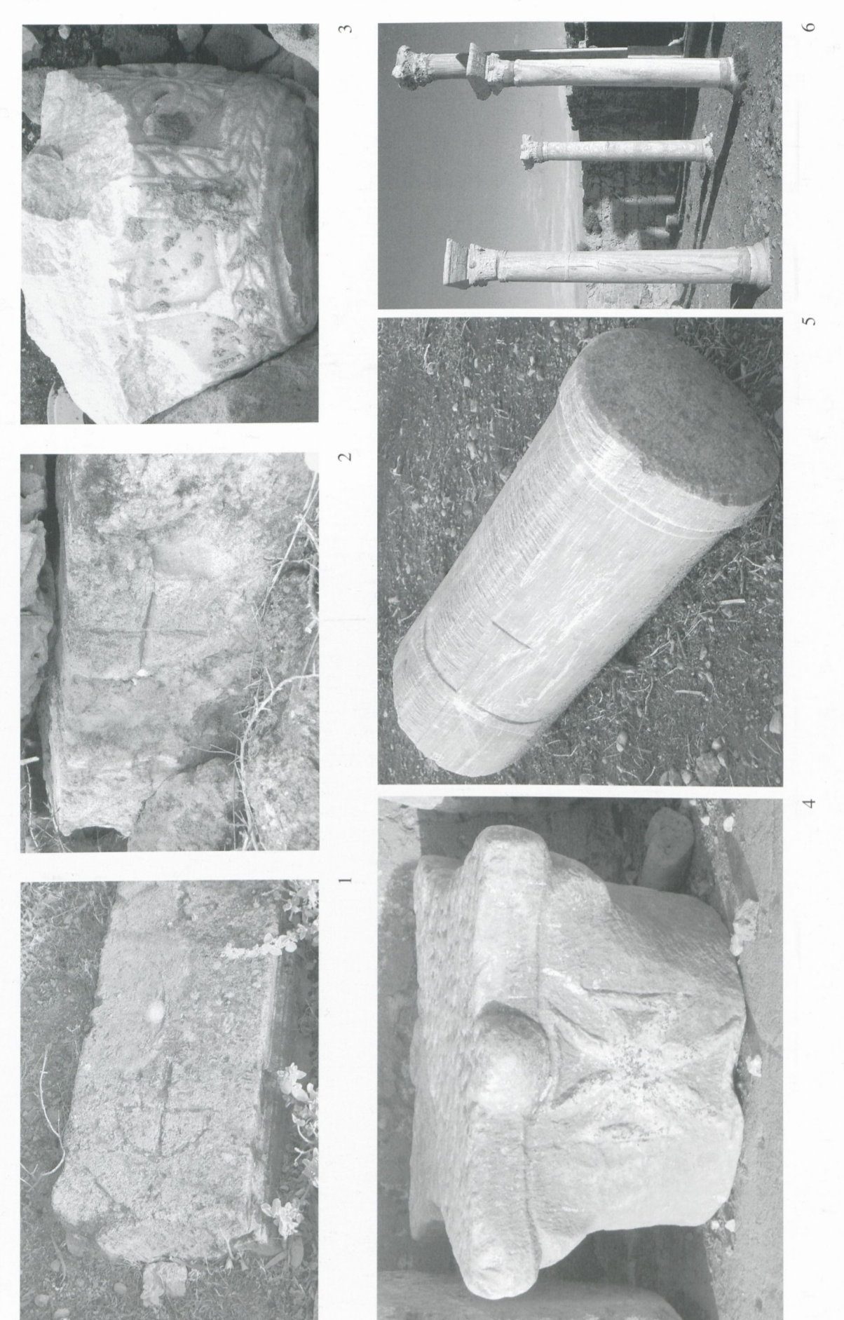
Ptolemais. I. Cross engraved on a threshold in the House of the Triapsidal Hall. – 2. Engraved cross on the east wall of the cavea of the so-called Byzantine Theater in Ptolemais. – 3. Damaged marble capitals bearing a cross motif seen in 2006 near one of the modern houses in the village of Tolmeita. – 4. Marble capital bearing a cross motif in front of one of the houses in Tolmeita. – 5. Fragment of a column shaft with cross motif found in the collection of the Archaeological Museum in Tolmeita. – 6. Columns with crosses in the Central Basilica in Apollonia.