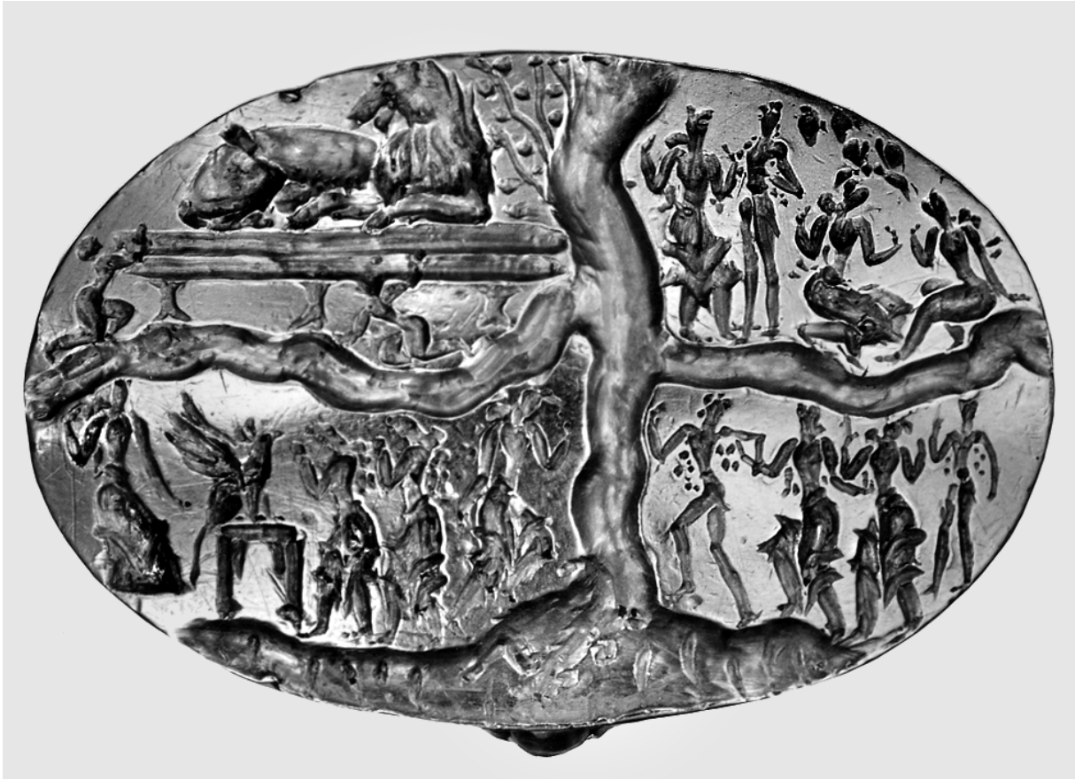
Fig. 1: The 'Ring of Nestor', CMS VI no. 277.