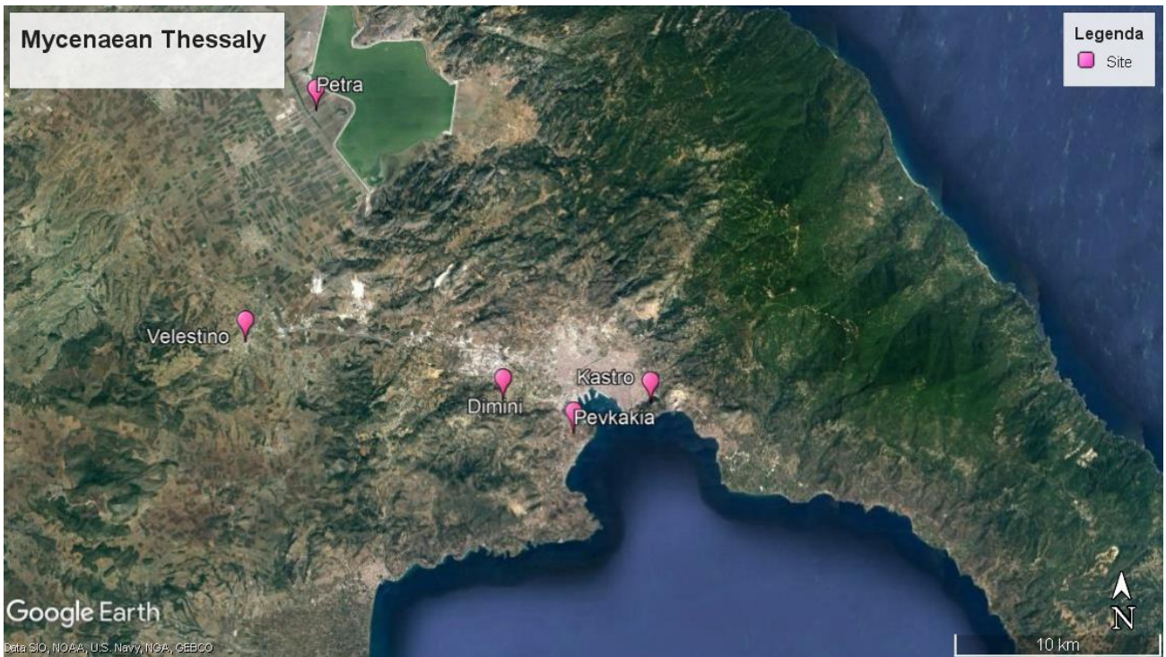
Fig. 1: Southern part of Thessaly with sites that are mentioned in the article indicated.