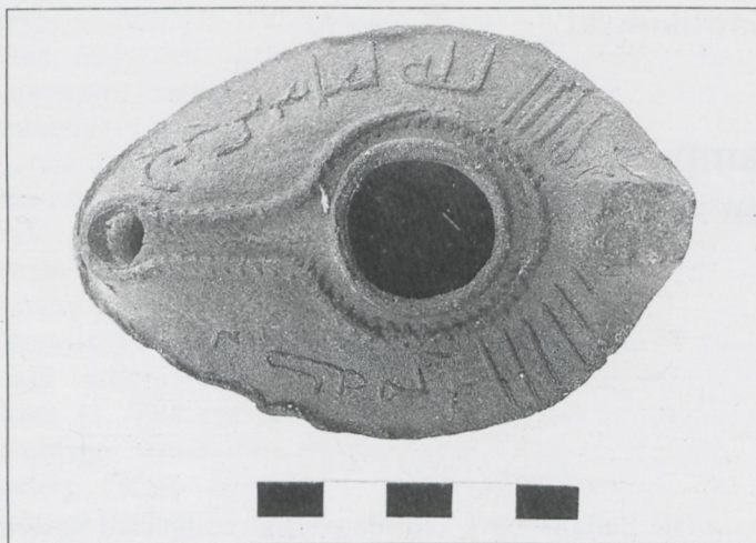
2. Lamp Pol. 41 (cf. Khairy and Amr 1986: FIG. 9).

covered in Jarash (FIGS. 2 and 3.1) (Khairy and Amr 1986: 149, FIGS. 8-9, PL. 39.9), if we adopt the reading "Ibn Khurayj", equally possible, as the letters are not dotted. In both cases, admittedly, the link is tenuous and would need some confirmation before we are able to speak of hereditary workshops.