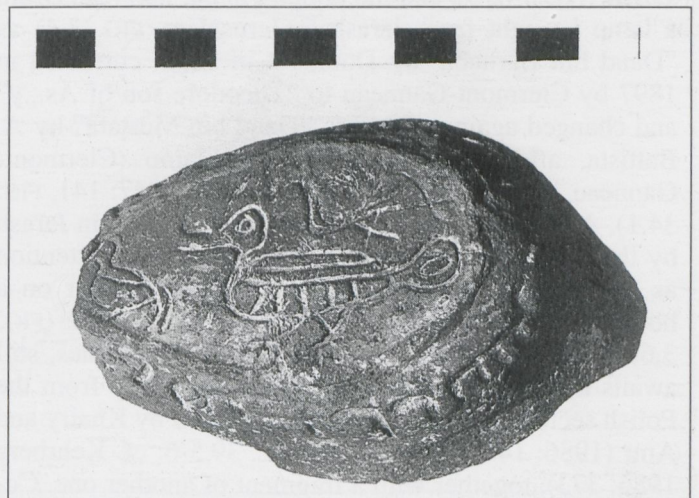
1. Lamp Pol. 211 (cf. Ronzevalle 1914; Khairy and Amr 1986: FIG. 4).

In the same way, the potter whose name is given as Ibn Ḥudaij (Amr 1986: 163, FIGS. 1-2) could be identical with 'Amr bin Kharaj mentioned on three lamps dis-