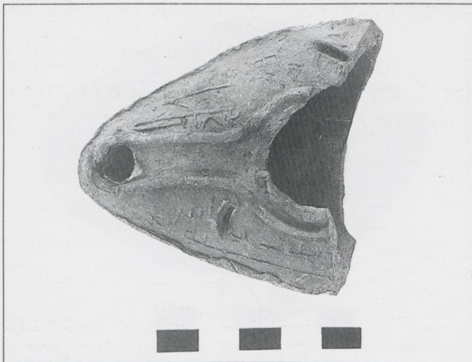
4. Lamp Pol. 159 (cf. Khairy and Amr 1986: FIG. 6).

Șamid can be dated in 111 H (AD 729/30), as it was indeed dated by A. Battista already in 1947 after a copy in the Palestine Archaeological Museum (Bagatti 1947: 141).