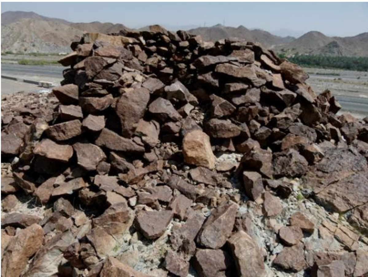
Fig. 14. Cylinder tomb at al-Multaqa, al-Dakhiliyya.

Bulldozing has completely destroyed graves in the plain just west of the mountain. In the site to the north small finds were recovered and turned over to the MHT: painted EIA fine ware, other potsherds, 10 beads in total of different material (DA 52662), shells, one copper clamps (DA 52661), fragments of glass with different colours, a fragment of a soft-stone vessel and finally an intact seal in steatite (DA 52660).