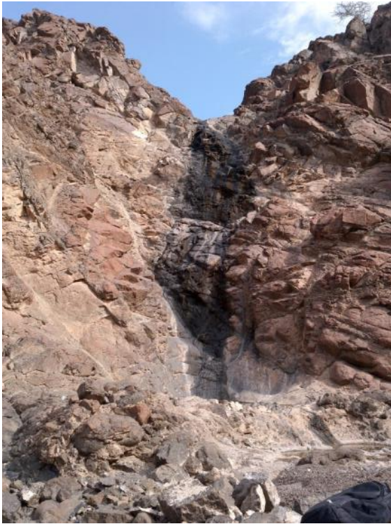
Fig. 7. Waterfall at the al-Salayli site, al-Sharqiya north September 2021.