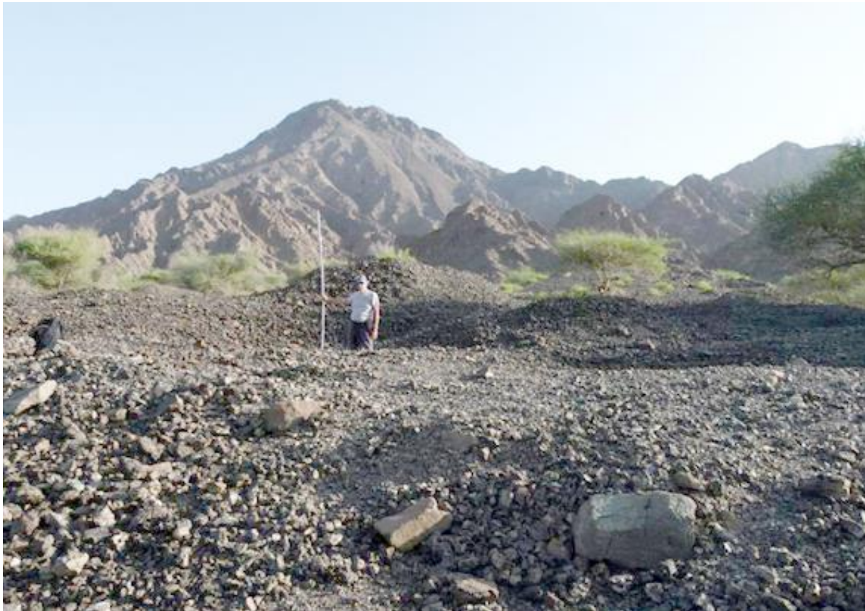
Fig. 10. The al-Salayli slag fields seem mostly of early and also perhaps middle Islamic date and in places measure more than 1.3 m in depth. The scale in the photo is 3m in length.

possibly in the middle Islamic period. Late Islamic occupation is suggested by slag recycling, but no mining. EIA mining is suggested by copper slag found in the walls of 6 tombs in al-Salayli site 1. Water resources are greater than previously known. Two streams were flowing even during the summer heat. EIA settlement is best known north of the al-Salayli valley. Better preserved slag fragments show typical early Islamic form and size: A fragment of a furnace slag with the bottom smooth surface being the interface between the slag and matte or indeed copper metal which was separated and processed elsewhere on the site (pers. comm. J. Lehner). The projected diameter of the furnace slag gives a rough impression of the furnace size.