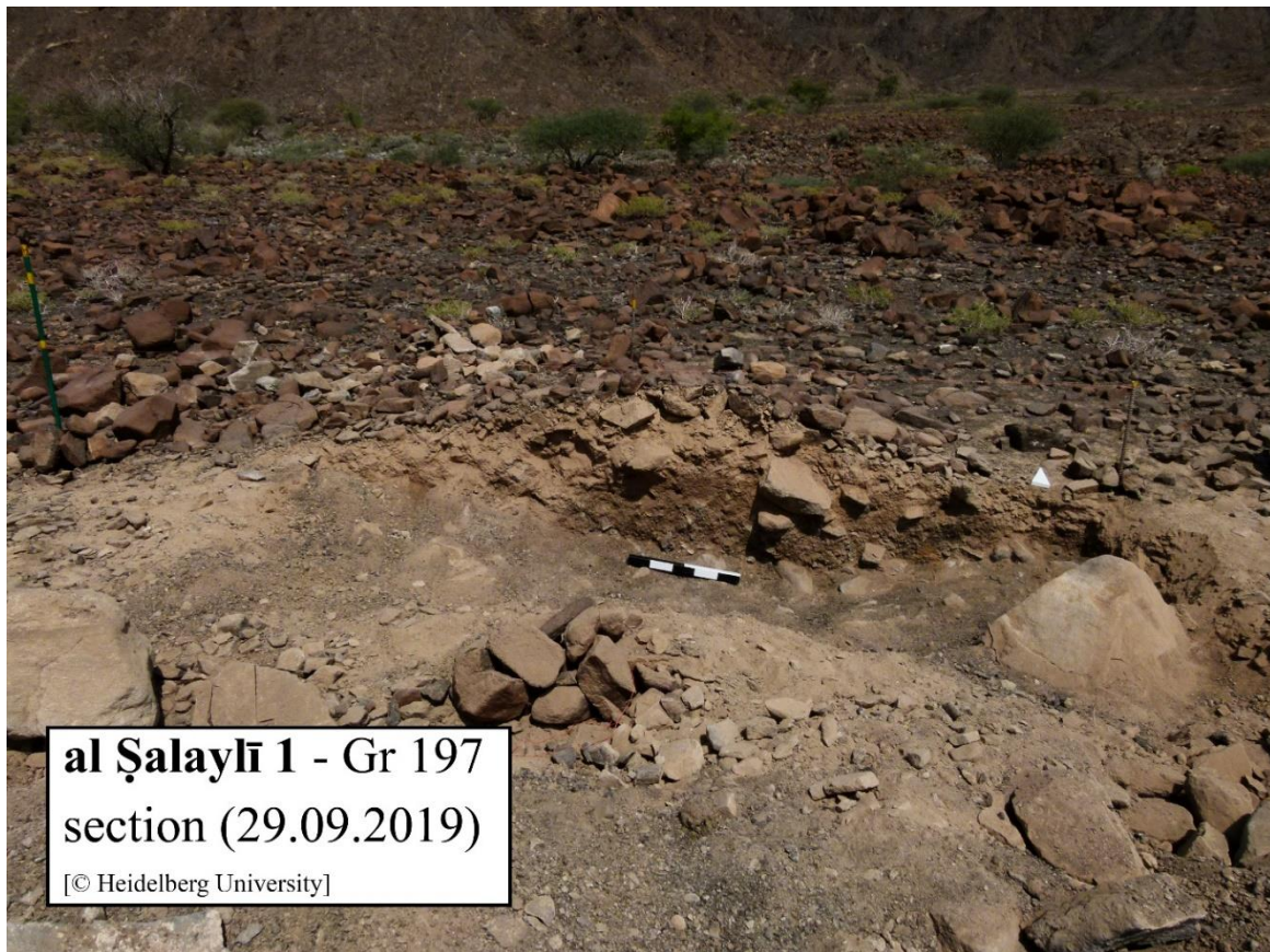
Fig 11. Al-Salayli, al-Sharqiyya north, suspected grave / feature 197.