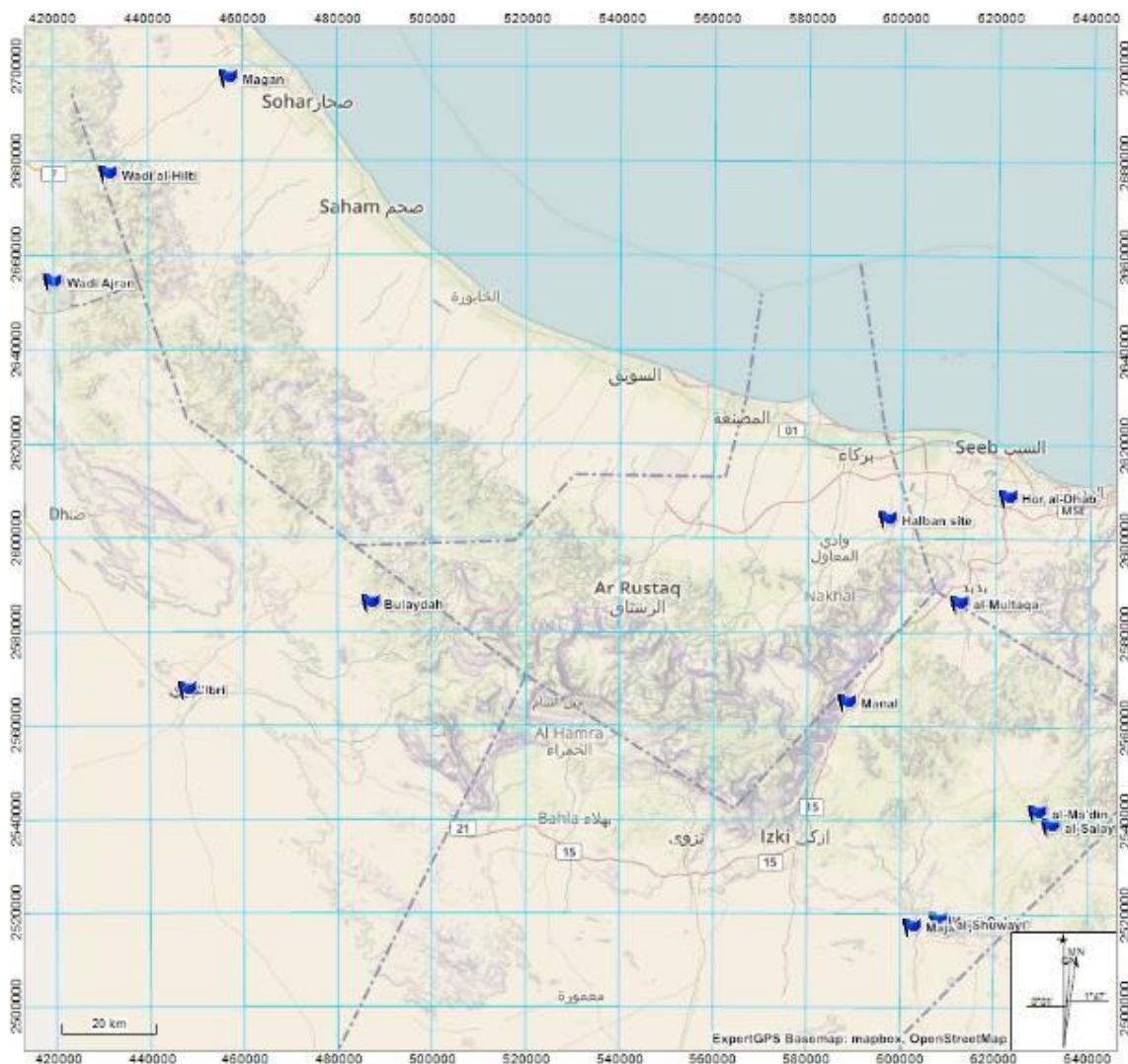
Fig. 18. Sites surveyed 10 September – 15 October 2021 by the Heidelberg team. Governorate borders are obsolete.

The diachronic study of copper production at Bilad al-Ma'din promises to show prehistoric smelting developments between the Umm an-Nar, EIA and Islamic periods. GPS mapping provided good evidence for the project in number and lay of different kinds of EIA tombs – sites often not or only cursorily described. Al-Khawdh and al-Salayli show very similar EIA tomb architecture. Curiously, at al-Salayli the large funerary 'cylinder tombs' are absent.