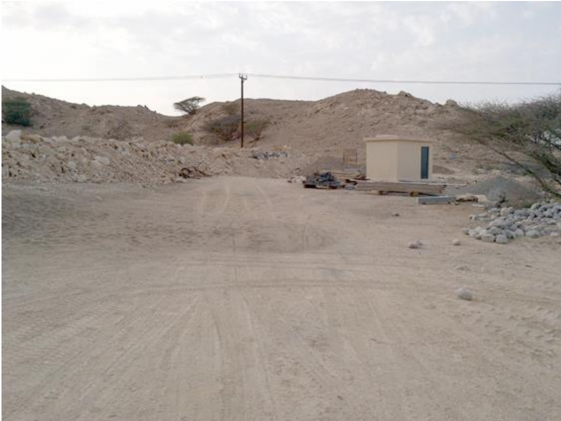
Fig. 3. Bulldozing the east of the EIA archaeological site al-Khawdh, Hor al-Dhab', Muscat governorate 10.09.2021.