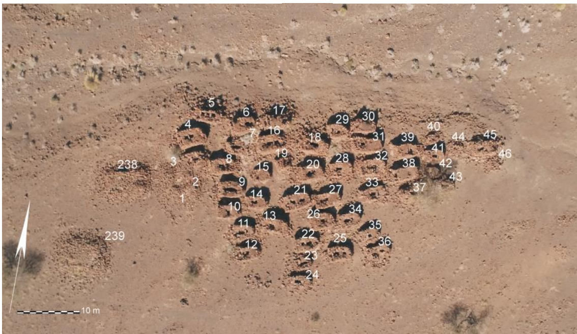
Fig 9. Al-Salayli site 1, al-Sharqiya north. One of Oman's best EIA hut tomb sites.

Al-Salayli. Our main task this season was to document the 245 EIA hut tombs at this site. We described, inventoried and photographed these tombs. In addition, we attempted to document the copper slag and determine its volume and date. The dating of the slag at al-Salayli forms a matter for discussion (Fig. 10). Presumably it includes early, middle and late Islamic production. Early Islamic slag is clearly identifiable, but the main period of mining