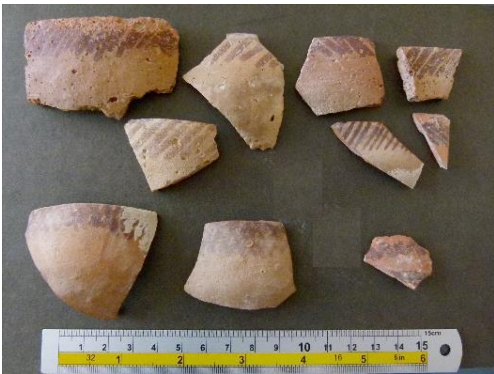
Fig. 16. EIA potsherds, collected in the area of the graves, northern al-Multaqa, al-Dakhiliyya.