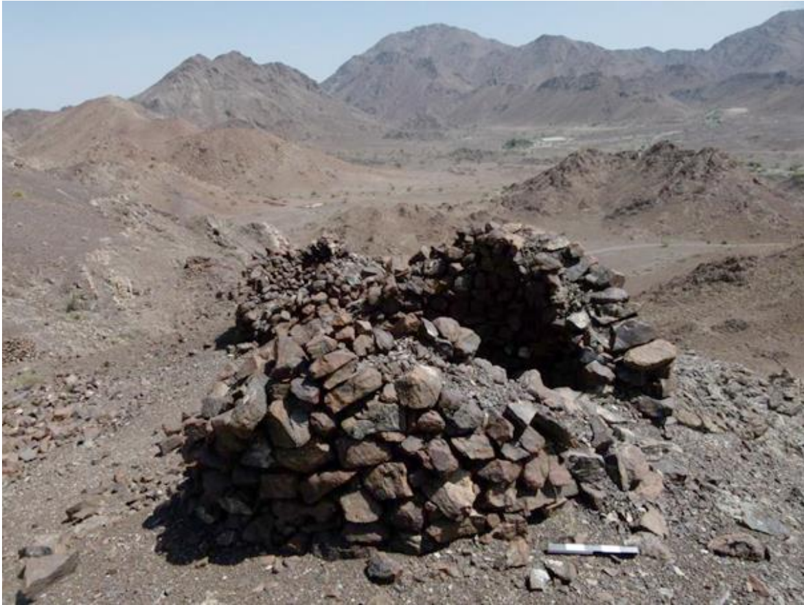
Fig. 13. Cylinder tomb A1 at Bilad al-Ma'din, al-Sharqiyya north.

Wadi Sa'. This site has been recorded as consisting of 3 copper-producing areas with ancient tombs. Sites I and II contained few or no anthropogenic structures except for a copper mine. Only site "III", extending over several hundred m 2 revealed Islamic copper slag and buildings.