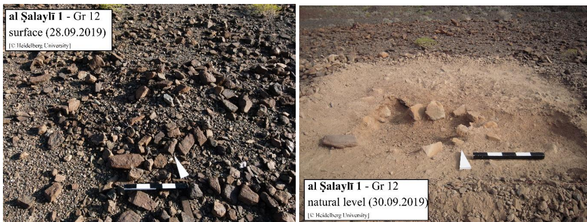
Fig 12a, b. Al-Salayli, al-Sharqiyya north, suspected grave / feature 12.

Bilad al-Ma'din. Survey at Bilad al-Ma'din (6 km east of al-Salayli) revealed a large number of hut and cylinder tombs. EIA copper slag could be dated by pottery, but the majority appears to be of Islamic date.