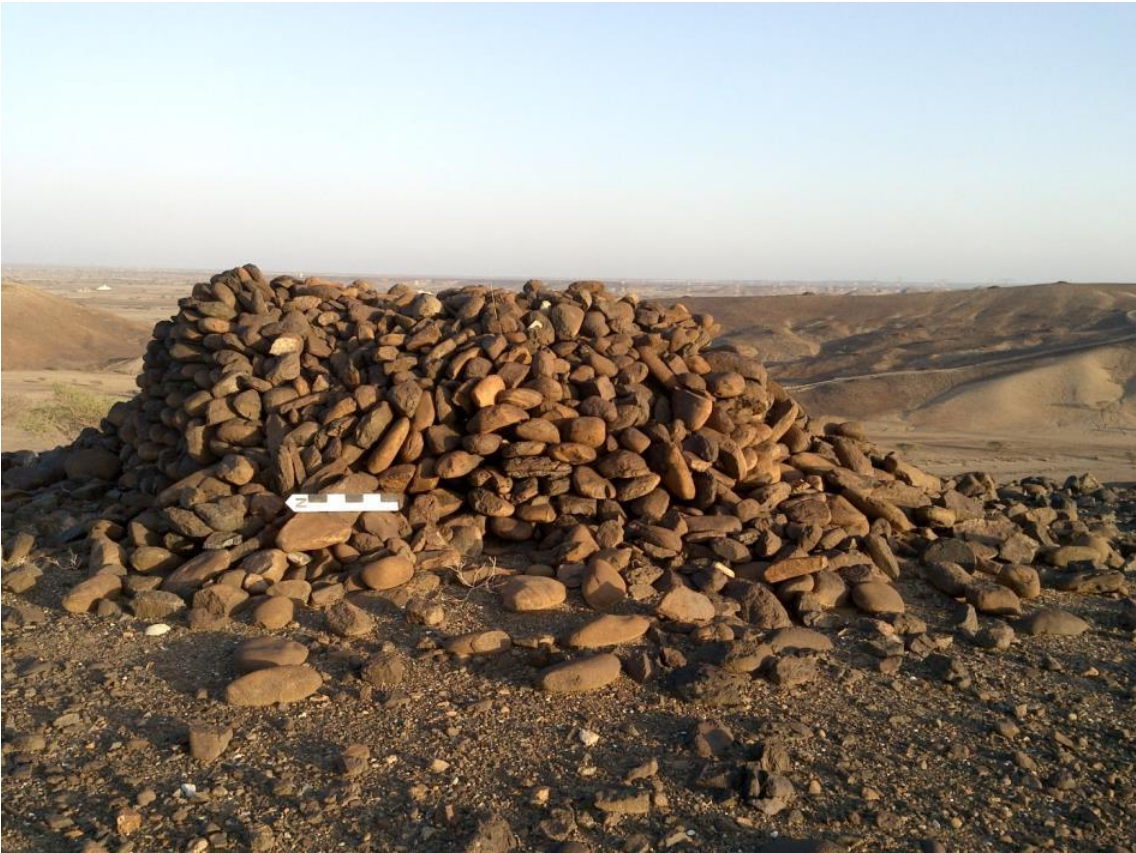
Fig. 6. Wadi Hilti, al-Batina, hut tomb. Such have an entrance construction above.

on the western slope of the hill inspected during the one day of mapping. The tombs show different construction technique and mainly different shapes.