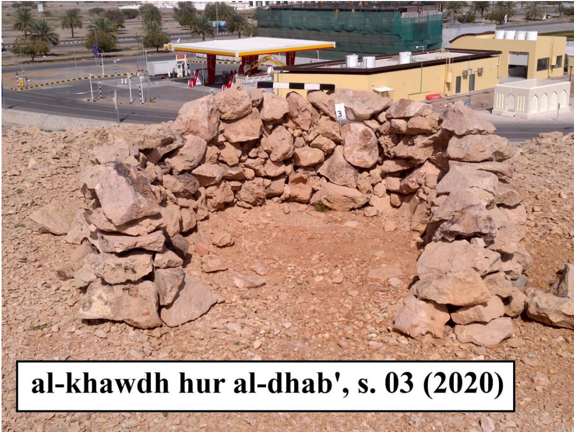
Fig. 1. Sangar no. 3, photographed in January 2020, al-Khawdh, Hor al-Dhab', Muscat governorate.