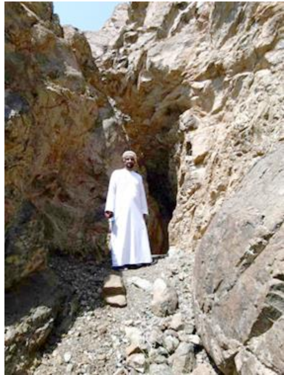
Fig. 8. Collapsed Middle Islamic mine gallery, al-Salayli al-Sharqiya north.