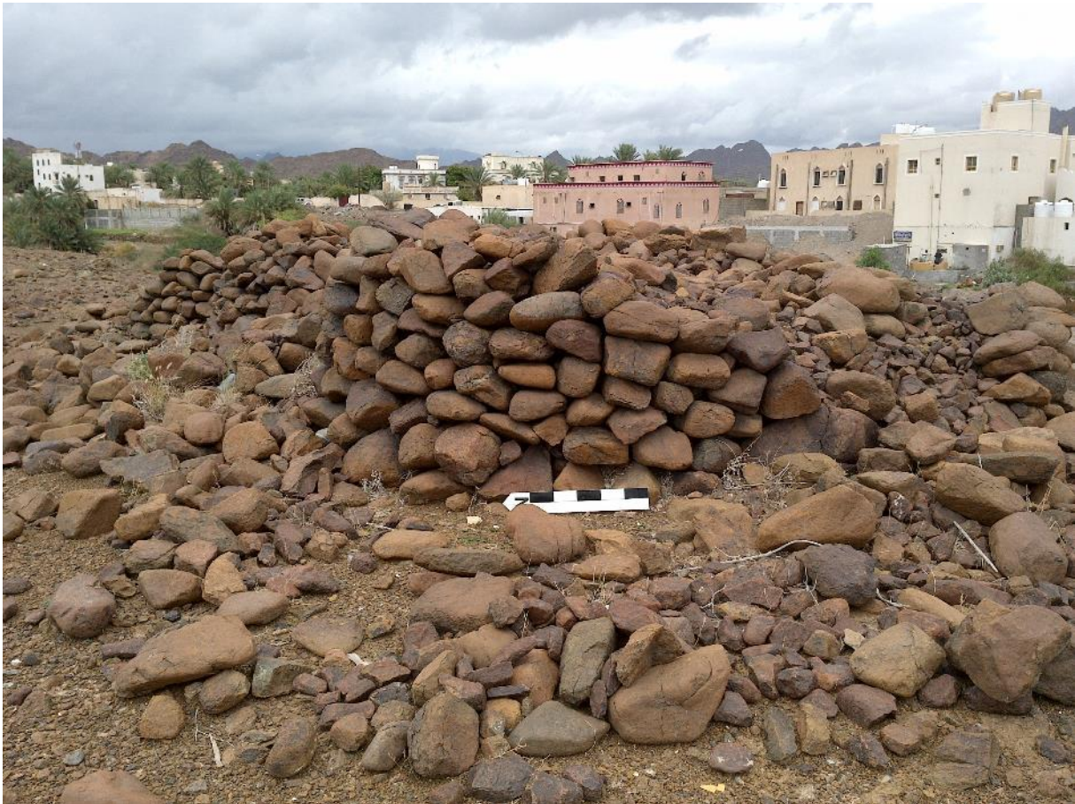
Fig. 17. Hut tomb in Bulaydah, Wadi Magniyat, al-Zahira.

Wadi Magniyat, Bulaydha, Moqenyat? 43 hut tombs spread along the northern wadi edge in a E-W direction. There is no ministry sign. Tomb preservation is heterogeneous. Tombs clustered up to 8 or even 15 together. Entrances are difficult to determine and heterogeneous in orientation. Preserved up to 1.70 m in height. No tomb roofs pres. Oval-circular plans – not horseshoe. The best-preserved ones identify other poorly preserved ones. Most of the tombs have been bulldozed. No clear, unified tomb orientations. Best preserved tomb plan is oval, entrance possibly in the north-east. All EIA. Well-preserved examples date the others.