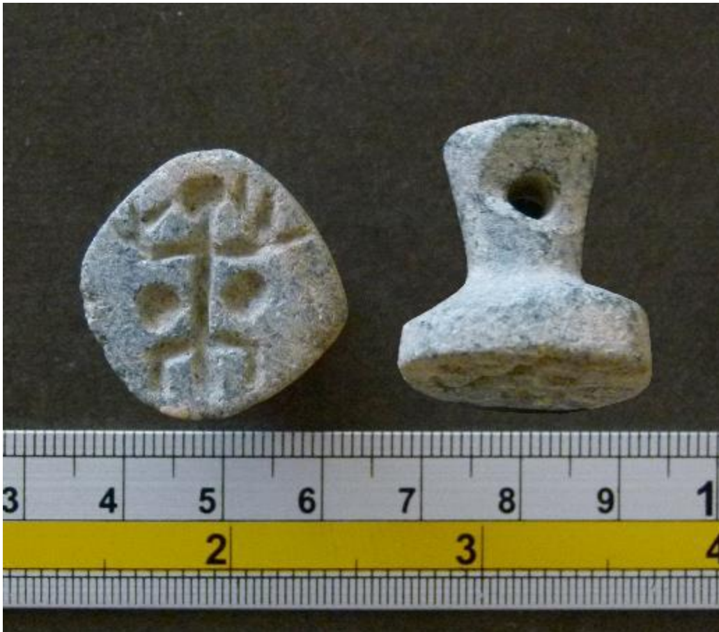
Fig. 15. Soft stone seal DA 52660, collected from EIA disturbed graves, northern al-Multaqa, al-Dakhiliyya.