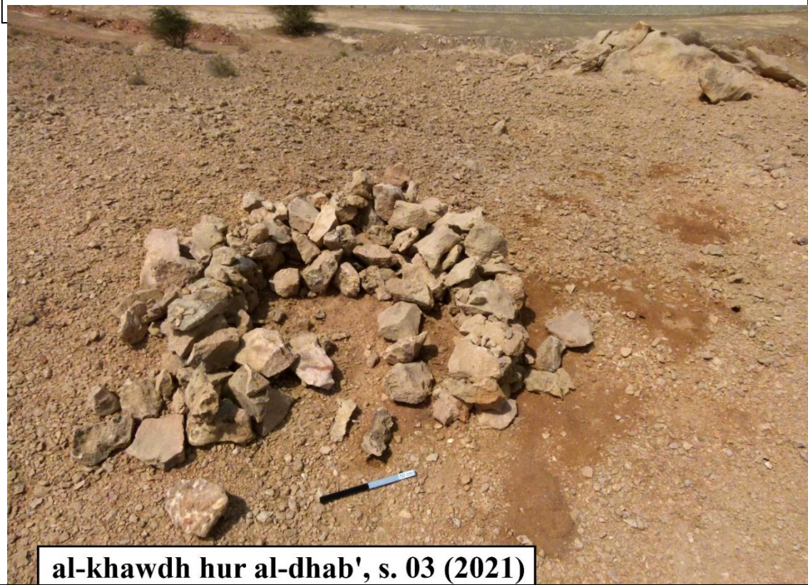
Fig. 2. Sangar no. 3, photographed in September 2021, showing that the uppermost stones recently were quarried, al-Khawdh, Hor al-Dhab', Muscat governorate.