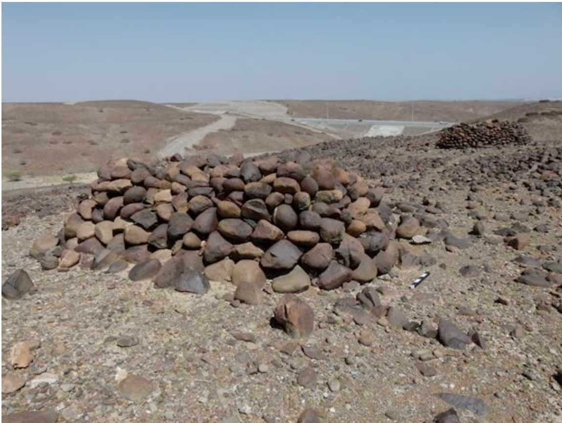
Fig. 5. Hut tomb in a good state of preservation, Wadi al-Arad site, al-Batina, selected for 3D rendering.

Magan cemeteries. The hills at this industrial complex contain numerous single and clustered EIA hut tombs with long plans. Tomb entrance structures were rarely ascertainable. Tops of hills are being bulldozed of their prehistoric remains for building purposes.