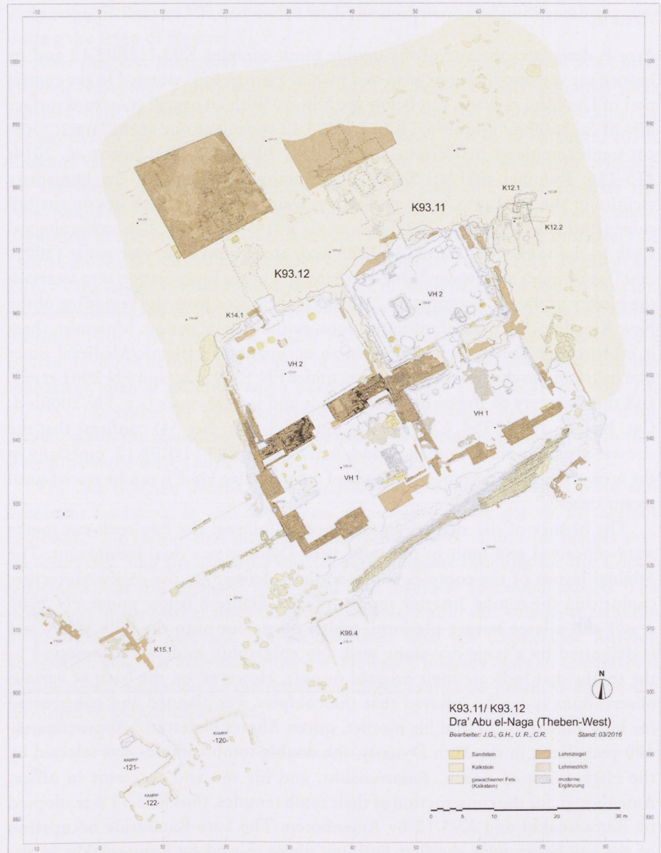
Figure 3. Plan of Area E, tomb complex K93.11/K93.12 and surroundings. Surveyed and drawn by G. Heindl, J. Goischke and C. Ruppert.

the buildings, even though they can no longer be attested archaeologically due to their temporary character. With this in mind, the outward appearance of the necropolis during the peak of its activity was probably not unlike medieval and modern Egyptian Muslim cemeteries with free-standing tomb buildings. 3