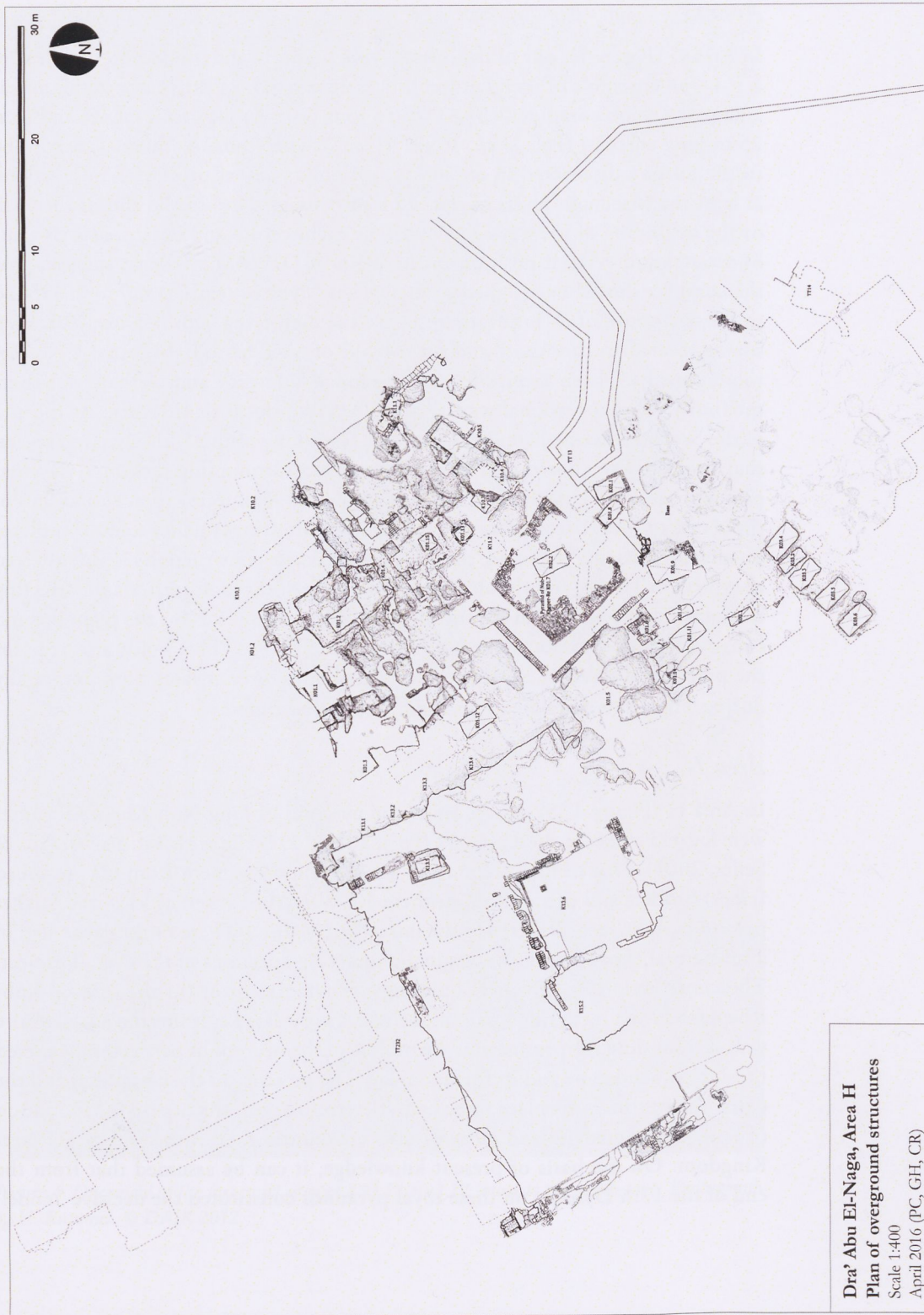
Dra' Abu El-Naga, Area H Plan of overground structures Scale 1:400 April 2016 (PC, GH, CR)