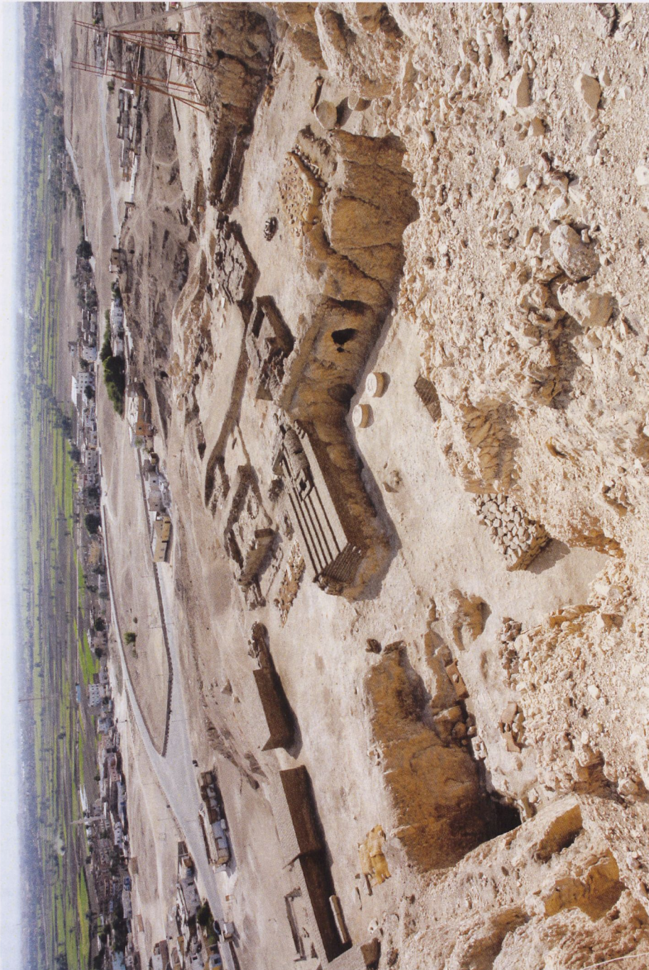
Figure 4. Overview of the forecourt area of K93.11/K93.12 towards the south-east.