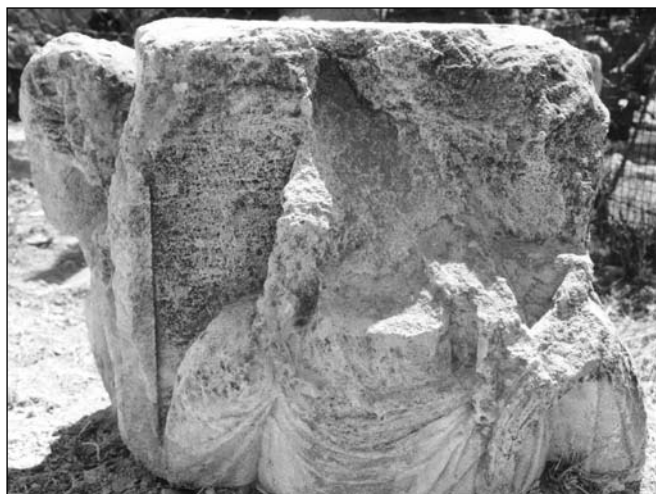
7. Panel from the frieze, but at lateral side, Bust of a Tyche figure. ‘Ammān, Jordan Archaeological Museum.

panels with Zeus and Hera, the temple deities.