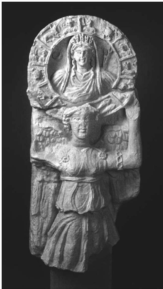
1. Completed relief of Nike with Zodiac. ‘Ammān, Jordan Archaeological Museum and Cincinnati Art Museum. Markoe 2003: fig. 199, Courtesy the Cincinnati Art Museum.

of the sanctuary or a little bit later for stylistic reasons, but whose original place in the sanctuary is unknown. The zodiac roundel with a bust of a female deity in its middle is carried by a Nike (FIG. 1). In comparison with other zodiacs (cf. Gundel 1992) the arrangement of the signs at the at-Tannūr zodiac differs from the usual sequence. It starts at the top with the bust of Aries, runs down to Virgo in the left half, then turns back to the top to Libra and runs down to Pisces in the right half (FIG. 2). To explain this peculiarity the two halves have been interpreted as the civil year beginning with the month Nisan on the left and the normal year