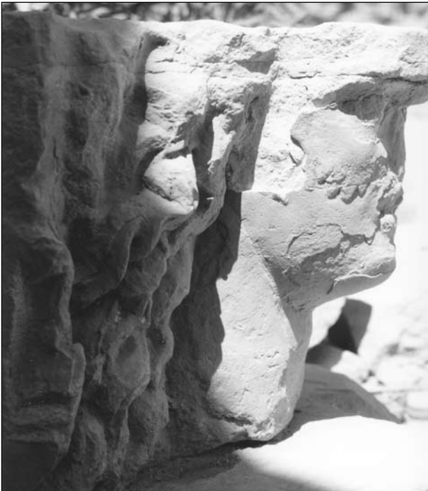
9a-b. Petra. Architectural panel with the bust of the personification of a spring (?).