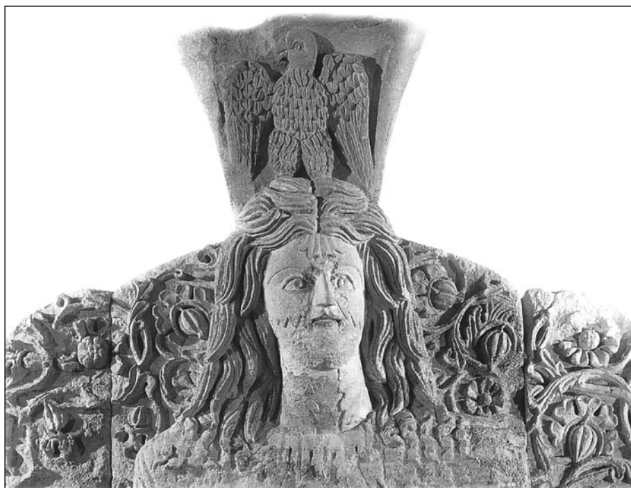
8. Relief from the tympanon panel with the bust of the personification of the ‘Ayn La‘bān (?). ‘Ammān, Jordan Archaeological Museum. Markoe 2003: fig. 41, Courtesy the Cincinnati Art Museum.

Beside the frieze one also needs to mention the so-called Atargatis panel, a semicircular panel above the entrance of the temple (Glueck 1965: 143-144 pls. 31-33; McKenzie, Gibson and Reyes 2002: 63-64; Markoe 2003: fig. 41), which depicts the bust of a female figure surrounded by floral motifs (FIG. 8). Following Glueck the figure usually is identified as the temple deity, which depicts Atargatis as a vegetation goddess, but I would like to suggest another interpretation. The body of the figure is covered with floral branches, which are directed towards the bottom indicating that the figure originates from the earth or even below. Even the neck and the face are covered with leaves. Such features do not fit Atargatis, but are characteristic of marine creatures in Greek art. There are two other Nabataean busts of the same type known, one from Khirbat Brāq (Parr 1960: 134-135 pl. 15,1), the other one from Petra (Lyttleton and Blagg 1990: 277 pl. 9). If one concedes that Khirbat Brāq is important mainly for its spring, the ‘Ayn Brāq, which provides water for Petra, this bust should represent the personification of that spring. The Petra bust (FIG. 9a-b) could represent the ‘Ayn Mūsā or the Wādī Mūsā, but having no context for the bust this remains still hypothetical. At Khirbat at-Tannūr one