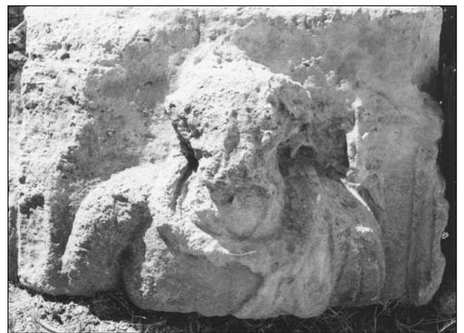
5. Panel from the frieze, Bust of the local male deity in a Zeus type. 'Ammān, Jordan Archaeological Museum.

Hadad-Jupiter; 396, 411 pl. 53a, Tyche with lyre; McKenzie, Gibson and Reyes 2002: 59-60). Again, a clarification of the shown deities is necessary. On the left a bust of Zeus is shown with a thunderbolt behind his left shoulder (FIG. 5). He is to be compared with the male deity of the relief of the cult figures where this deity is depicted as a mixture of the Syrian Hadad and the Greek Zeus (Glueck