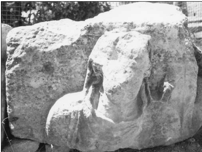
6. Panel from the frieze, Bust of the local female deity in a Hera type. ‘Ammān, Jordan Archaeological Museum.

The counterpart of Zeus in the frieze on the outer right depicts a female deity capite velato and holding a double sceptre (FIG. 6). She can be recognized as Hera, the wife of Zeus. Like Zeus she bears a torques. Hera is much less common in the Levante, but when she is pictured she sometimes holds ears of grain and points to the fertility of the country as the female deity of this temple. The female paredros of the Zeus type deity is depicted in a smaller relief which could reflect the cult figure again as a Syrian-Greek composite (Glueck 1965: pls. 44, 161b; McKenzie, Gibson and Reyes 2002: