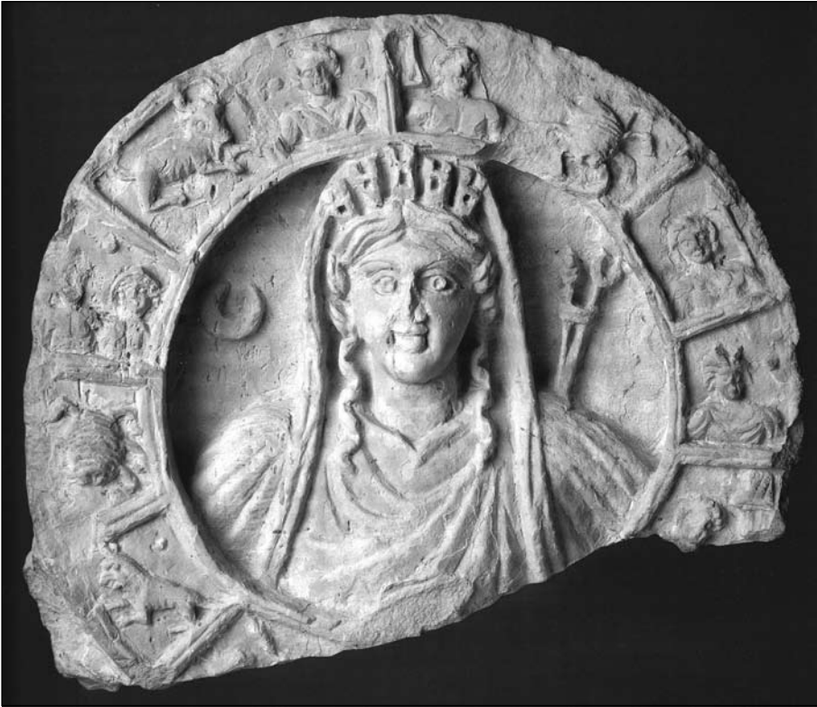
2. Zodiac with bust of the local female deity as Tyche. Cincinnati Art Museum. Markoe 2003: fig. 198, Courtesy the Cincinnati Art Museum.

“sunbul”; kind information by F. Villeneuve) and the fishes symbolize the living water.