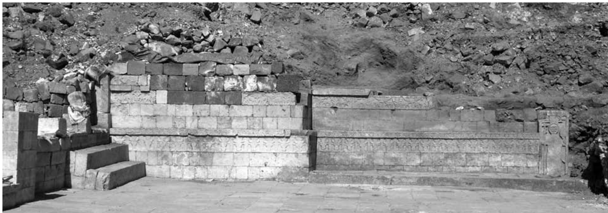
FIGURE 2. The eastern interior wall of the “Stone Building” (Ingo Buchmann).