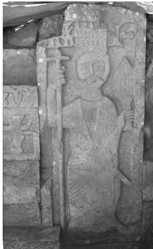
FIGURE 1. A life-size basalt relief image of a member of the noble class (Ingo Buchmann).

Indications for dating are paradoxical: the calligraphic style of the damaged Sabaic wad b [b] (literally, the god Wadd is “father”) begins as early as the fourth century CE (cf. Kitchen 1994: table 63). On the other hand, Byzantine and other stylistic parallels suggest a possible fifth-century