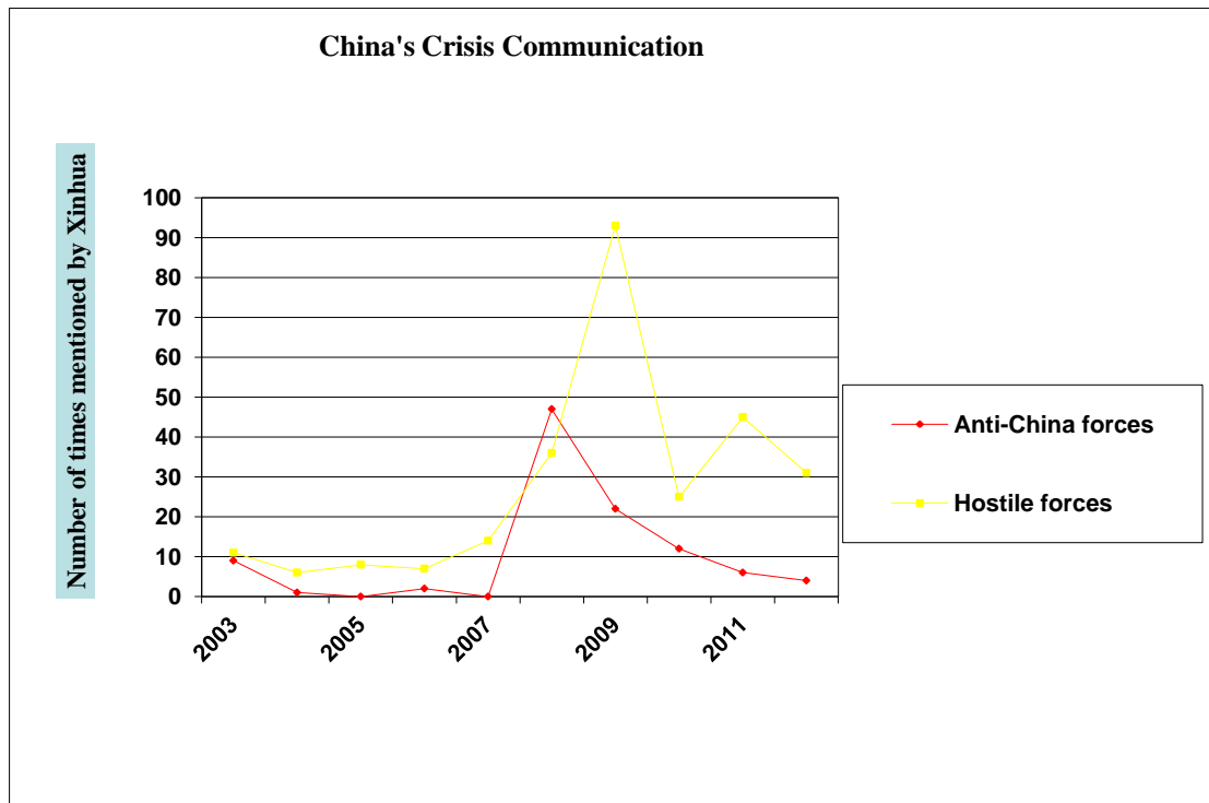
Graph 9.I: China’s Crisis Communication

problem for China’s foreign language media. Xinhua news releases still speak of “overseas splittists,” 212 “anti-China forces,” 213 “wolf in monk’s robes,” 214 etc.