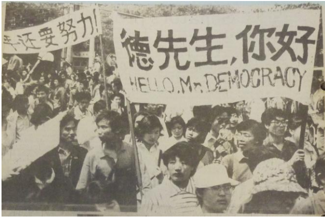
III. 5.1. China Daily , May 5, 1989

that during the protests, China Daily reports were almost exclusively written by staff reporters, 231 with only a few Xinhua releases. 232 Compared to reports by China Daily staff, Xinhua releases were relatively pro-CPC, often speaking on behalf of the government and Li Peng 李鹏, but there were also some exceptions. 233