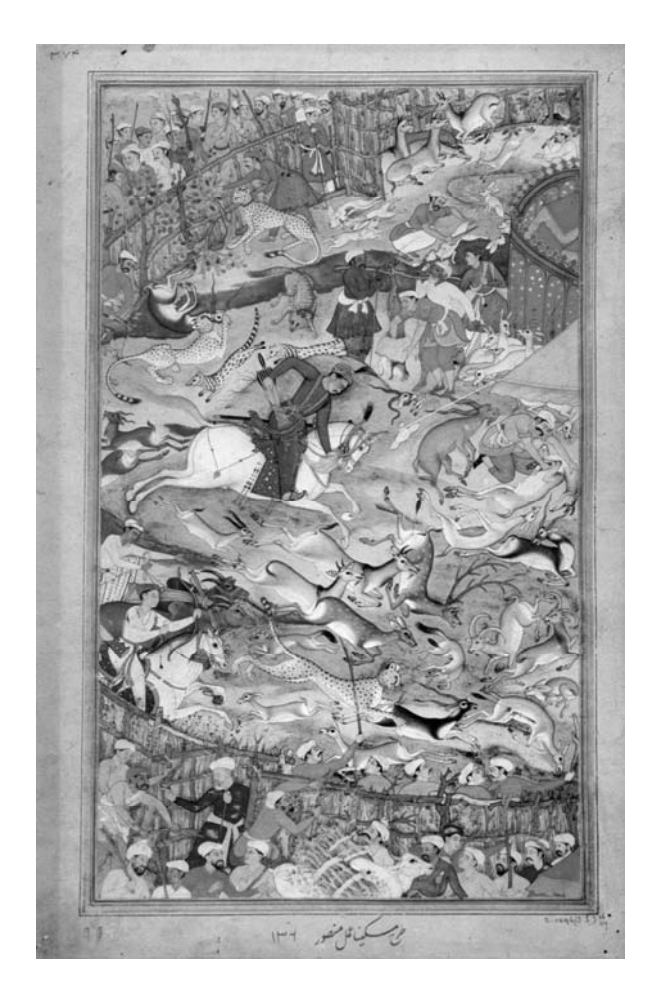
Figs. 1-2: Akbar engaged in a hunt near Lahore, double page miniature from the Akbarnama , painted by Miskin and Mansur, Victoria and Albert Museum, London.