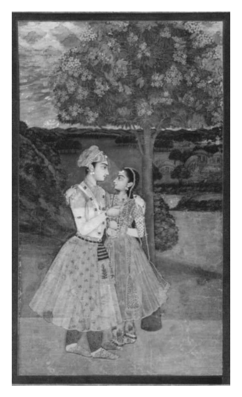
Fig. 3: Mughal Prince offering wine to his mistress (c. 1740), San Diego Museum of Art