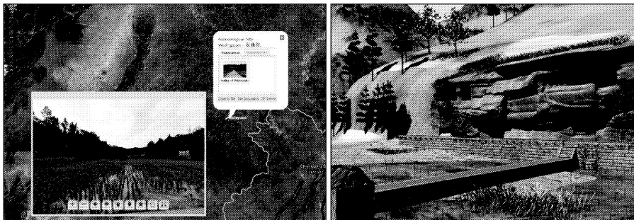
Figure 2. Parts of the Web-Atlas Interface. Left: Spatial access to meta data and site information, right: detailed 3D view of one site.