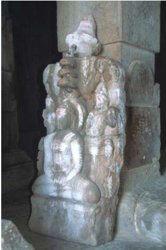
Plate 7 The main image of the former Jaina temple at Hallur has been taken from its pedestal and smeared with ashes

An interesting sculptural programme has at least in parts been preserved in connection with this original Jaina construction. A Jina sculpture, which once must have been installed in one of the two superimposed sanctums of the temple, now rests against one of the pillars in the central aisle of the closed hall, close to the entrance of the temple. It consists of a seated Jina sheltered by a triple parasol and flanked by two attendants. As no recognising symbol ( lanchana ) has been preserved in connection with this statue, a closer identification is unfortunately difficult. Following Shaiva practice, sacred white ash has been applied to the statue, signalling its annexation and indirectly its desecration (Plate 7).