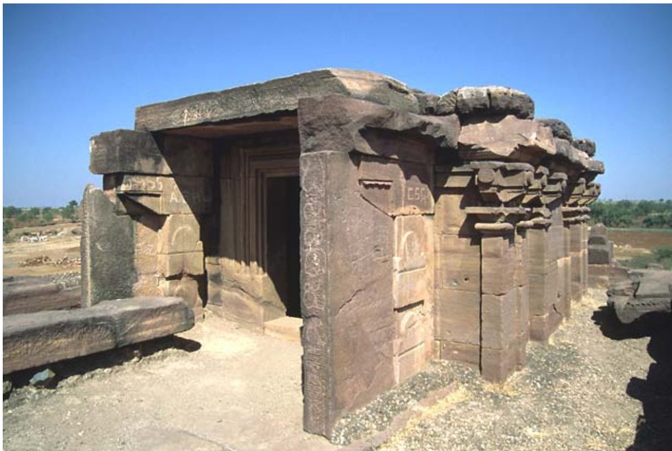
Plate 8 The raised shrine on the roof of the temple at Hallur is not used by the Lingayat community