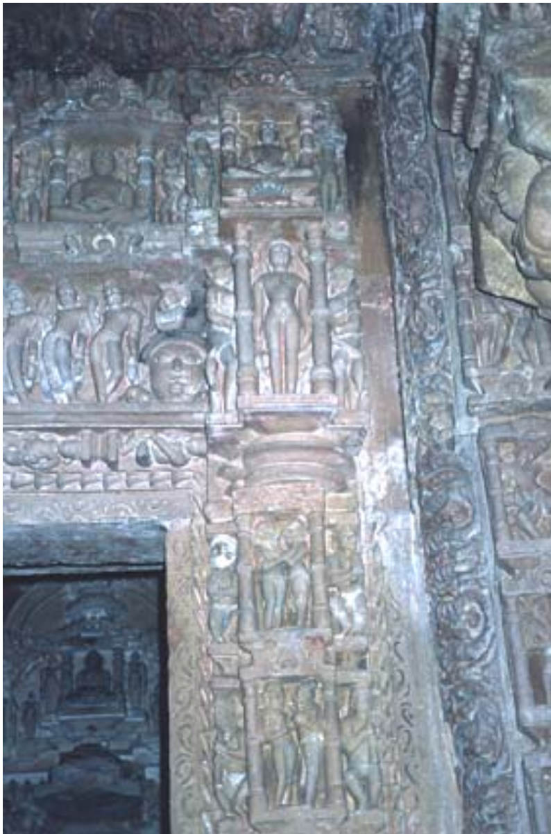
Plate 4 Because the doorframes of the Parshvanatha Temple are re-used parts, wide cement grooves were needed to keep them in place

re-used parts from destroyed Jaina temples at the site, such as the dilapidated Ghantai Temple nearby. 27 The entrance to the image chamber is surrounded by a further double door-frame. As in the example discussed earlier, this too was cemented in at a later stage (Plate 4). As such, the presence of Jaina imagery on the door lintels of the temple cannot be taken as proof of the original dedication of the shrine. The availability of additional door-frames at the site is supported by the fact that parts of ornamental door-frames have been employed inside the closed hall on the north wall. They frame one seated and two standing Tirthankara figures, and cover the blind wall where the former open balcony has been filled in.