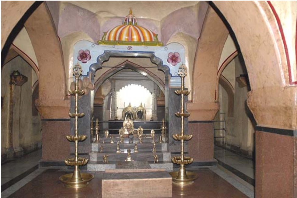
Plate 11 In the shrine at ground floor level at Kagvad, former Jaina kshetrapalas are venerated as representations of Shiva

not to lose all, but to preserve enough to create something new that can last because it provides a link to the past.