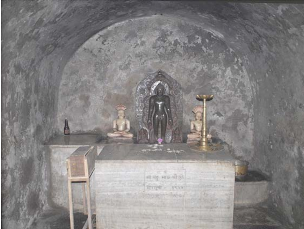
Plate 10 One storey below the temple at Kagvad is a shrine dedicated to Parshvanatha

Lingayas who took over the deserted temple space above. Today, the ground floor level, is a Lingayat temple. Noteworthy, however, is that the images venerated inside are Jaina bronzes of kshetrapalas , guardians of the sacred temple complex. These have been re-appropriated and are worshipped as representations of Shiva in figural shape (Plate 11). 45