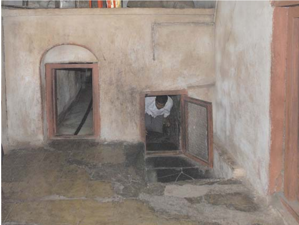
Plate 9 A complex system of underground corridors below the temple at Kagvad provides access to two subterranean floor levels

It is not entirely clear whether the lower floor levels were only excavated at that point, or whether they existed prior to the Islamic threat in the region. Many Jaina temples throughout the country have chambers below the main level of access to the temple in order to provide cool and comfortable apartments for travelling ascetic teachers. 42 Noteworthy is that two subterranean floor levels are accessible below the temple at Kagvad, and that Jaina images have been installed and are venerated on both underground levels. On the floor positioned one level below the ground is an image of Parshvanatha (Plate 10), whilst two floors below the ground is a shrine dedicated to the Jina Shantinatha. 43