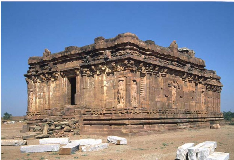
Plate 6 On the outside of the Lingayat temple at Hallur, the former Jaina imagery has been preserved

Particularly fascinating with regards to the next two examples of temple conversions, is that in the first case study at Khajuraho, the architectural fabric of the edifice has carefully been altered to adapt it to the new ritual requirements, and its sculptural format on the inside as well as on the outside of the temple has been changed to reflect iconographic features associated with the faith of the latest owners. However, it was not only the aim to adapt the temple to the new use, but also to conceal the act of acquisition and transfer. Particularly for the Jainas, whose central tenet is non violence ( ahimsa ), it would have been difficult to openly admit to the forcible take-over of a sacred structure originally belonging to a different faith. By obscuring the act of conversion, the Jainas also aimed at establishing religious continuity and an unbroken presence at the site. 37