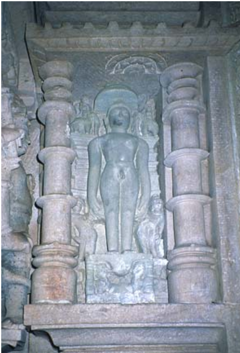
Plate 5 In the Parshvanatha Temple, re-used images of Tirthankaras have carefully been inserted in the niches in the ambulatory

in 1852. The additional shrine at the back appears to have been constructed after Cunningham's last reported visit to the site. This is likely to have been constructed shortly before 1860, when the Jainas had the temple re-consecrated with a new image of Parshvanatha.