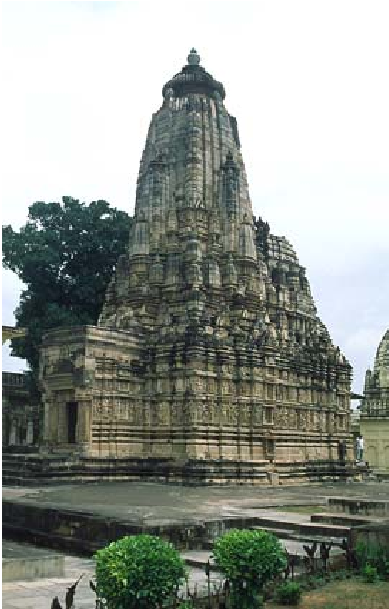
Plate 3 An additional shrine has been constructed at the back of the Parshvanatha Temple at Khajuraho

Clear indications that the temple was initially constructed as a Hindu edifice and only later converted to Jaina ritual use, can be identified in several areas of the sacred edifice. A careful examination of its external walls reveals that it used to have two lateral transepts with window openings, which were later enclosed (Plate 3).