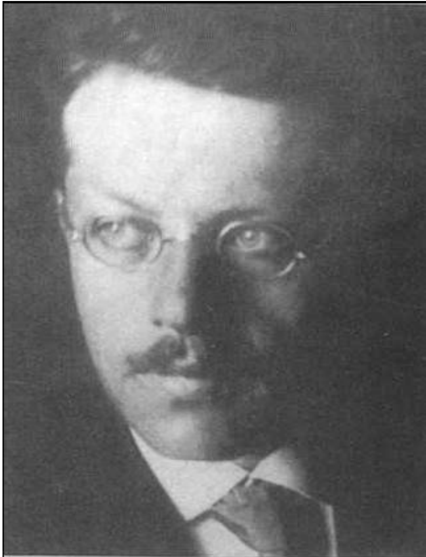
Franz Rosenzweig (1886-1929)