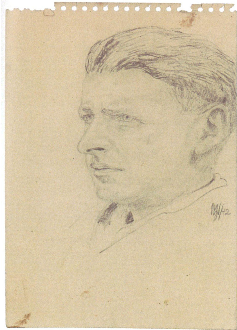
Emmanuel Levinas (1906-1995)