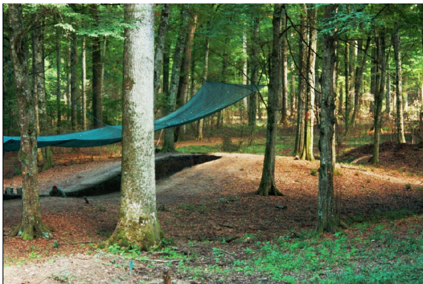
Fig. 5: Mound 3 at Purić-Ljubanj.

Throughout the process of mound building the choices of materials from the landscape are made in a consistent manner based on their properties of colour and texture, suggesting a deep knowledge of local landscape and its significance for an expression of local identity. Managing of natural materials is noticeable in the layers of the white, concrete-like capping made of calcareous concretions taken from the subsoil; in the selection of black or yellow clays for various stages of building the mound and in relation to various burial depositions; and in the varying degrees to which these materials are refined or purified from natural inclusions.