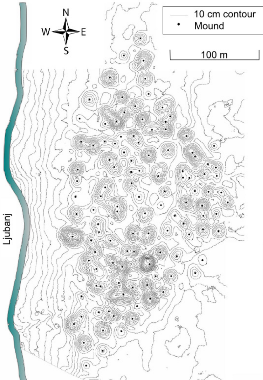
Fig. 4: Layout of cemetery Purić-Ljubanj. Image by Andreja Malovoz and Mu-Chun Wu. © Andreja Malovoz / Stjepan Gruber County Museum