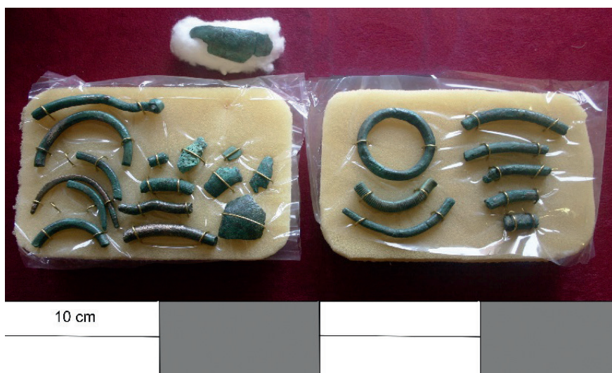
Fig. 2: Bronze finds from female grave no. 43, Zmijino.

Mostly completely preserved urns found in the contexts of the graves show the diversity of vessel types, ceramic material and its firing, and decoration. A few children's and female graves contained rich finds of bronze jewellery (fig. 2) such as bracelets of differing make (cast and wrought) bearing various types of geometric ornaments, ornamental pins, tutuli, necklaces, rings, decorative bronze plates, etc. Grave goods included whole ceramic vessels and, what is particularly interesting, ritually broken ceramic vessels which were found concentrically arranged around the burial urns. Unlike the in situ broken pottery at Purić-Ljubanj, broken pottery at Zmijino was removed from the original context and carefully placed around the urns (fig. 3) prior to filling the burial pit with loose soil. The act of the burial ceremony at Zmijino seems to have been more detail focused and more directly related to the deceased individual than the one at Purić-Ljubanj. This difference in the presentation of individual identities between the two groups opens questions about its perceived role in the affirmation of group identity through burial practice. The burial ceremony at Zmijino was also comparatively less visually striking. It remains open whether the main funerary event was in fact represented by this final act of burial, or whether there was, perhaps, some prior act conducted elsewhere at the cemetery, by the funeral pyre, or in the settlement itself.