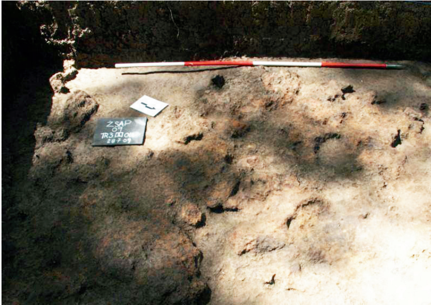
Fig. 6: Burnt oxidised surface in mound 3, Purić-Ljubanj.

burned during a visually impressive event which included breaking of both fineware and domestic settlement pottery. These fires were carefully managed as they required a considerable amount of fuel and air, and were fired to at least 600°C. 23 The surface was afterwards left to cool, so as to turn red, and was swept clean of ash and charcoal before being covered with a final layer of clay, i.e., the closing of the mound.