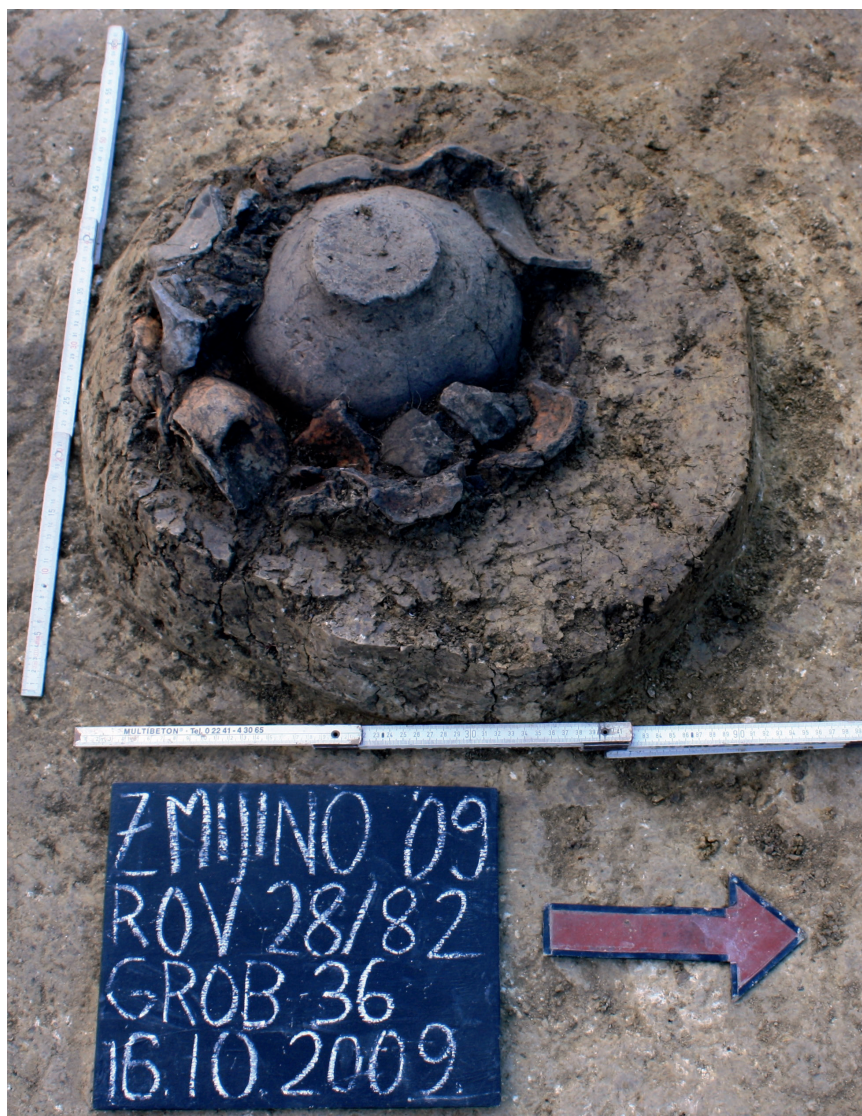
Fig. 3: Broken pottery arranged around the burial urn, grave no. 36, Zmijino.

The funerary practice at Purić-Ljubanj includes selecting, altering, and depositing natural materials in such a way as to make a visual performance in which colour symbolism may have played a part. 22