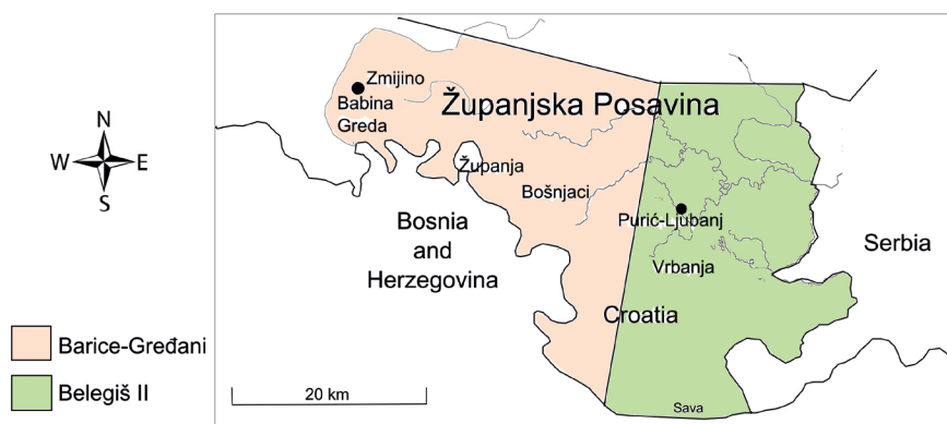
Fig. 1: Map showing areas of Barice-Gređani and Belegiš II groups in Županjska Posavina. Image by Andreja Malovoz. © Andreja Malovoz / Stjepan Gruber County Museum

The aforementioned elaborate burial procedure at the cemeteries in Županjska Posavina exhibits a deviation from the canonical burial practice of the Barice-Gređani group. Just as Purić-Ljubanj opened questions on the presentation of local identity within the Belegiš II group circle in Županjska Posavina, so do the Barice-Gređani group cemeteries in the area pose those questions in relation to their mother group. All the graves at Zmijino are single person burials, with one instance of dual burial of a woman and a child (grave no. 36, Zmijino). The graves are equally distributed throughout the cemetery and, having no mounds to mark individual graves, were most probably marked by a sign made of some degradable material. That they were marked in some fashion is evident in that, despite the longevity of the cemetery, the graves in no way interfere with each other. The grave goods include instances of depositing bronze jewellery, broken pottery, and whole ceramic vessels. In Županjska Posavina this phenomenon extends to the east to the area between the villages Bošnjaci and Vrbanja where it meets the Belegiš II group (fig. 1).