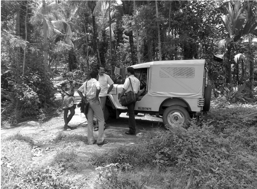
Figure 6.2 NGO workers on their way to visit suicide families in Wayanad.

would be lost if the suicide epidemic turned out to have no link to agrarian crisis, or worse still, to not be an epidemic at all. It was clear to the lower-level NGO staff that Caritas was interested in Indian farmers' suicides and that local NGOs had an interest in Wayanad being part of the nationwide crisis, in which, according to K. Nagaraj (2008), more than one hundred thousand farmers had committed suicide. One local observer of the NGO scene offered the following take on the politics of farmers' suicides: