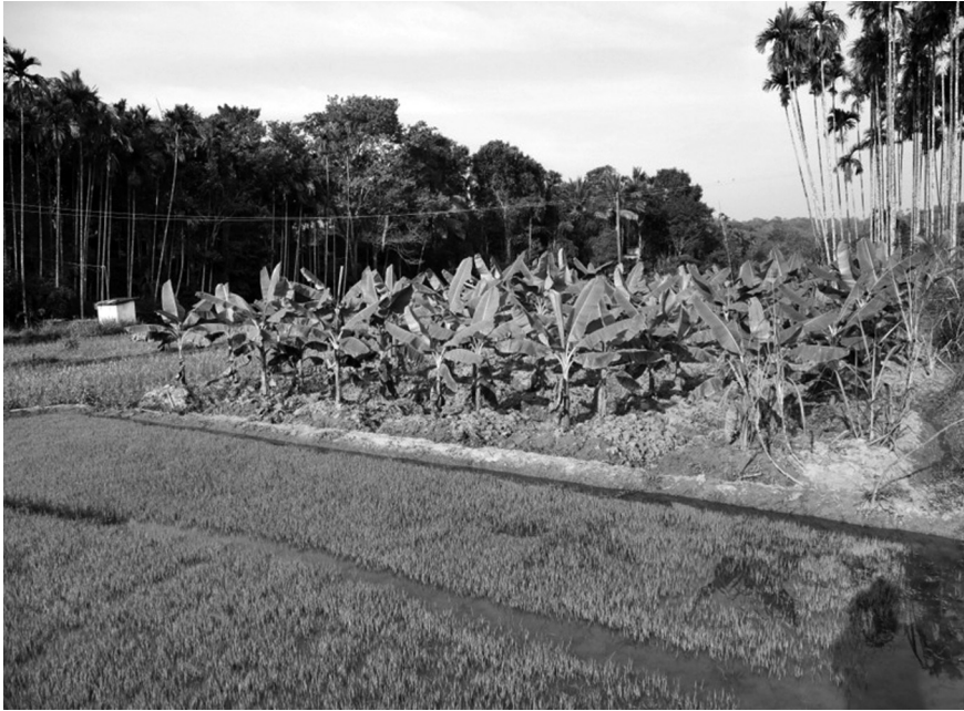
Figure 6.1 Agrarian landscape in Wayanad, showing banana plantation in wet-rice field. Photograph by D. Münster, 2013

bananas need a dry soil, so they drained the vayal . But the vayal conserves the water; it holds it for at least ninety days. For two or three years they were making money and a real race set in. Then the yield went down. So they started using chemicals excessively; they call it “medicine” [ marunnu ]. The use of pesticide exploded since the late 1980s. Now they suffer from drought, winds destroy the plantations, the fields are useless and fallow now.